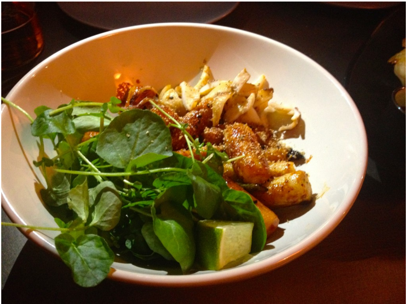
Chuka Ramen Dok Boki

We started with Dok Boki , which consists of rice balls with Korean chili and sesame. They tasted just perfect. Then we had some tasty dumplings filled with butifarra and Chinese chives.