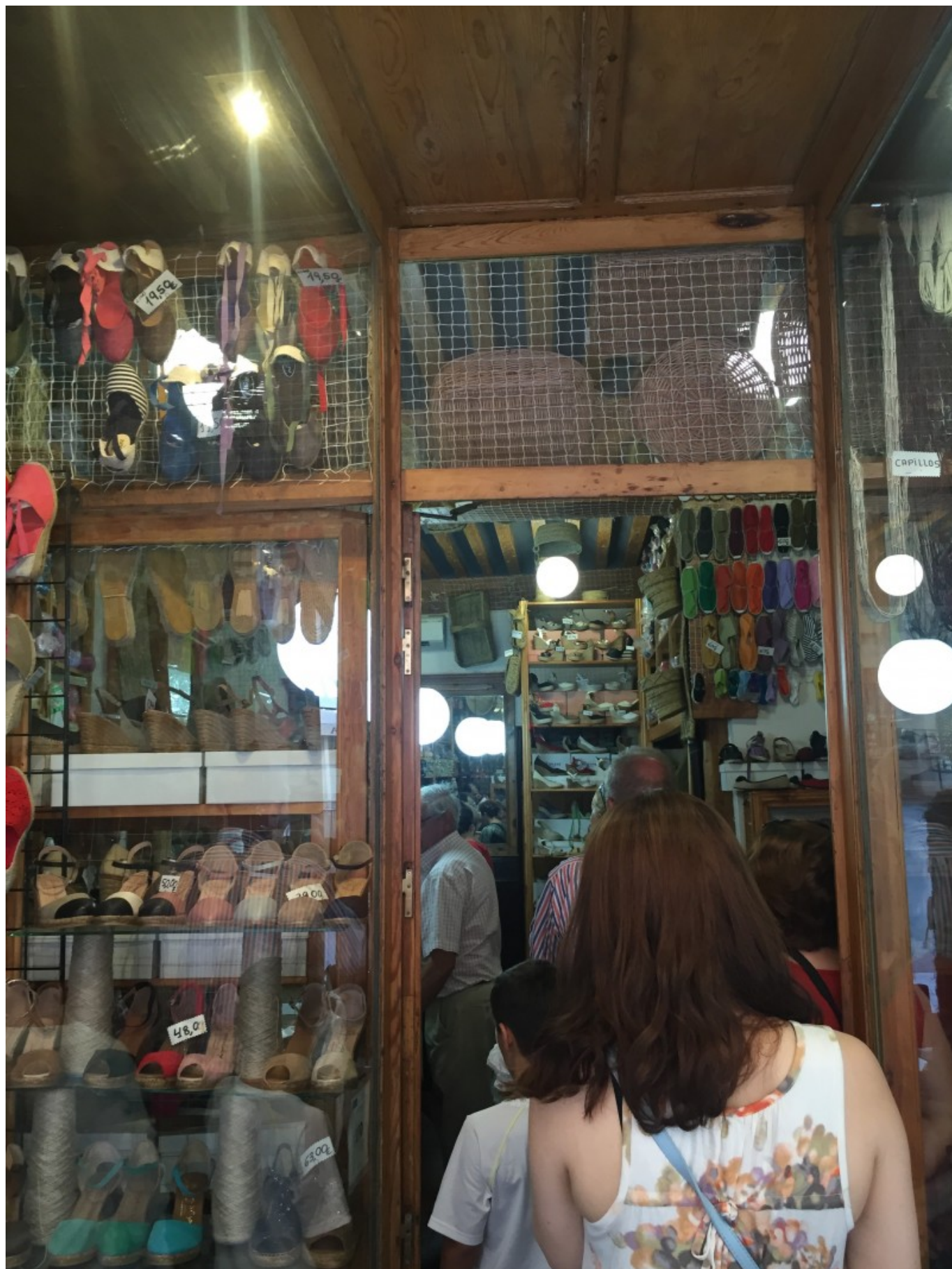
Casa Hernanz Calle de Toledo, 18