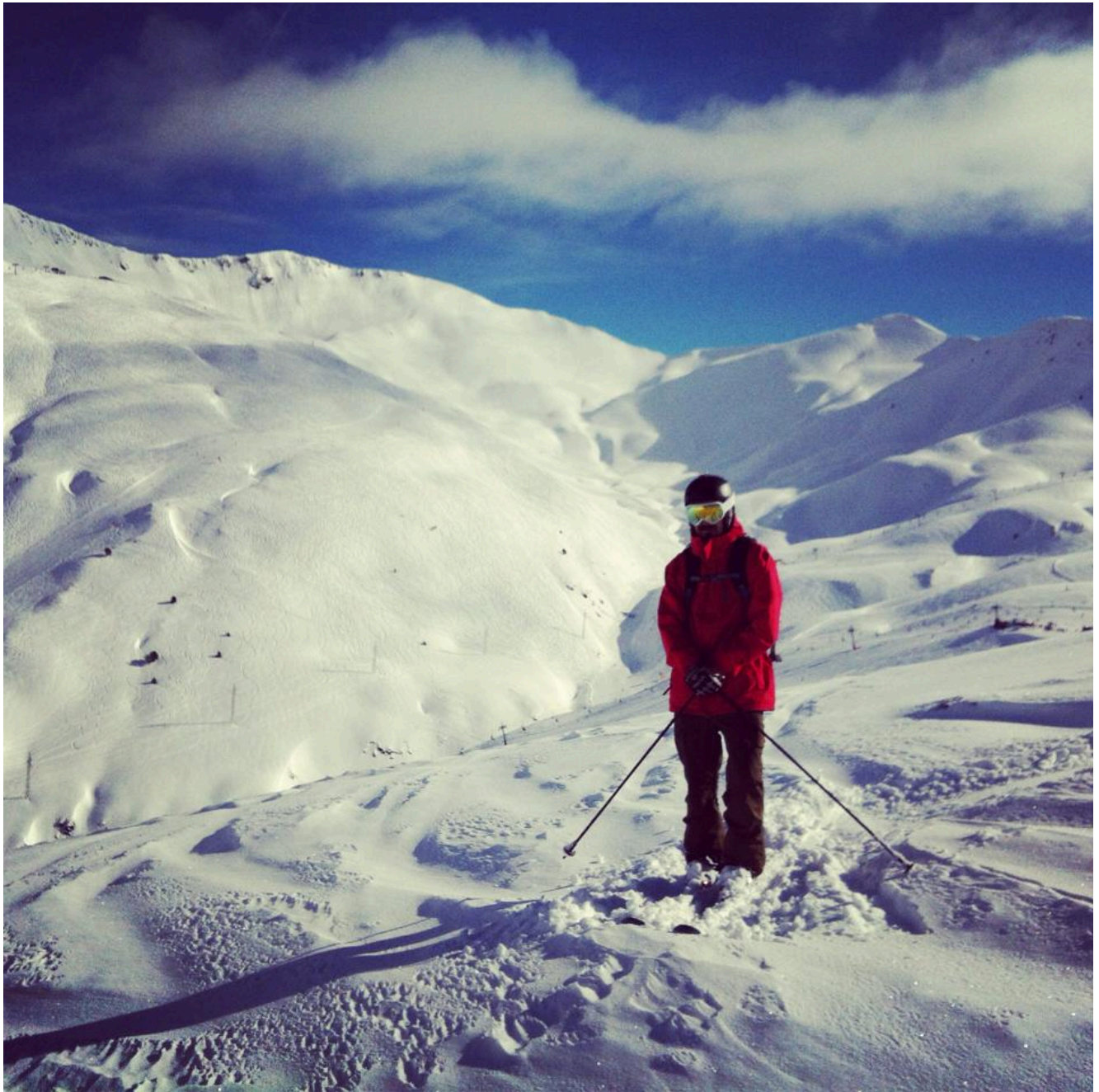
Powder day in Astún!

Smaller than Formigal and less crowded, if you get Astún on the right day the snow can be incredible (see piste map here ). You can stay in the town of Jaca and get a bus, so it's perhaps slightly easier for a last-minute trip than Formigal. There's another resort right next to Astún called Candanchú which is also excellent, although the terrain is considerably more challenging.