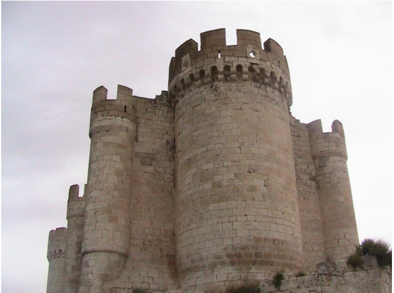
The castle of Peñafiel

incredible collection of Middle Age castles. On my last trip, I visited the official 'National Monument' of the castle of Peñafiel, which is located where all good castles are- on top of a hill.