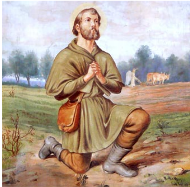
San Isidro doing his thing.

Today, in what we now know as the Pradera de San Isidro (a park in the Carabanchel neighborhood south of the center-metro Marqués de Vadillo) his miraculous springs still flow. A hermitage dedicated to the saint was erected in the area during the 14th century, then rebuilt in 1725 near one of Isidro's famed springs, and believers still pay their respects and collect the healing water during the May festival thrown in his honor.