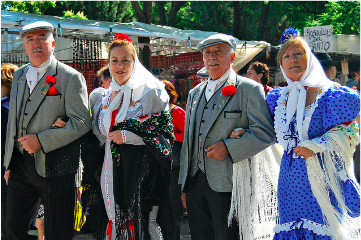
Chulapos y Chulapas