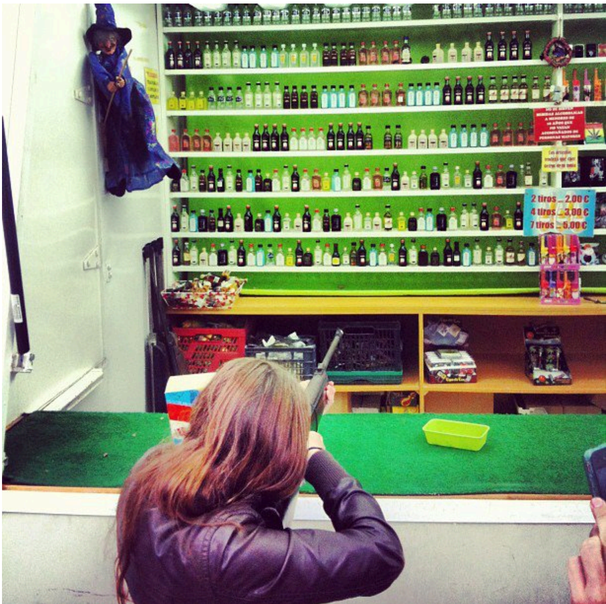
Everyone's favorite childhood fair game, "shoot the

5. Check out the tacky/amazing carnival (Saturday, Sunday, Monday / Pradera de San Isidro): Like all carnivals, it has rides of questionable safety and hordes of roaming teenagers, but it's a good time nonetheless. Last year I enjoyed playing the childhood favorite, "shoot the single-serving alcohol bottle off a shelf with a cork gun." There's also a ferris wheel that offers a good view of the city.