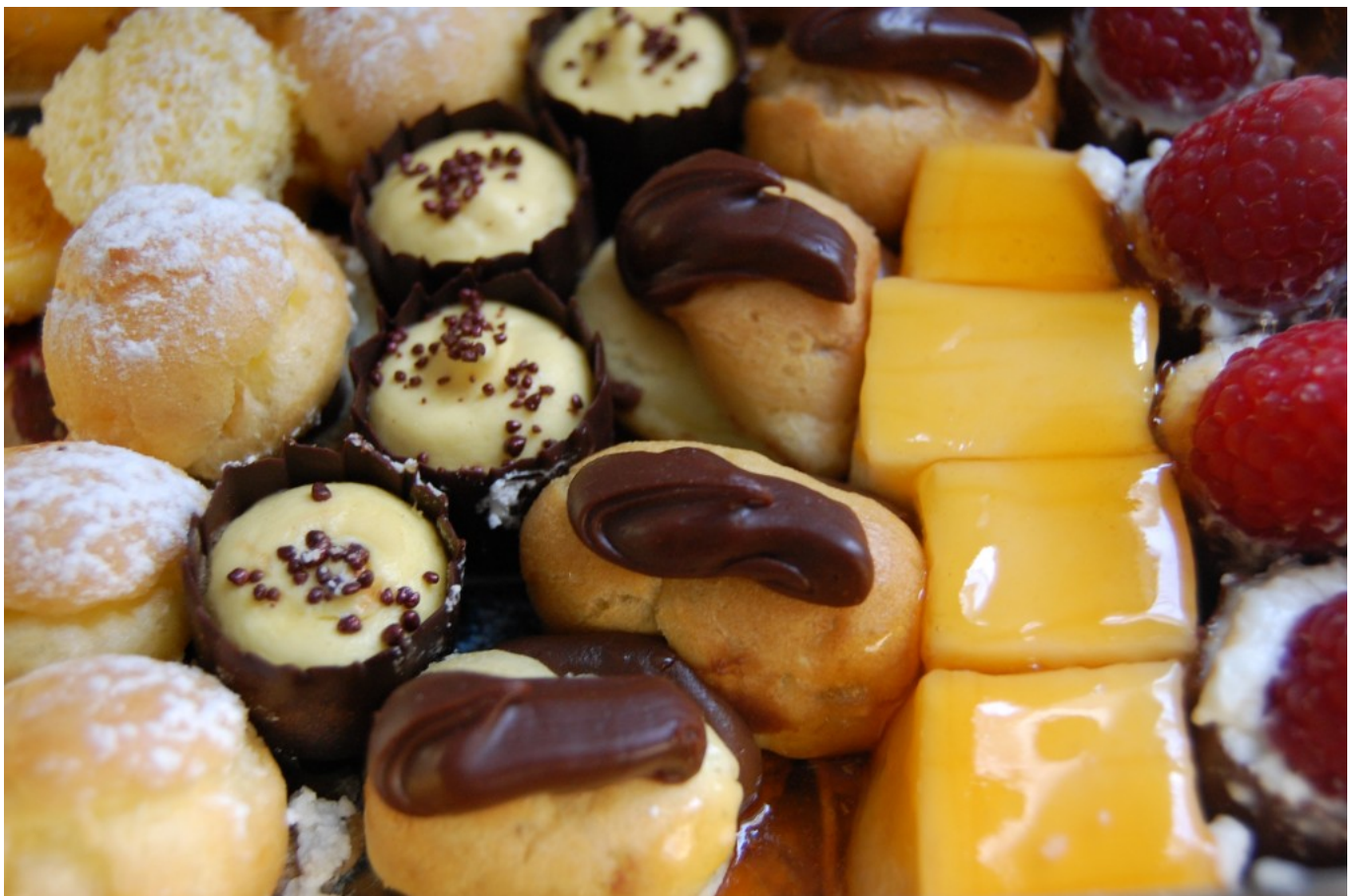
The mini selections of pastries like this bandeja are wrapped