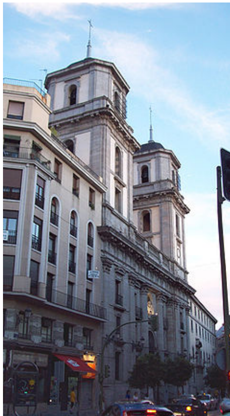
San Isidro church

That church visible from the Plaza Mayor as you walk down toward La Latina is called San Isidro church.