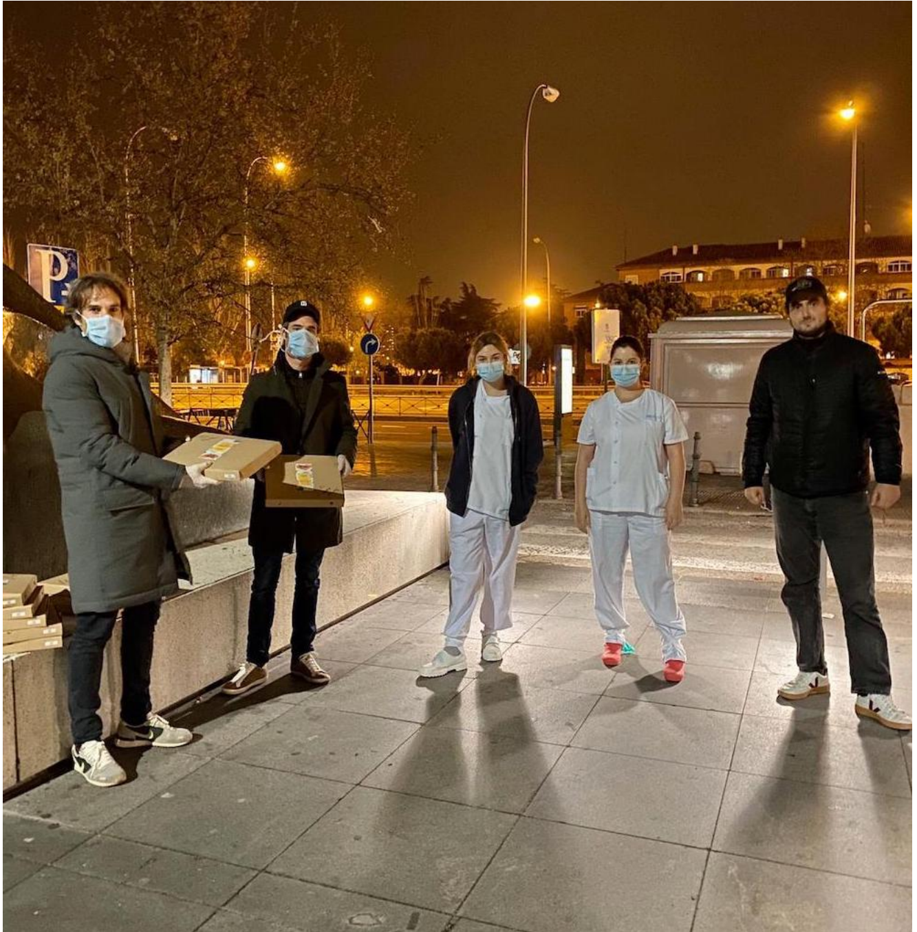
Managers of Grupo Larrumba restaurant group, one of the participants in #Food4Heroes

restaurant group Grosso Napoletano sent a WhatsApp message to all their contacts so they could deliver pizzas to Madrid's hospitals. It went viral – hundreds of messages from medical professionals came in from dozens of different hospitals – which motivated even more partners to volunteer and join forces to show their support.