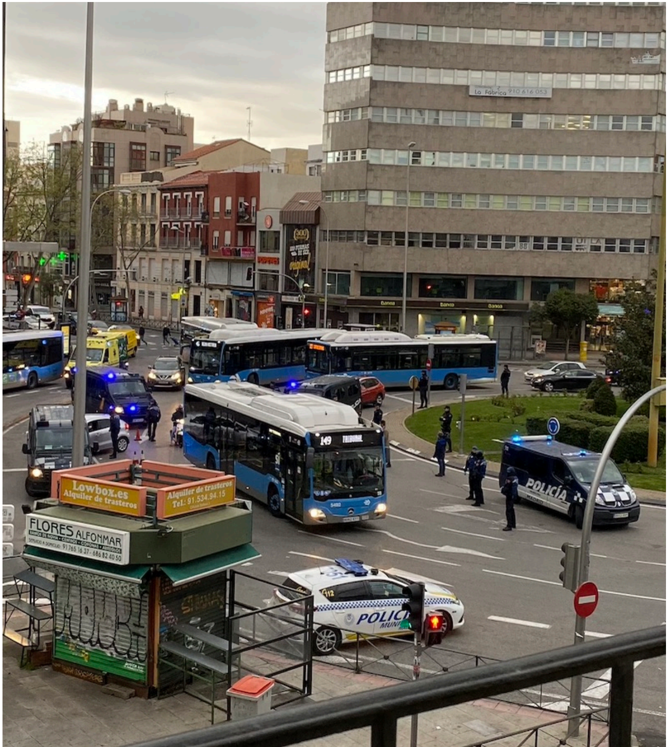
Police checkpoint outside my apartment

Then the lockdown happened. My once solo working environment is now shared with my boyfriend, who is also working from home. He works in sales and is constantly on the phone. All. Day. My once calm and quiet sanctuary has been invaded by ringing cellphones and noisy conference calls. It's been extra hard to concentrate, but we're working together to find