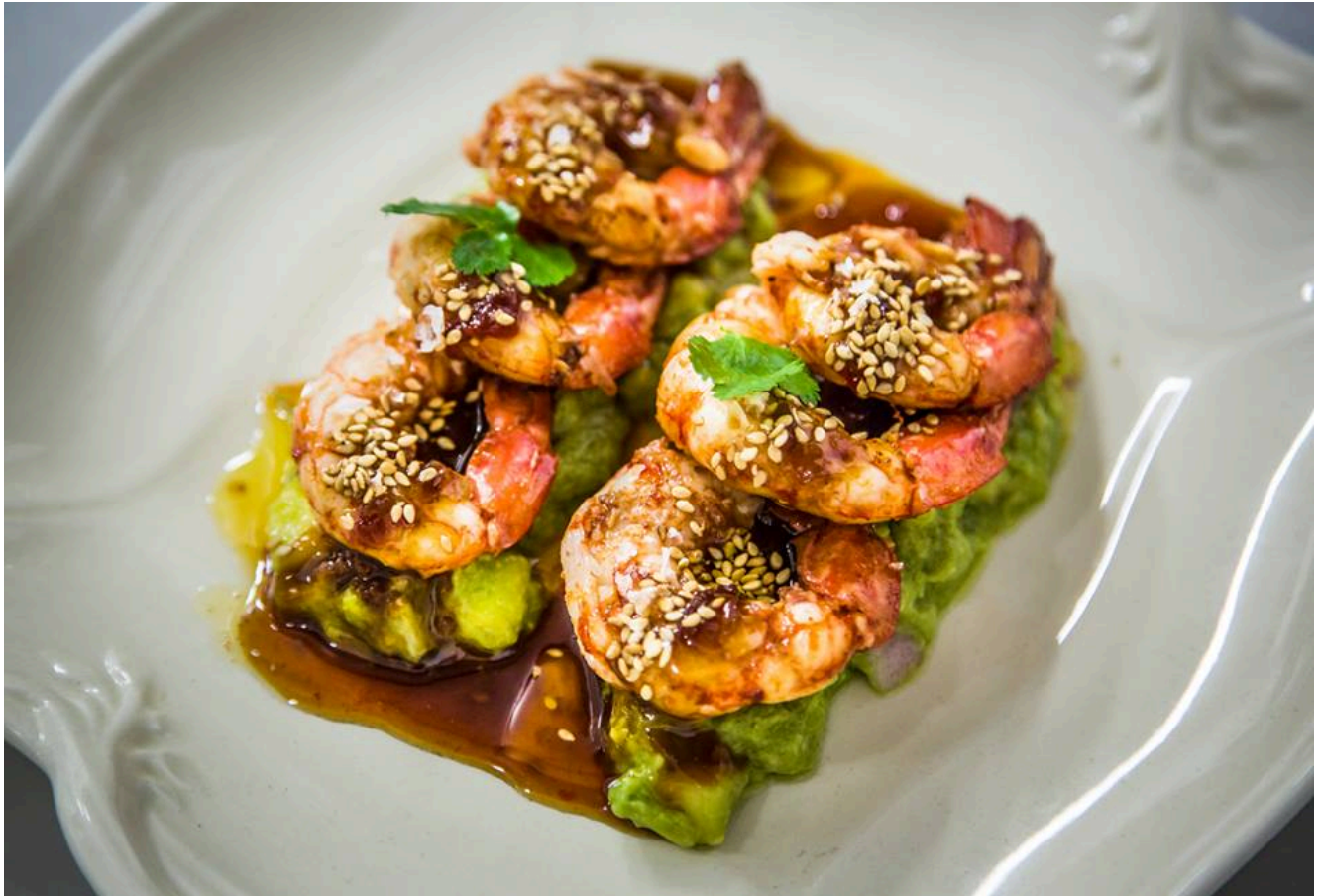
Gambones a la brasa – grilled shrimp

I was warned by the hip (but not scarily so staff) that if you want a table on a Saturday night you need to be booking up about a week in advance. My concern is that after a rave review that might up the ante to a fortnight. Either way, Lady Madonna is the kind of place that cocoons you with its culinary chicness but has you pining for your Oysho jammies by the time you pay the bill (or maybe that's just me/an attack of my eyes being bigger than my belly!).