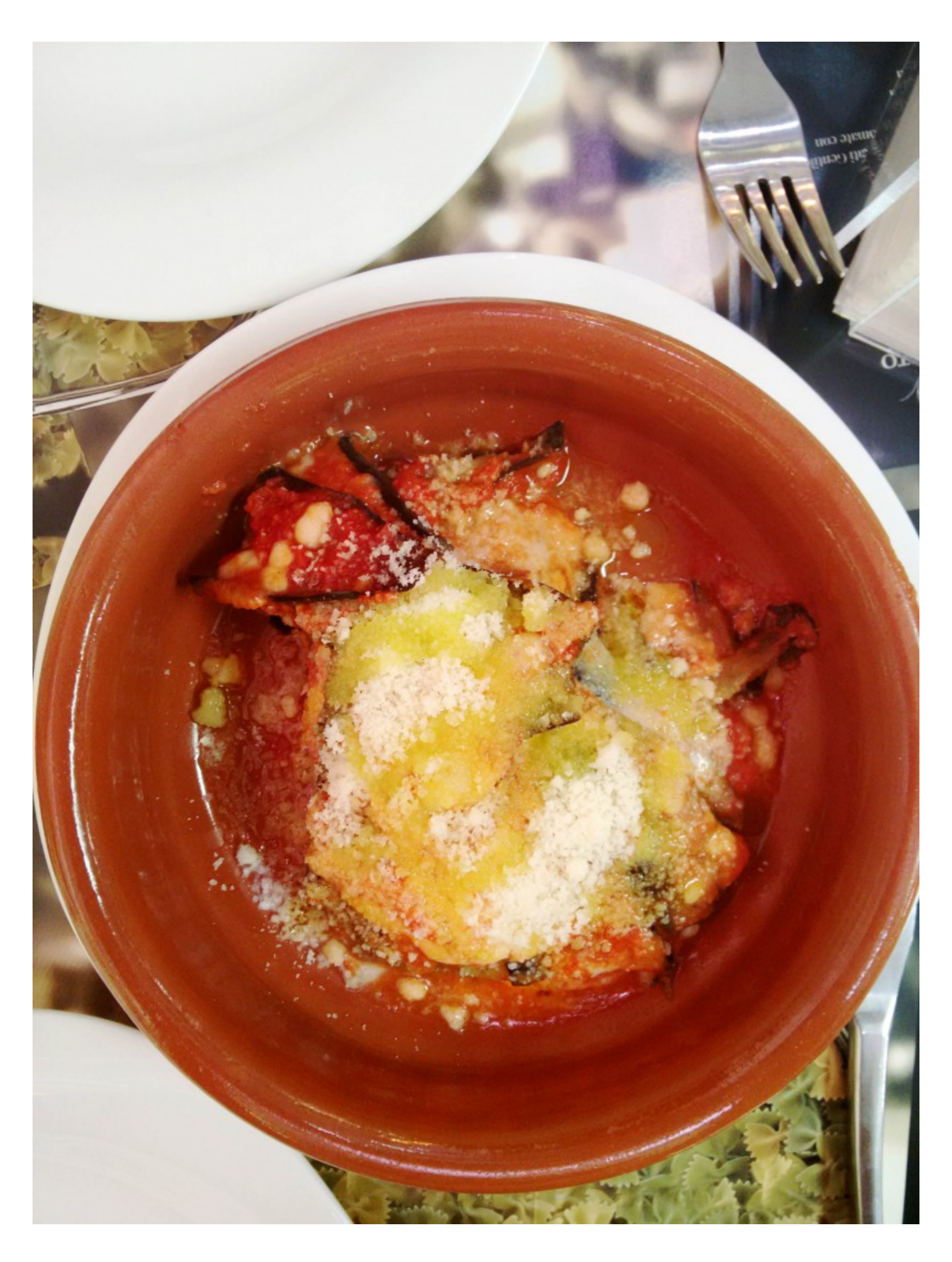
The food was absolutely incredible and plenty between us — we're glad we shared! The bill came to \pmb{\in} 26 exactly, which felt