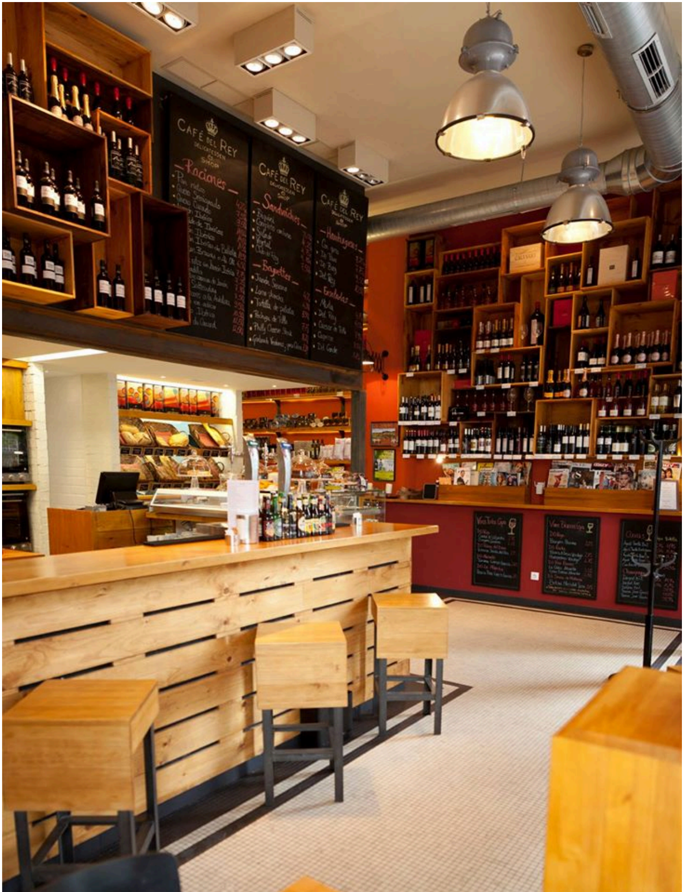
photo from their Facebook , as are all the high-quality pics below!

The front part of the venue is a casual bar, delicatessen and