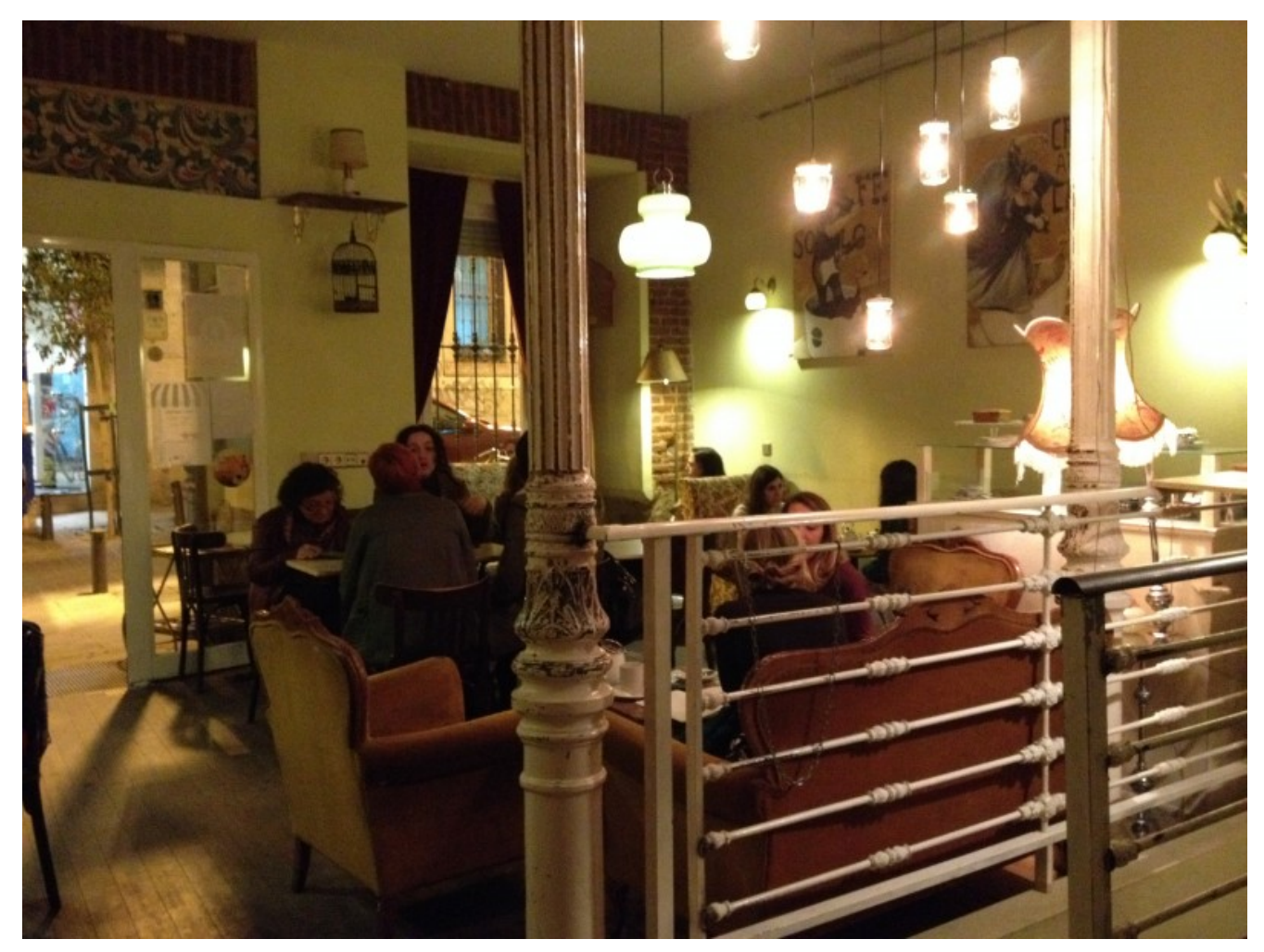
funky furniture at La Paca

of Spain fills the room: old sofas, lamps, Galician mirrors, and bird-cages. La Paca's owner is an antique collector who travels across Spain in pursuit of treasure troves. You can find his finest pieces either sold at his vintage store La Republicana, or displayed at La Paca.