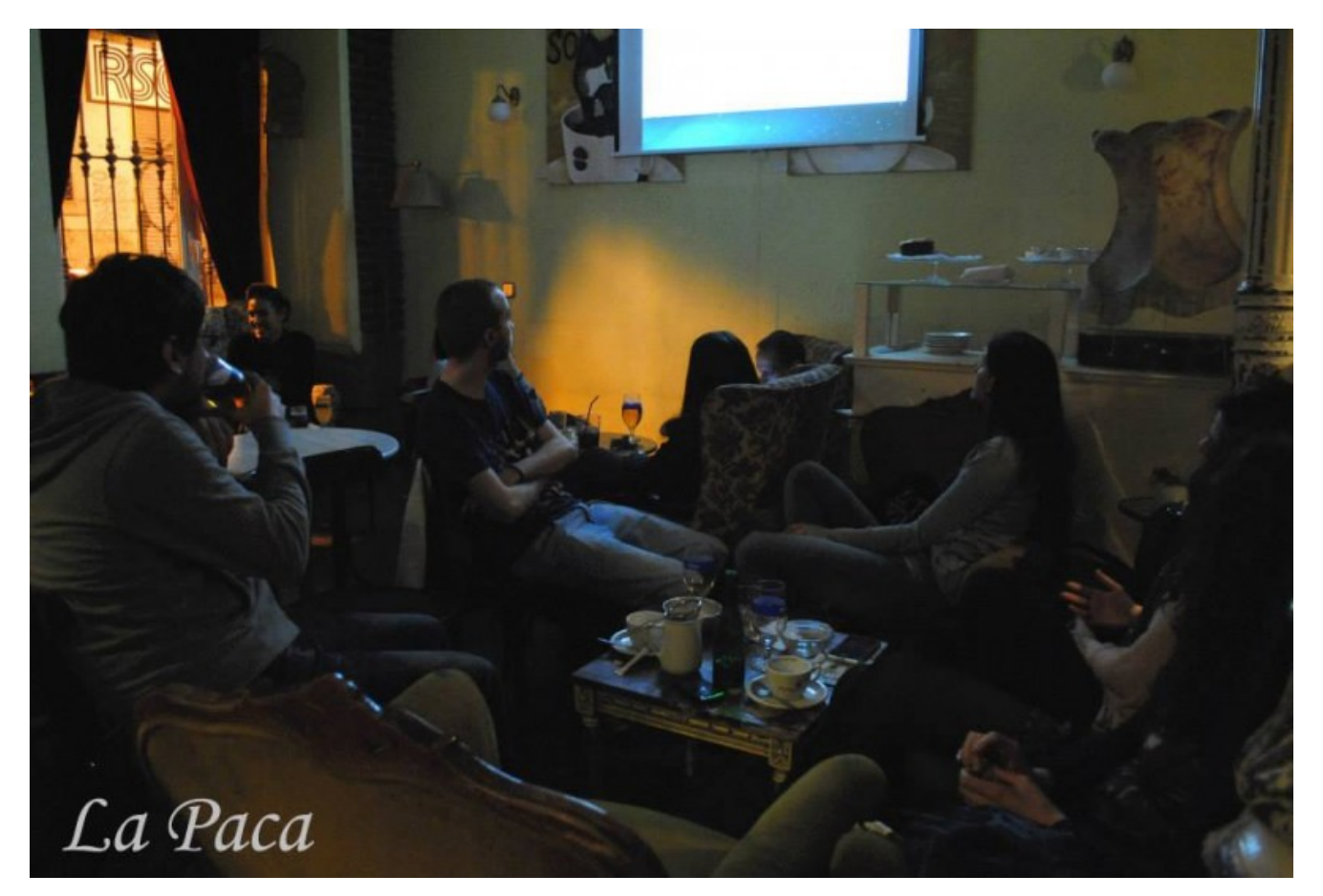
free movie nights on Wednesdays at La Paca in Malasaña

On Thursdays, La Paca holds acoustic music performances, making room for up and coming Spanish artists. Although Wednesday movie nights and Thursday concerts are held regularly, La Paca showcases several other events such as theater performances, independent markets, English classes, clown shows, and art exhibitions. In fact, when it comes to art exhibits, they're booked until 2016!