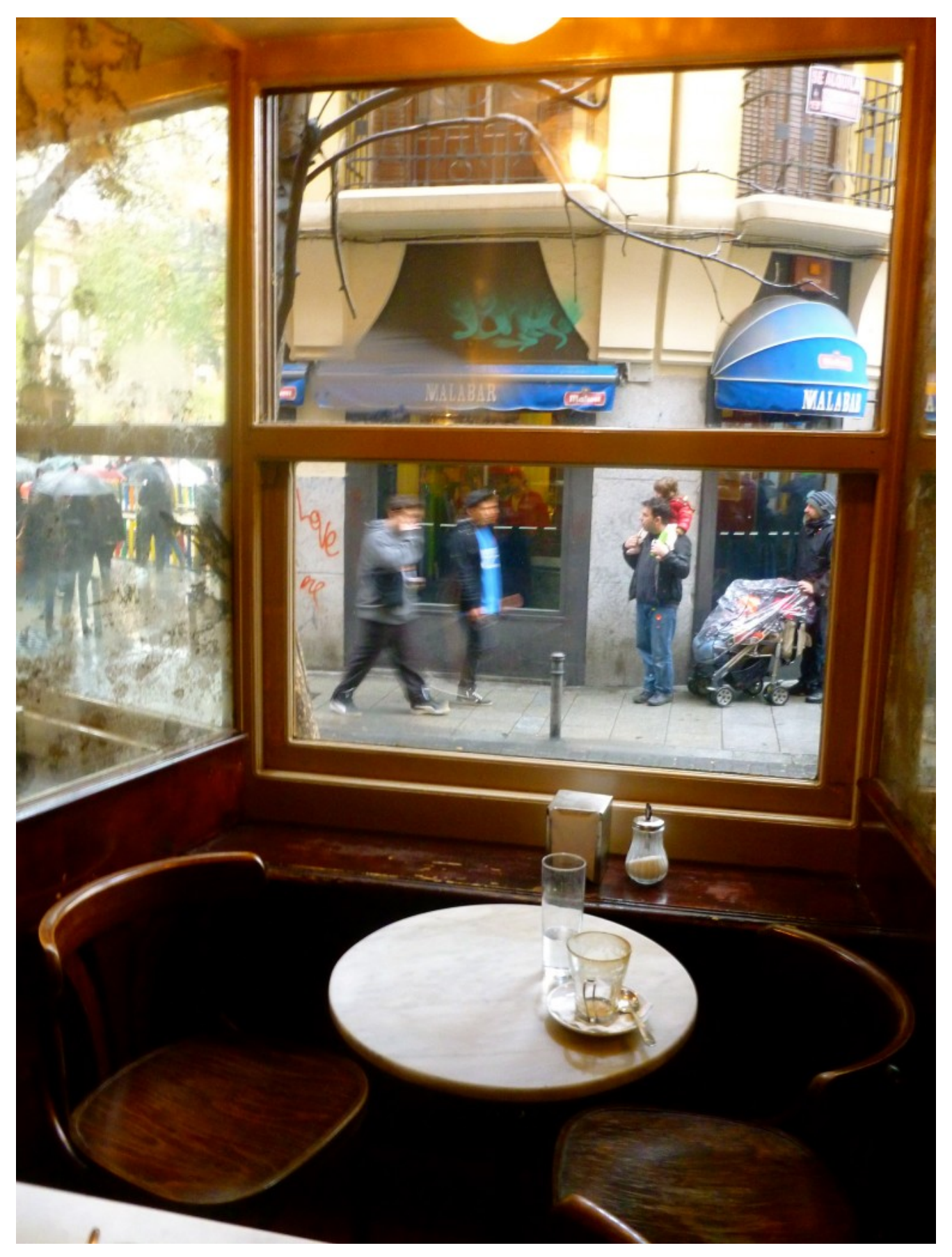
Peer through the bay window at passersby in Plaza de Dos de Mayo in Malasaña

In my mind, cafés aren't about who has the prettiest foam;