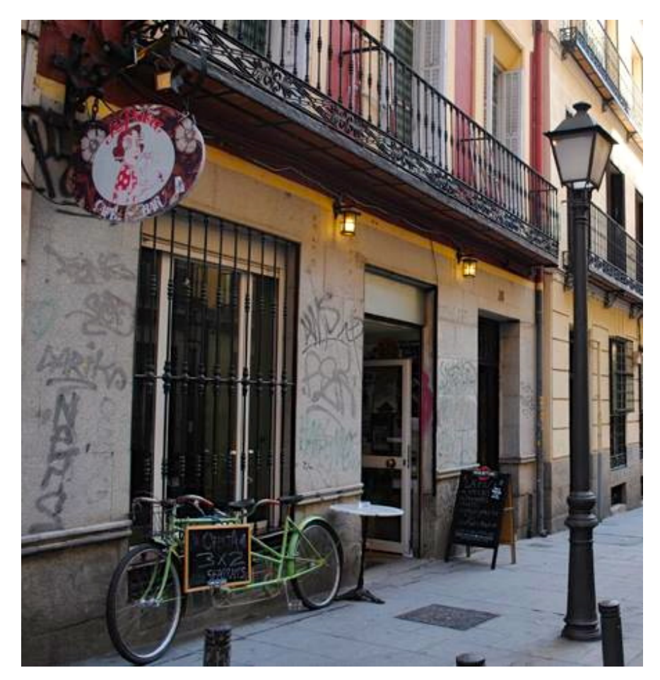
La Paca's facade on calle Valverde in Malasaña

As you walk through La Paca's door, you feel like you're in the right place. This funky café in Malasaña is always a good choice when you're in the mood for a coffee, a beer, or something stronger.