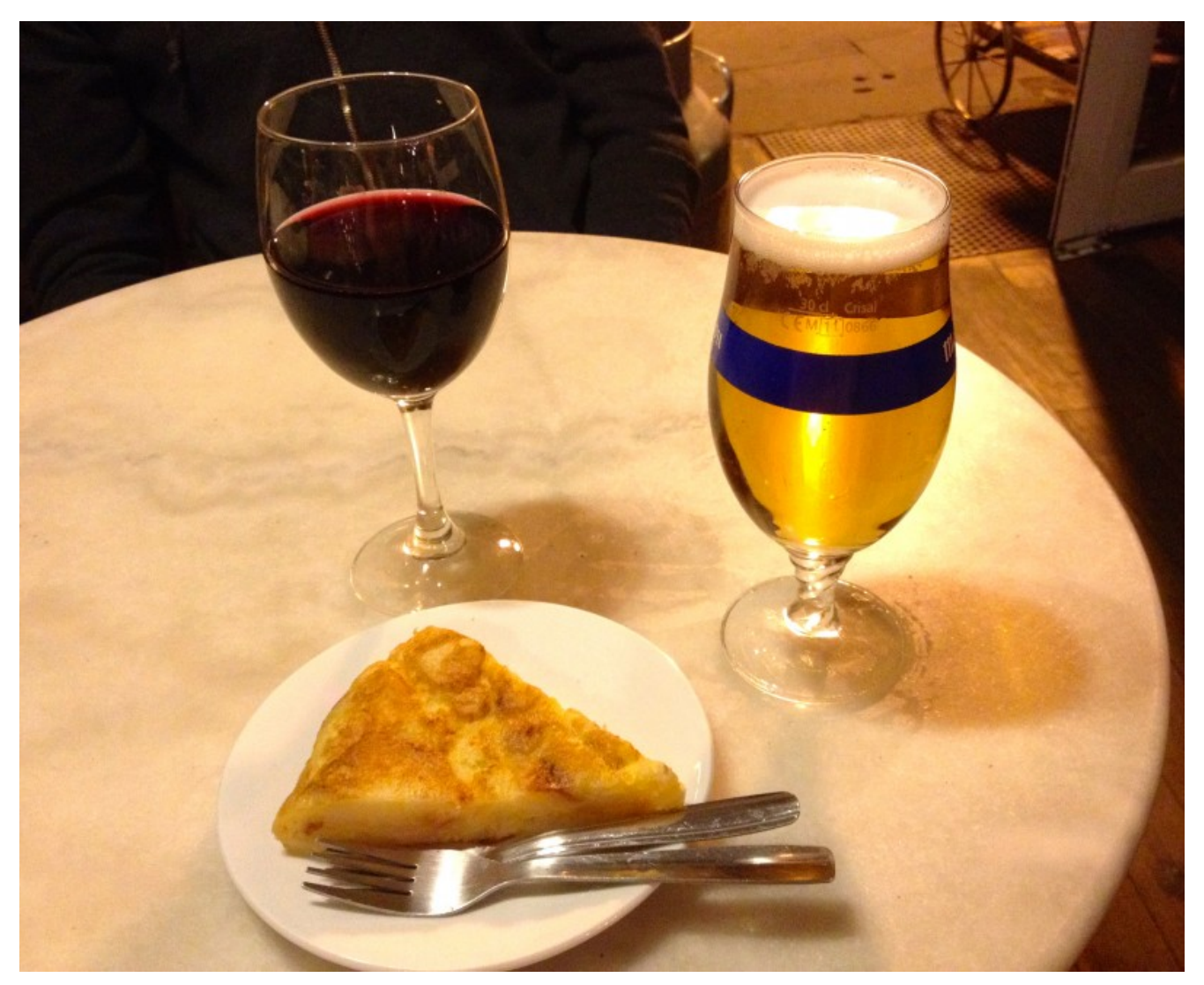
my favorite tapa at La Paca

In this quintessential Malasaña café , you've also got to try their tortilla de patatas (homemade Spanish omelet), it is my favourite!