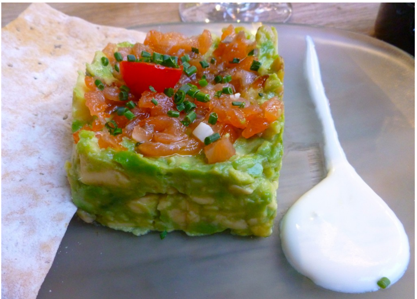
tartar de aguacate con salmon