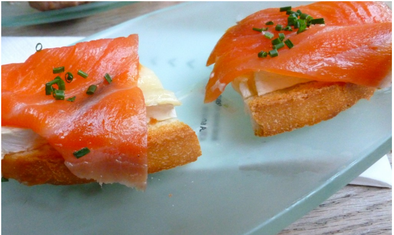
tosta de salmon con brie