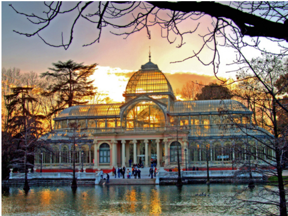
Palacio de Cristal

It is an easy pick but a great place to start with because you get away from the noise and hectic life of the city. You invite your date for an aperitivo to the café (on paseo Venezuela) next to the pond in the centre of the park. However you shouldn't linger too long with the drinks. After the first copa you should take your date to Palacio de Cristal in Retiro or show them the now abandoned zoo that used to be in Retiro. For both do a little research and make sure how to get there because you can get easily lost. My personal favourite is the rose garden located towards the side of Av. De Menendez Pelayo. It is incredibly impressive when you walk along and are met by a resident peacock. It will also take you to the restaurant. If the sun is setting though take the route to Palacio de Cristal .