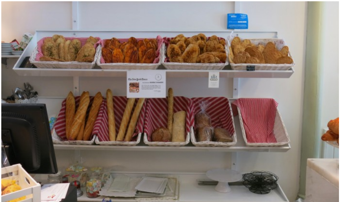
Maria's Bakery in Zurbano

de Bailey's," "tarta de queso con salsa de mora," even the oft-elusive "red velvet."