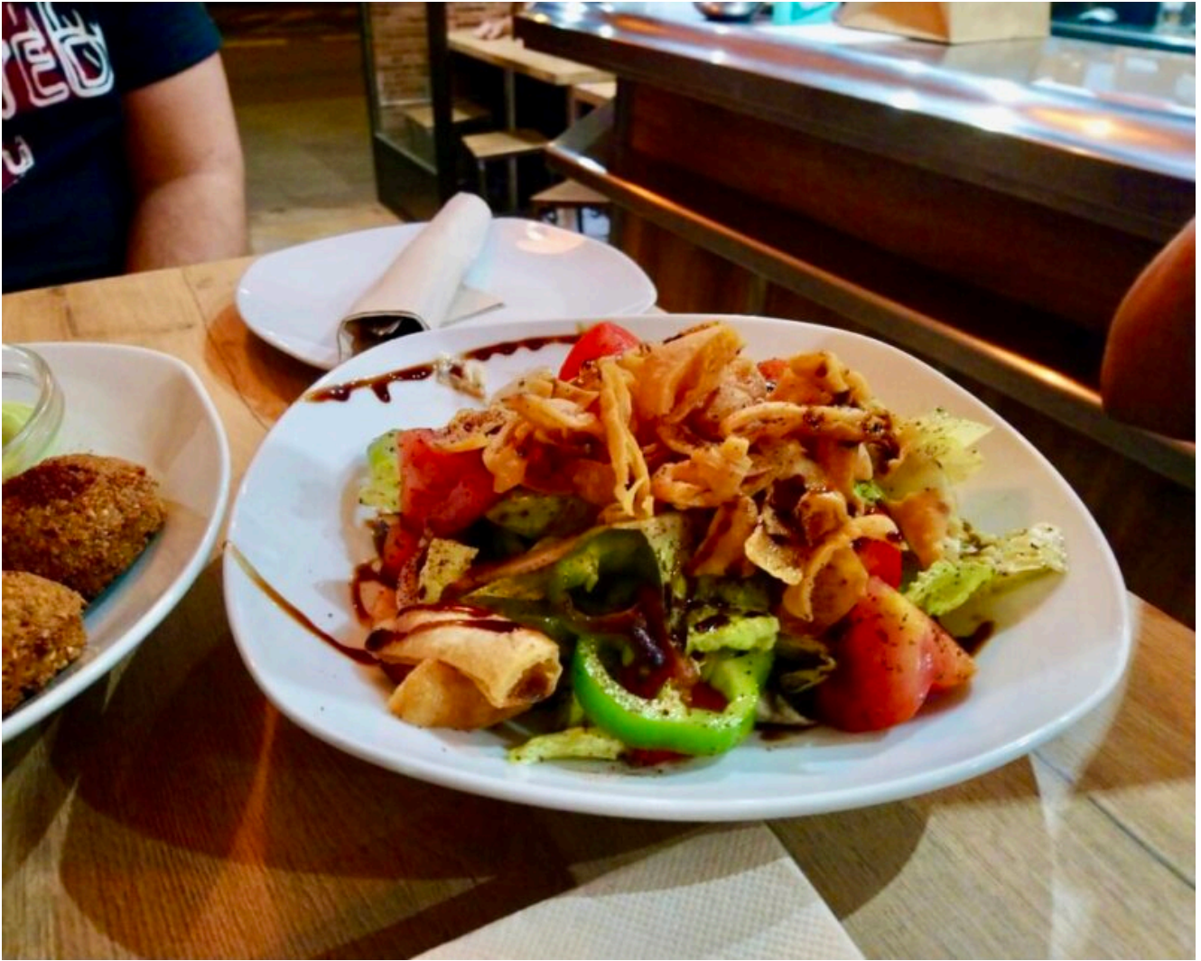
Fatoush salad topped with fried Arabic bread (vegan)

Onto the main dishes: Hurak bi isbau was my favorite dish of the night, and also one that Tina raved about. It's a traditional Syrian stew made of lentils and homemade wheat dough—with a rich, hearty and sweet flavor. For me, it's the epitome of comfort food. For Hala, it's much more than that.