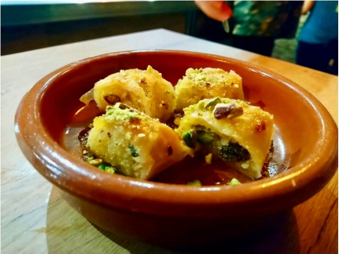
Baklava with a honey substitute (vegan)

The quality of the food is fantastic and prices are very reasonable. Not only that, but by coming here or ordering delivery, you're supporting a sustainable mission while getting a wonderful taste of family-style dishes and stories from around the world.