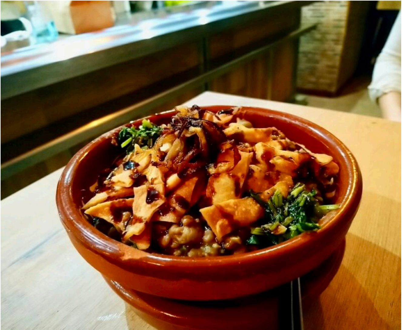
Hurak bi isbau: comforting lentil stew (vegan)

We also ordered Shish , a Syrian skewer with chicken and fresh vegetables. It's covered in a flavorful sauce that you get to sop up with Arabic bread and freshly made rice—the plate was sparkly clean by the time we were done with it.