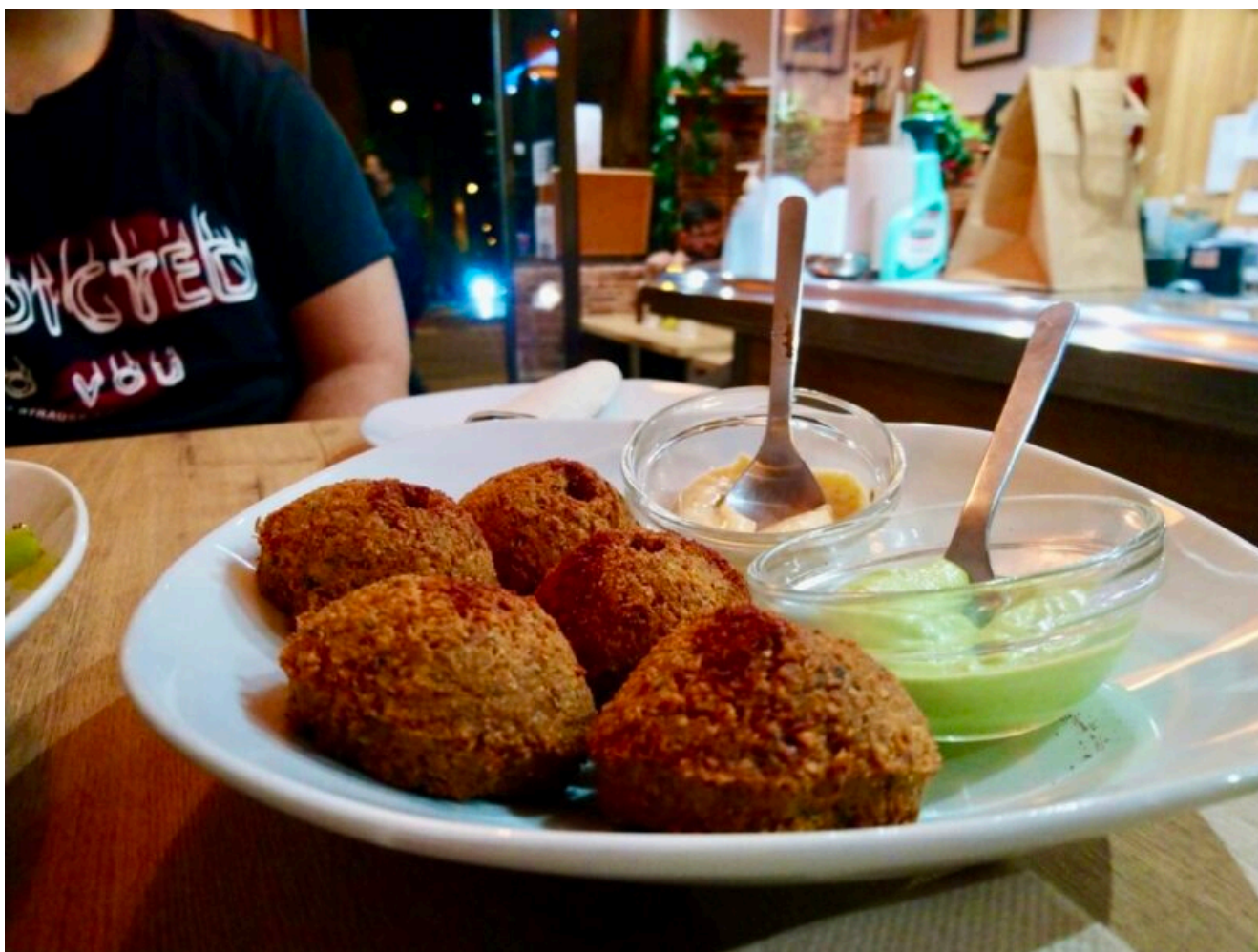
Egyptian-Sudanese falafels (vegan)