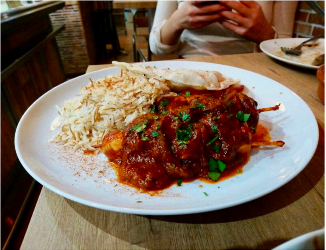
Shish: chicken skewer with rice and vegetables

To top it all off, Tina surprised us with baklava . My dad's from Greece so I've had my share of baklava growing up, and I can tell you this was totally different! Hala makes it with her own syrup mix instead of honey, so it's very vegan friendly, sweet and tasty.