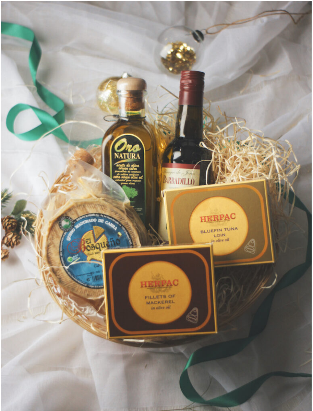
A basket with products from Lambuzo's store (long-lasting