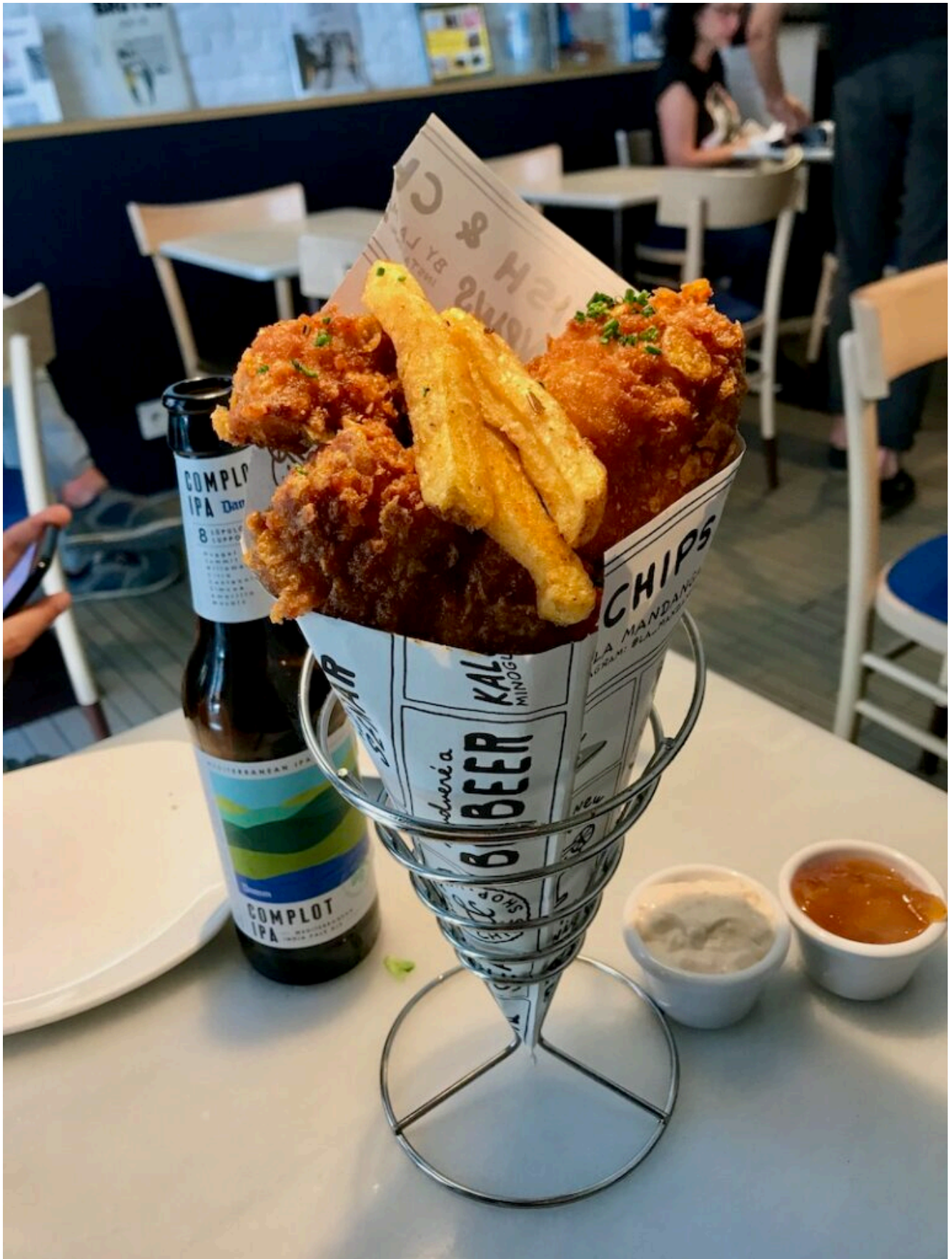
Their version of fish and chips is made with fresh fish from Galicia, battered in tempura, with cereal to give a bit of