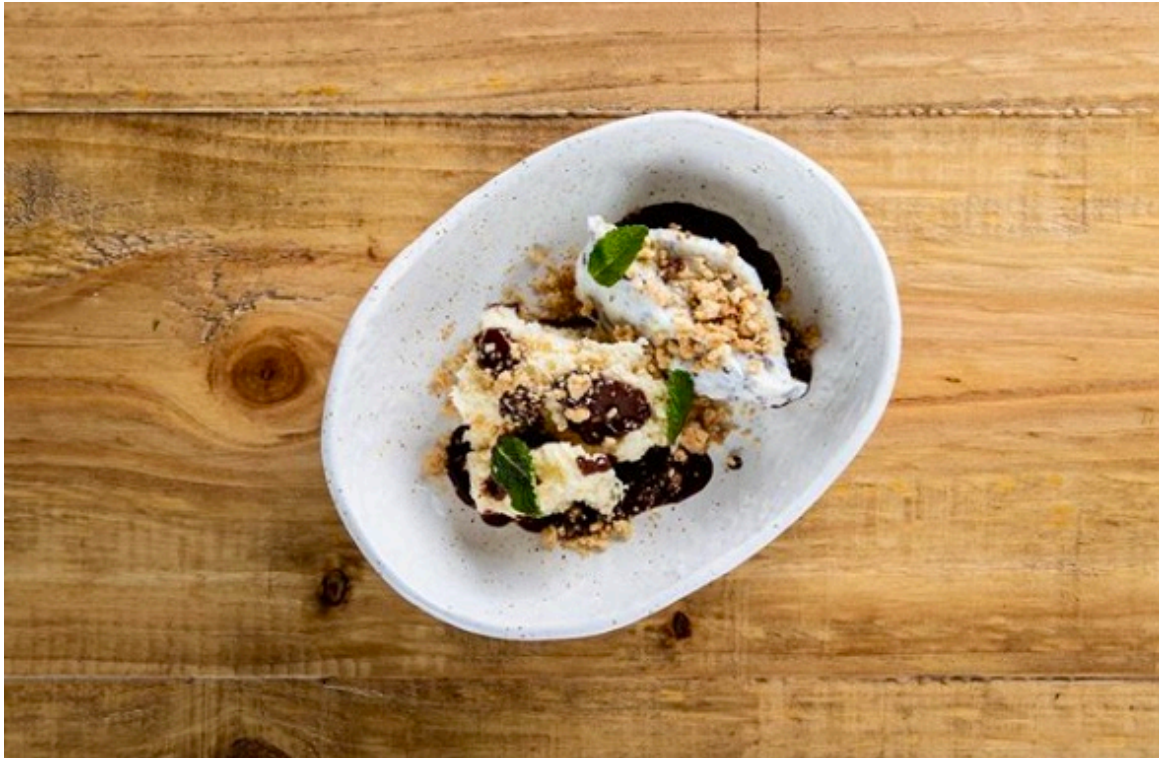
Tarta de Agustina dessert.

Lettera Trattoria really lives up to its namesake – moderna. It is home-cooking with a modern twist, served in stylish surroundings with knowledgeable staff. It's a pairing as perfect as Dolce and Gabbana.