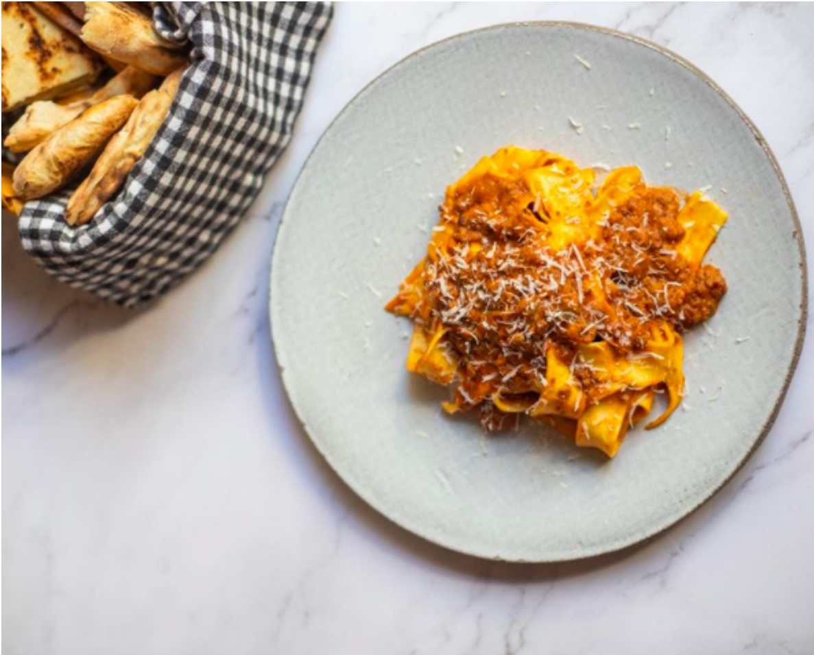
Pappardelle pasta with slow-cooked ragu.

We shared the “Tarta de Agustina” – a cake served with ricotta and a crumble made of almonds. It was one of the most unusual, but tastiest desserts that I’ve had in a long time. We fought to munch every last mouthful.