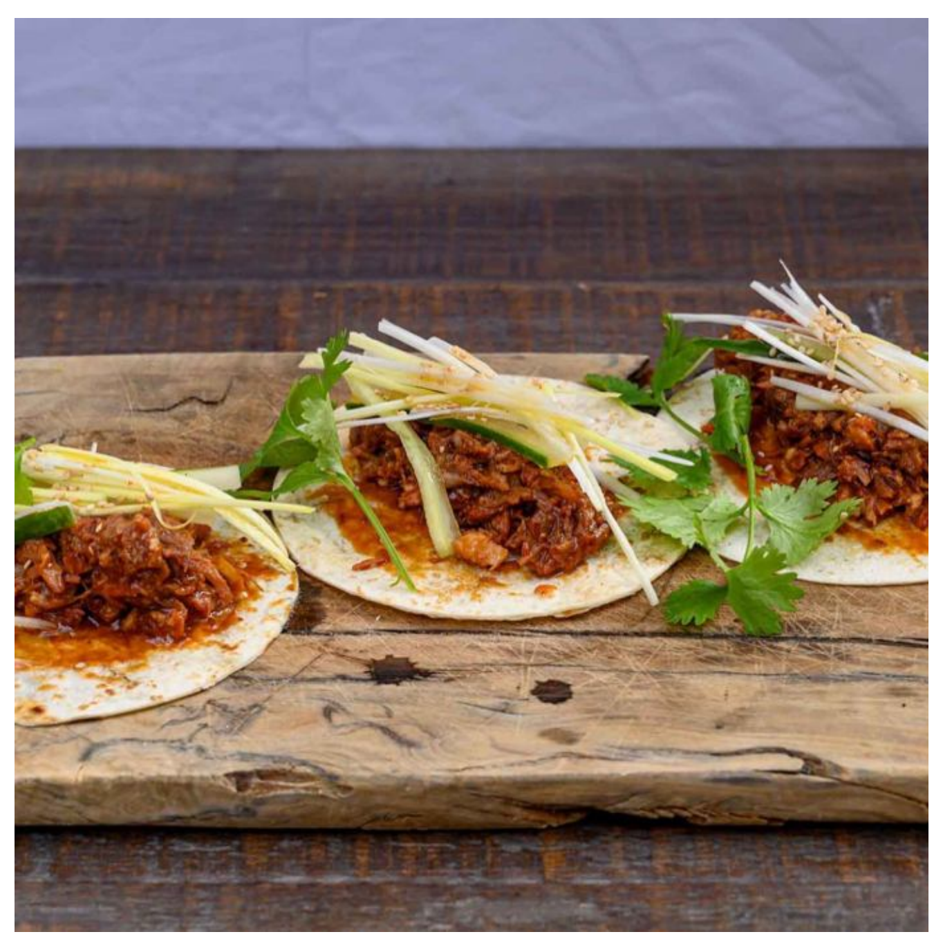
Peking duck tacos

As for the main dish, I have a rule now: "If they name a dish after the restaurant, I eat it." For many years, I had problems deciding what to order, so I decided to always ask for anything that the restaurant considers deserving of its own name.