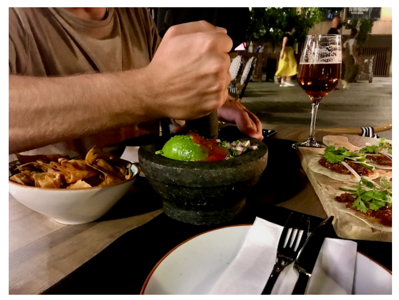
Guacamole in a mortar and pestle

Second, the Peking duck tacos that we'll be coming back for. You can't go wrong with either of these.