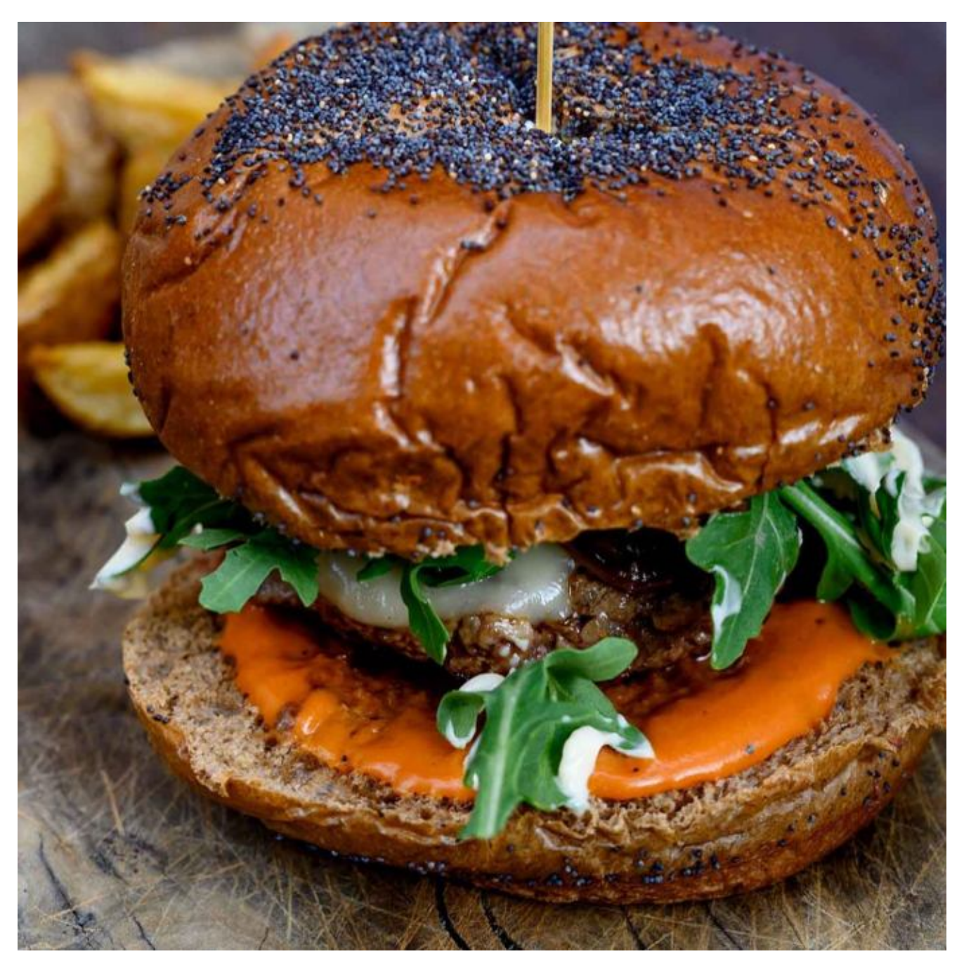
Classic Amicis Hamburger

onion and the secret (I forgot to ask what it was) house sauce. It made me very happy.