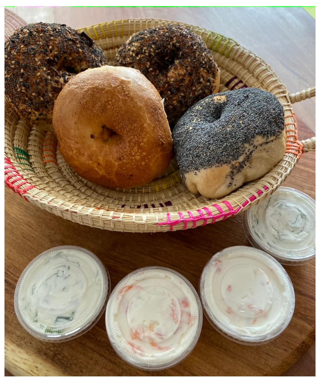
Takeout from <a href="Mazal bagel shop">Mazal bagel shop</a>

While this situation is affecting everyone, there are certain industries and small businesses that are really suffering