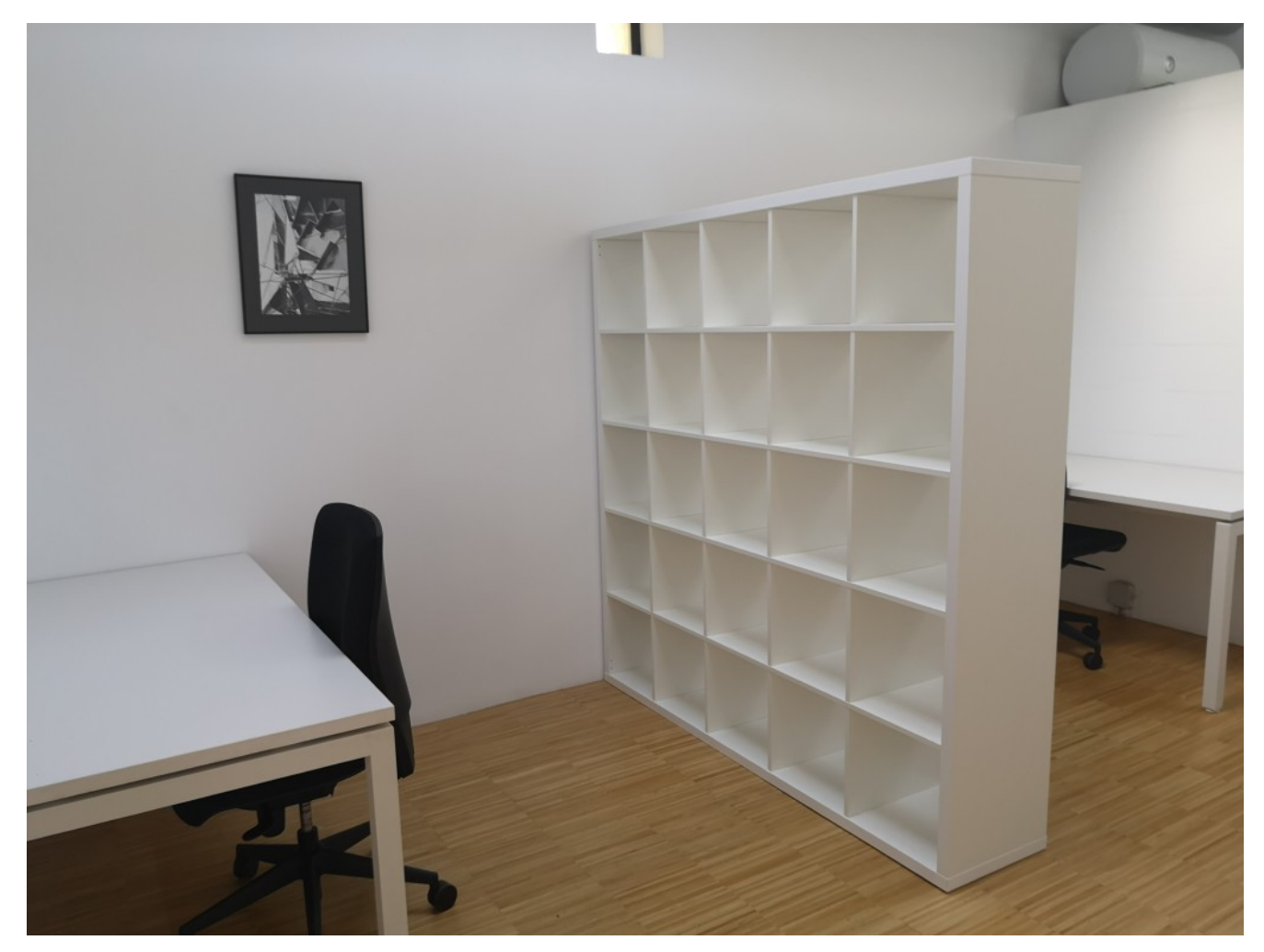
Don't be offput by the lack of decor—they're new in town!

And most importantly, members share this space with THESE ADORABLE FURRY FRIENDS.