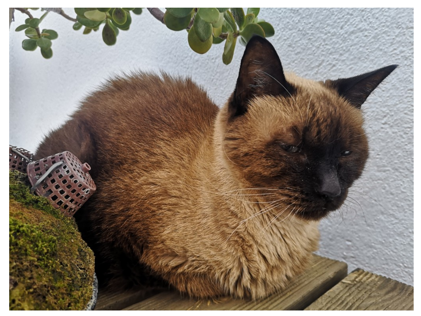
So sleepy, so zen.