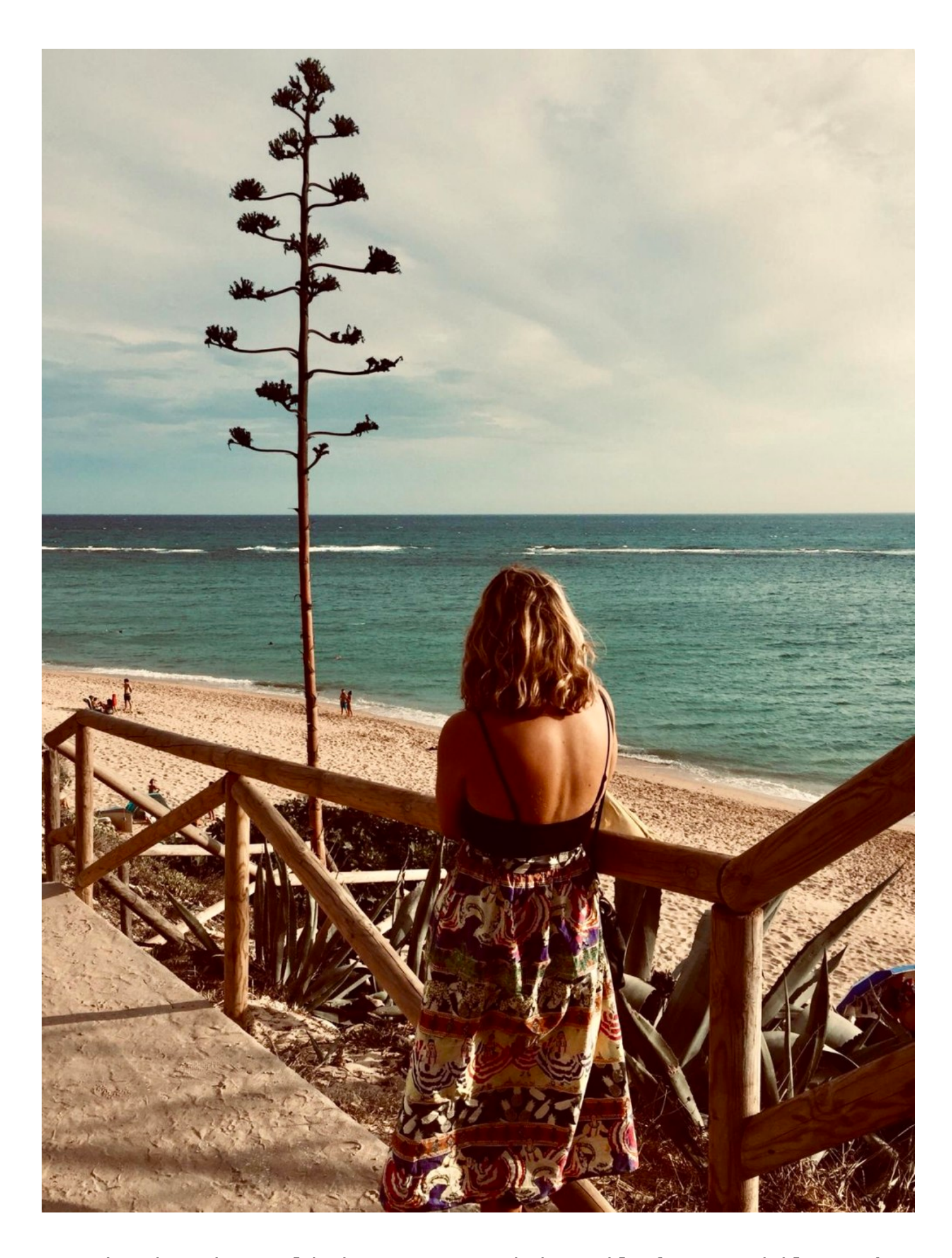
Now having been living on Spanish soil for a while, I've started to twig that all the best places are reached by car.