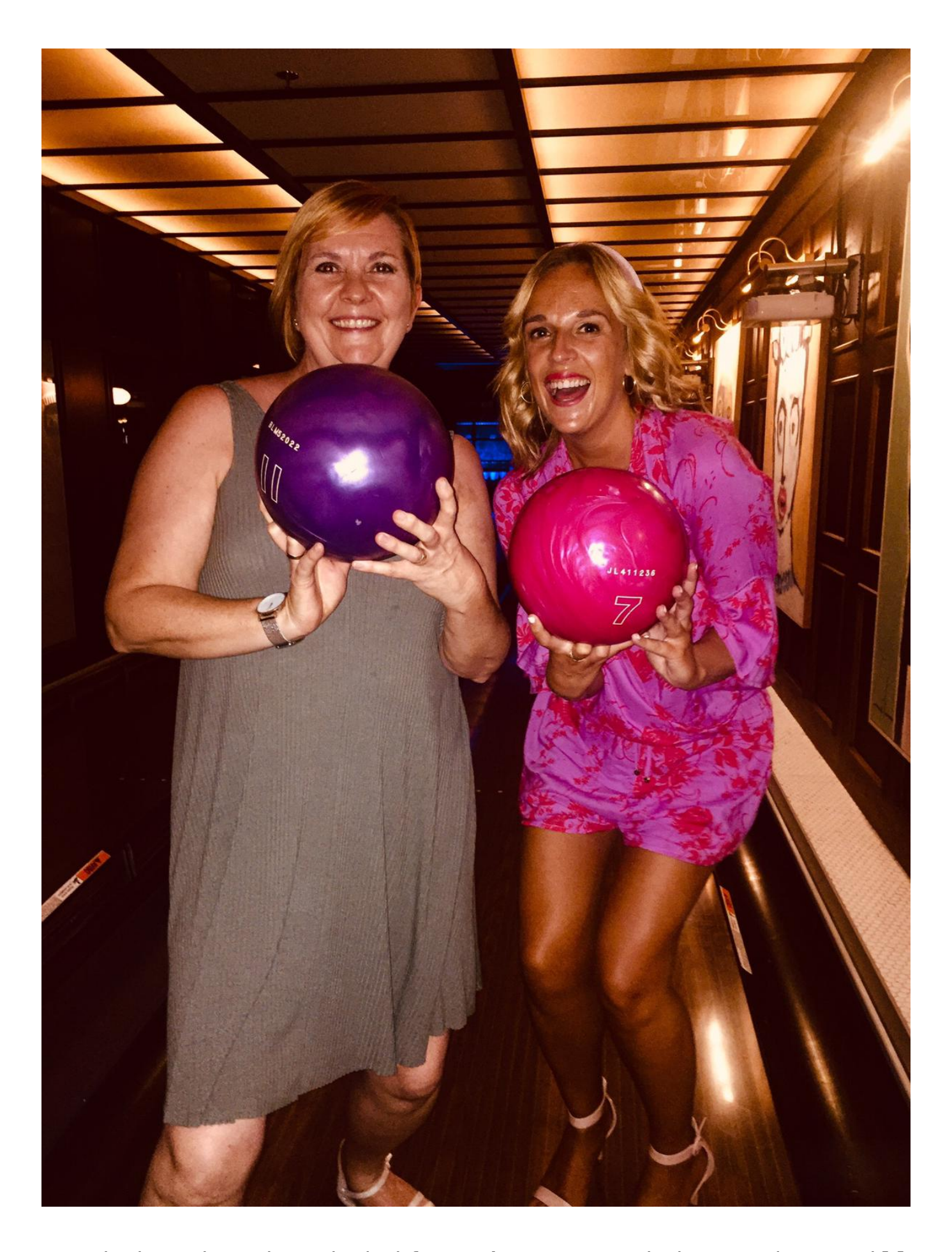
Worth bearing in mind if you're competitive and I still maintain that it was my stilettos and not my lack of technique