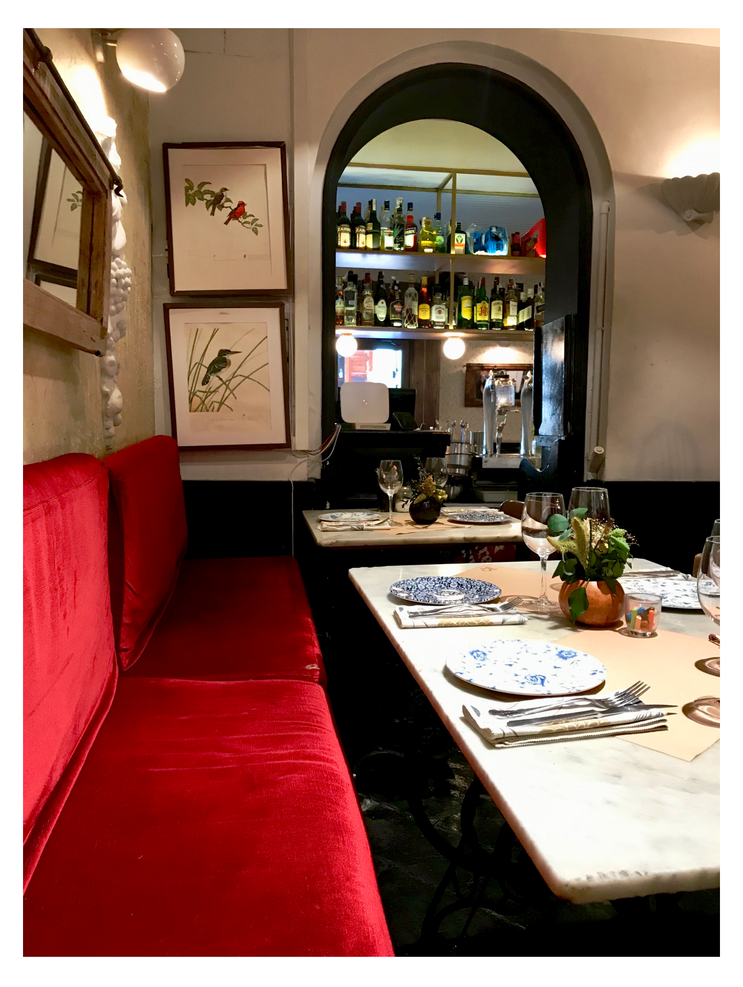
Dining at Camoatí is always a treat and the food is simply outstanding — the \underline{\text{menu}} features a wonderful selection of