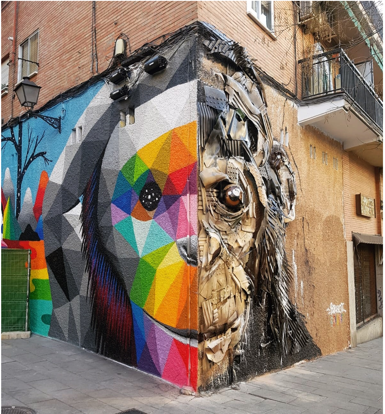
Calle Embajadores, pic by @jessiesusanna

neighborhood. You'll find a lot of street art on Calle Embajadores , Miguel de Servet , and Doctor Fourquet (where you'll also find many micro-galleries).