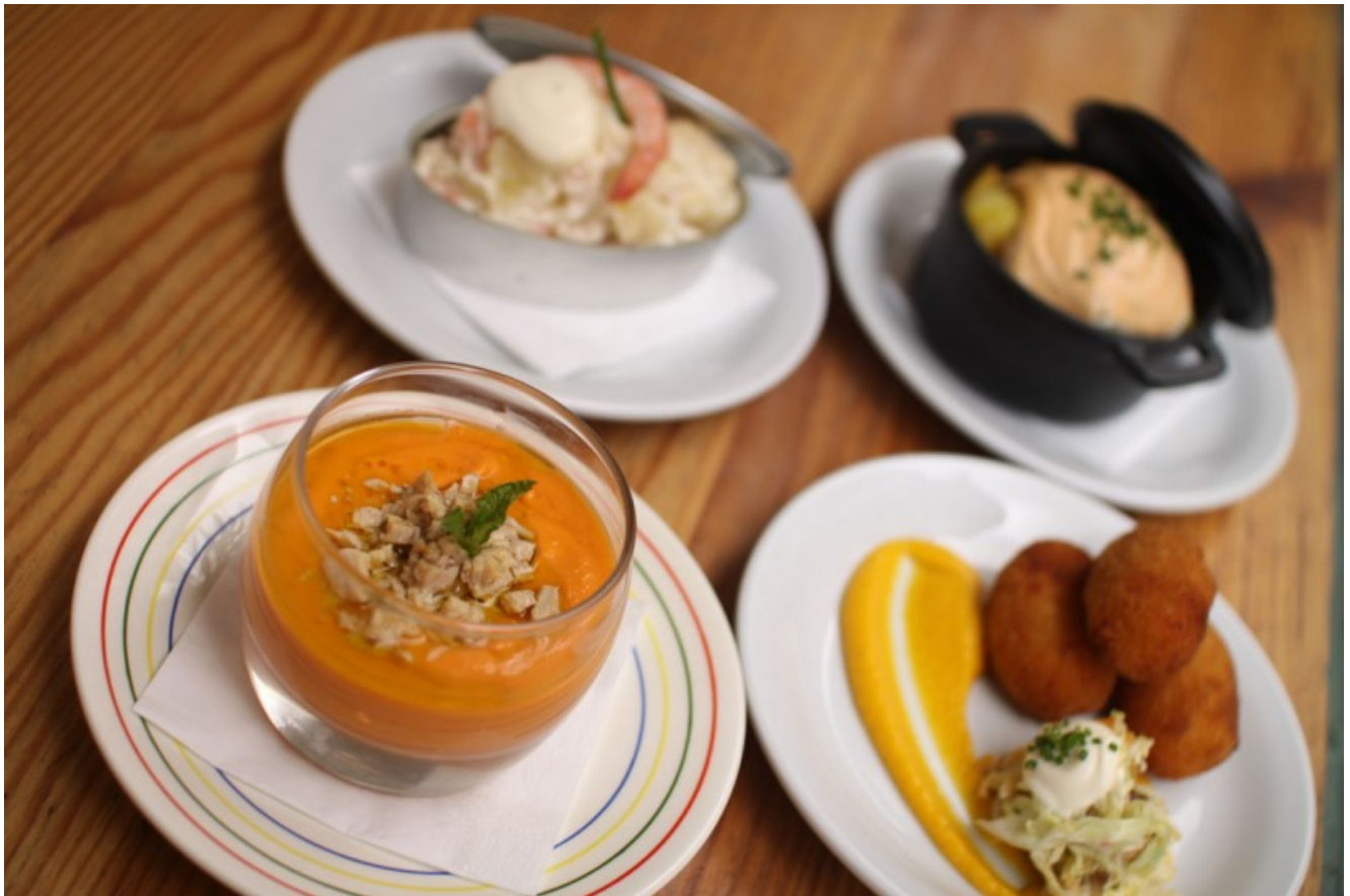
Typical tapas at Bar Lambuzo

Tapas bar hopping in La Latina: At least one night in Madrid should be dedicated to tapas bar hopping, and one of the best streets to do this on is Cava Baja, along with its surrounding calles and plazas . Here you'll find bar after bar... after bar.