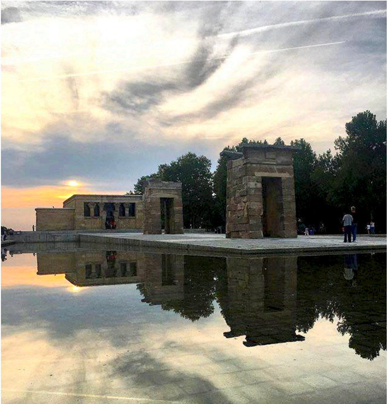
Sunset at Templo de Debod

Parque del Oeste. This spacious park is located in the western part of Madrid, near Moncloa and Templo de Debod. It provides a much-needed breath of fresh air, plus there are outdoor concerts held during the warmer months of the year.