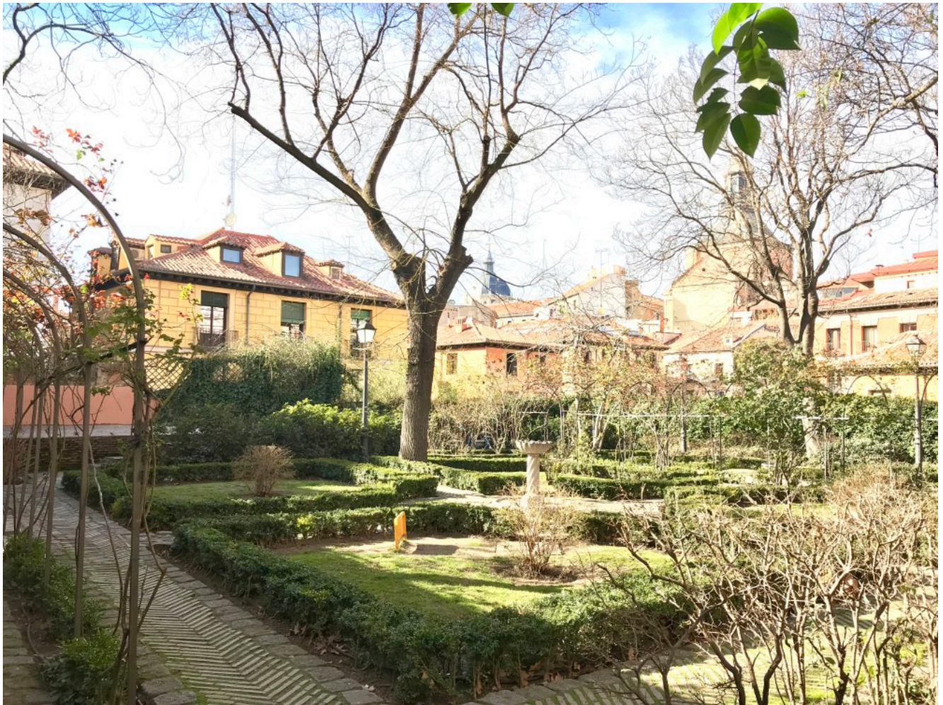
Jardín del Príncipe de Anglona