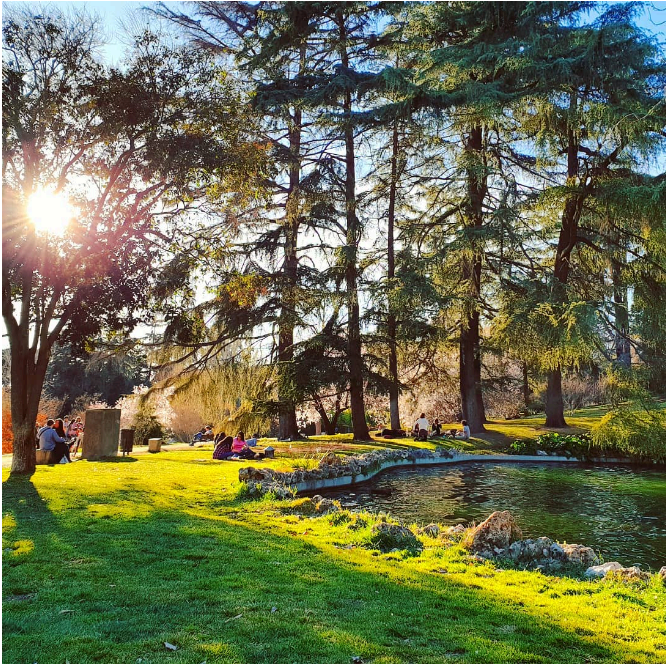
Parque del Oeste, pic by @os_car_a

Casa de Campo : The largest park in Madrid. It really makes you feel like you've left the city. You'll find lots of hills, trails, bike paths, bars with outdoor terraces and a lake. It's also connected to Parque del Oeste and Madrid Río (mentioned below). You can rent a bike for the day and explore the park on wheels. Here you'll also find: