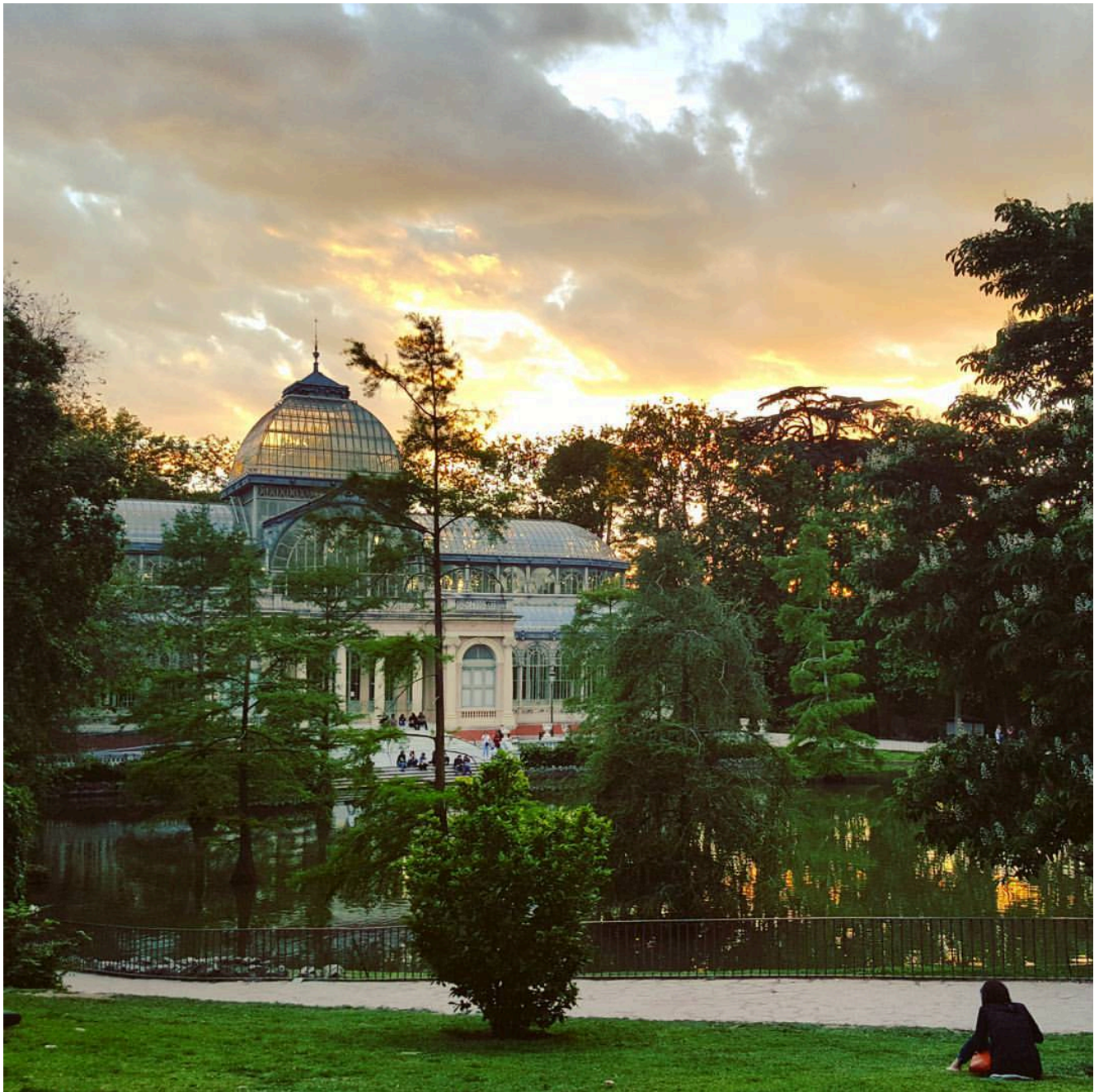
Glass Palace at Retiro Park

Templo de Debod: Madrid houses a beautiful Egyptian temple surrounded by greenery. Come here to watch the sunset! Then take a walk through Parque del Oeste (next point).