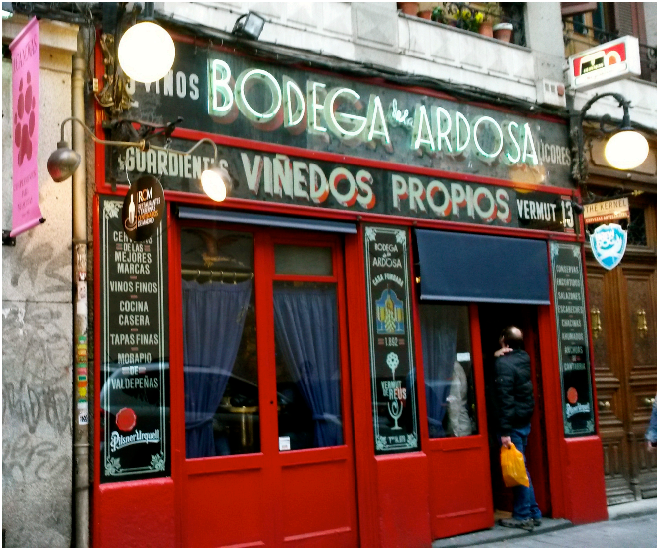
Bodegas de la Ardosa , one of the most iconic bars in Madrid