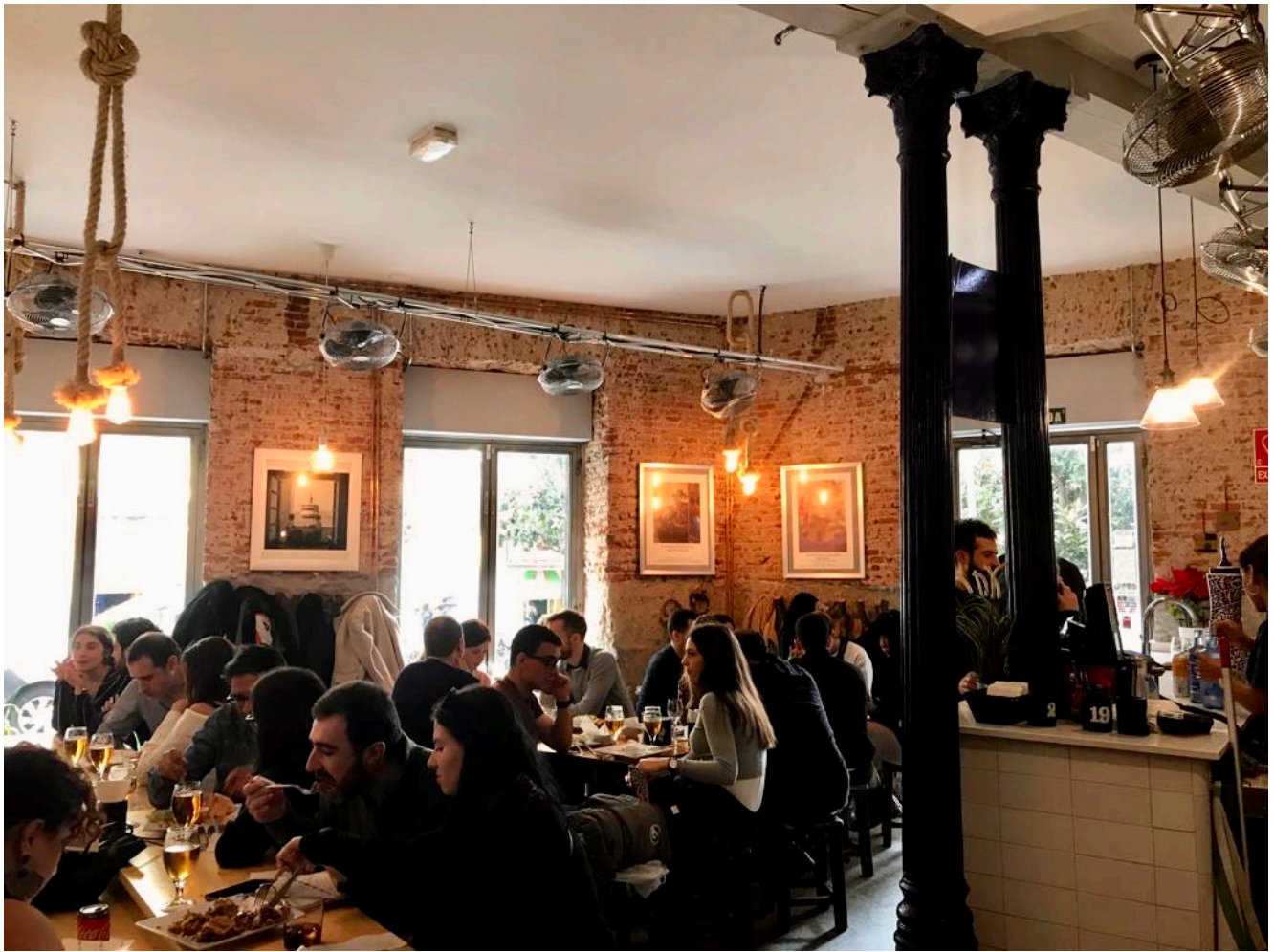
Egeo , a popular Greek place in Lavapiés

Barrio Slamanca: This is the city's higher-end area. It's very pretty and has some of the best eateries in the city, from Michelin-starred restaurants to friendly neighborhood bars. We'd love to explore Salamanca's hidden gems more. Here are some of the places we've previously featured: