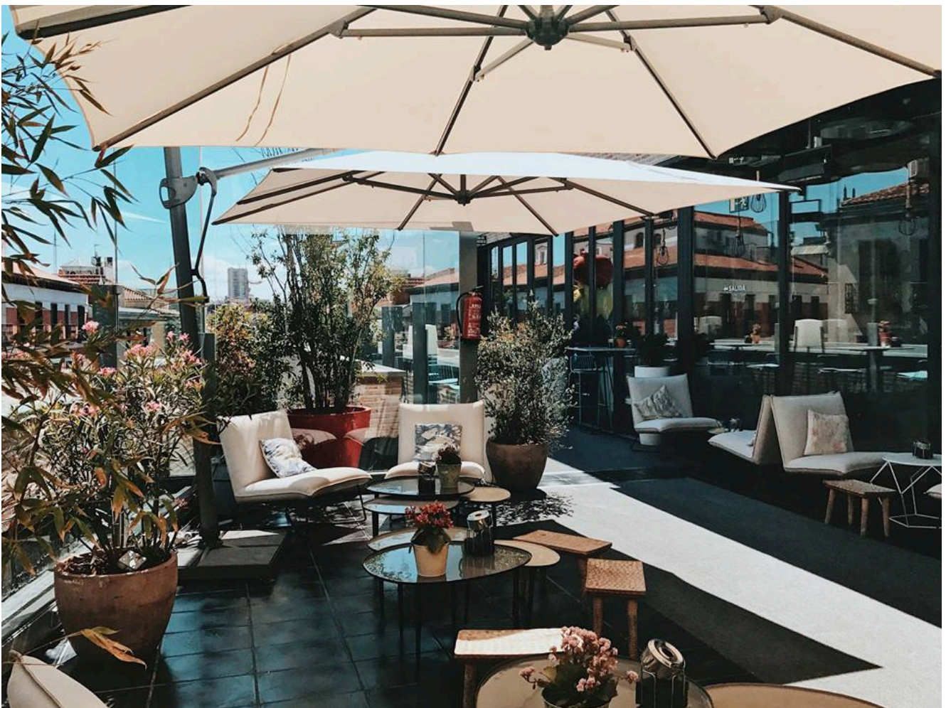
Photo from Mercado de San Antón

This is a perfect place to start your evening with friends. As