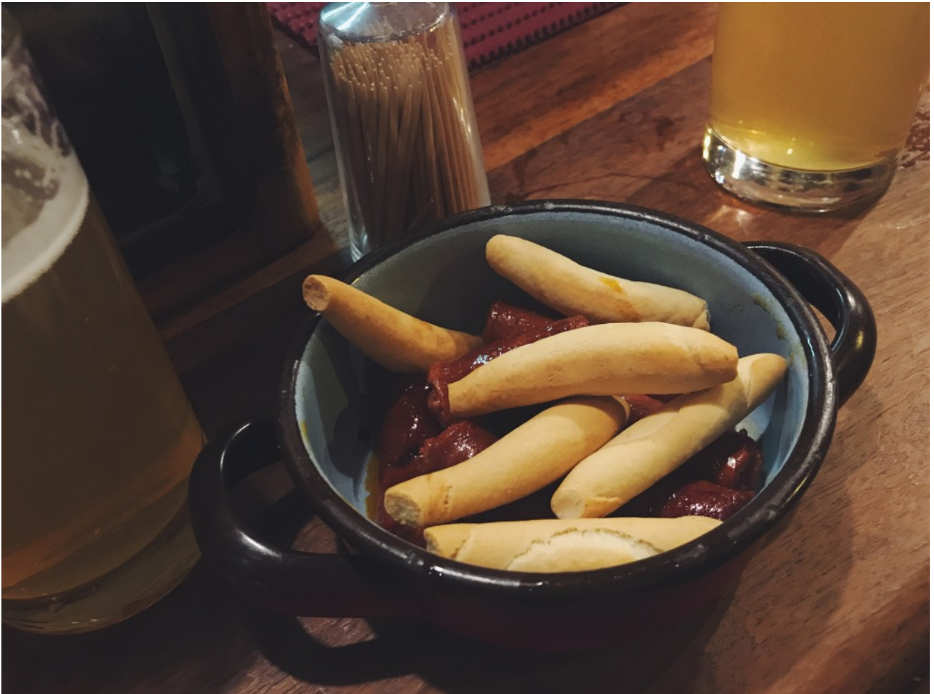
Typical free Spanish tapa

dedicated to Spanish painter Julio Romero de Torres. Even one of his paintings is depicted on these beautifully detailed tiles.