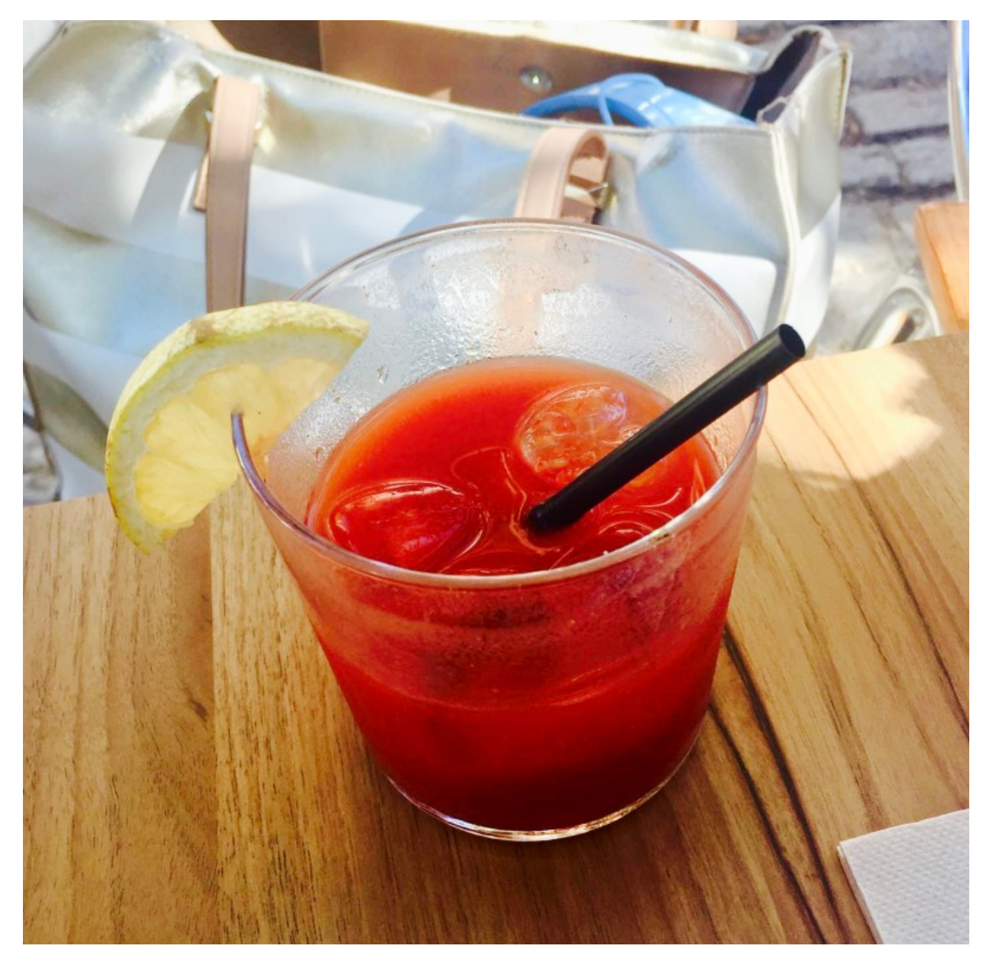
When you just can't face waves of nausea coupled with beer fear, there's nothing for it in my view except for hair of the dog. If this sounds familiar, let me introduce to to the perfect spot to cure your hangover; or perhaps indeed to just top up – Roll. My friend and I pitched up a few Sundays ago, starved and in need of Bloody Mary's.