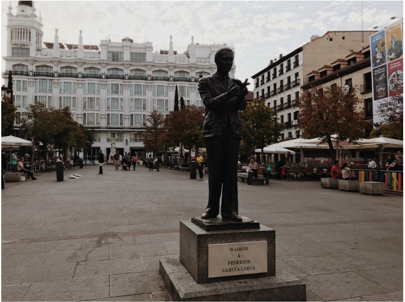
Monument Federico Garcia Lorca