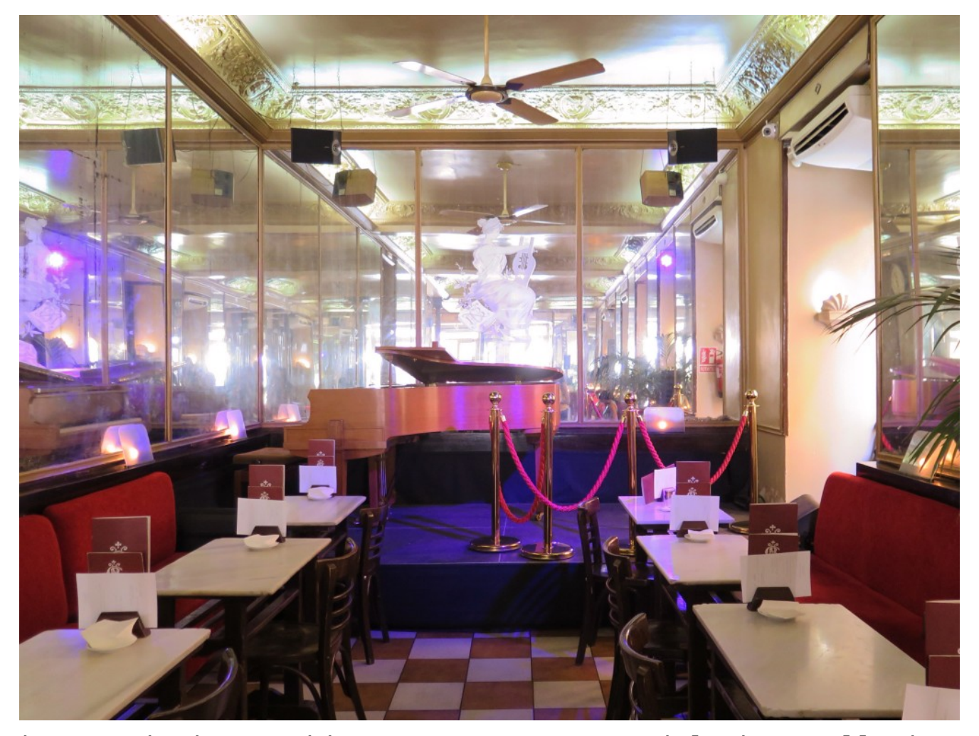
The grand piano taking centre stage, and look at all those beautiful mirrors