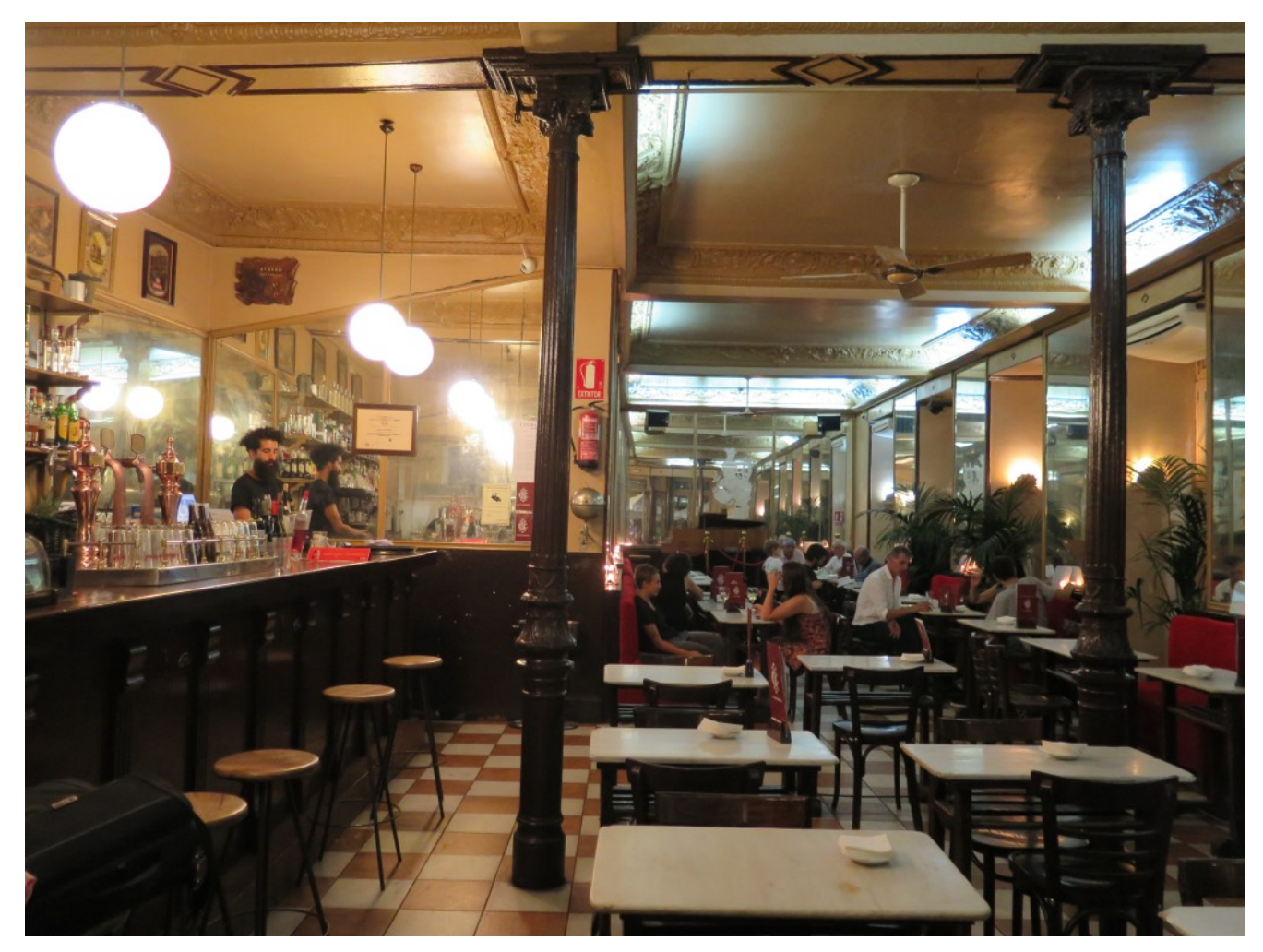
Café Barbieri by night

Café Barbieri is also on the same street as the Greek foodie place, <a href="Egeo">Egeo</a>, so there you have it, your night is planned!