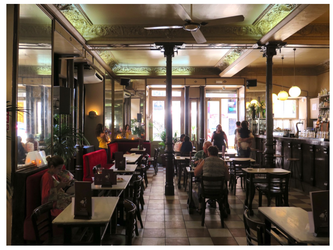
Café Barbieri by day