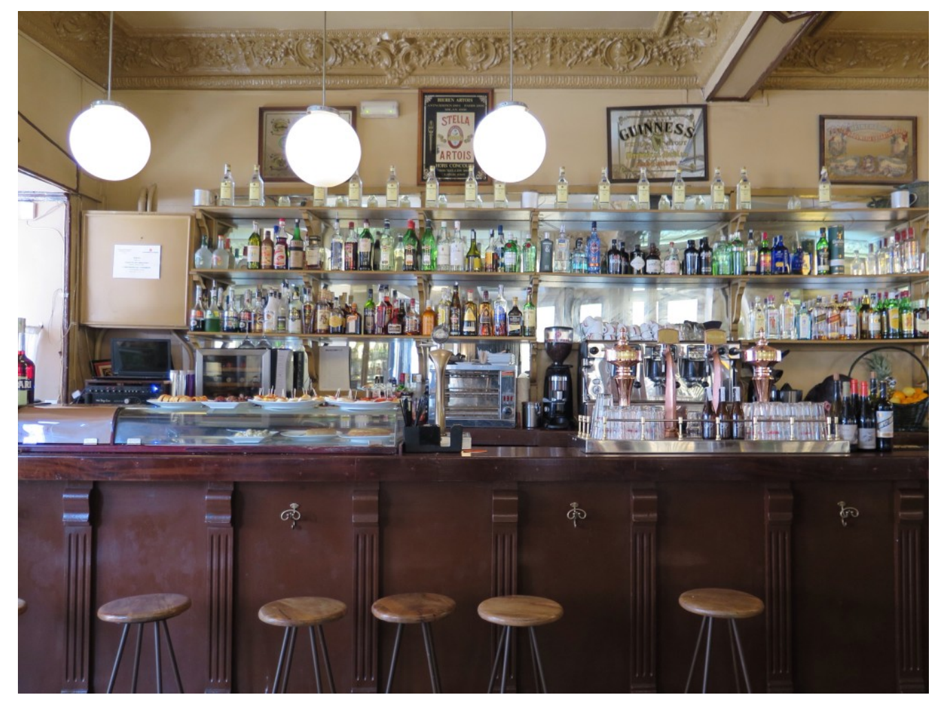
The bar has a great selection of spirits & vermouth on tap