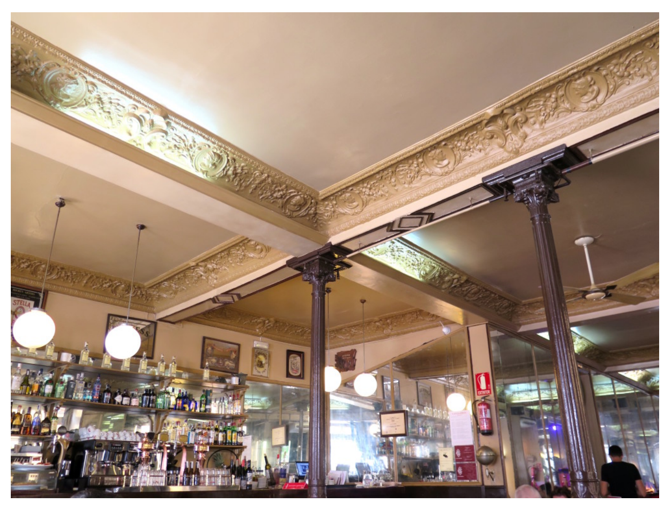
Café Barbieri's beautiful ornate ceiling