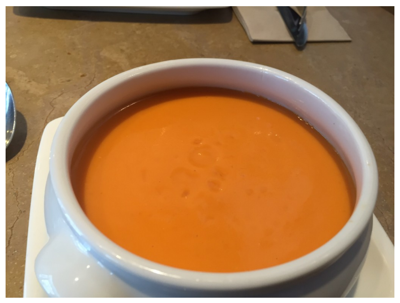
I must have been andaluza in a past life because my love for gazpacho knows no bounds

The first thing that made me fall in love with this place was the fact that gazpacho was on the menu all year round.