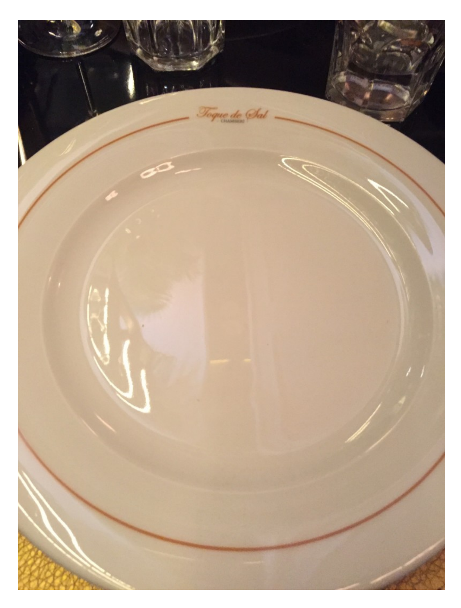
...and personalized plates. The golden touches, from the silverware, the placemats, and the menu covers were analogous