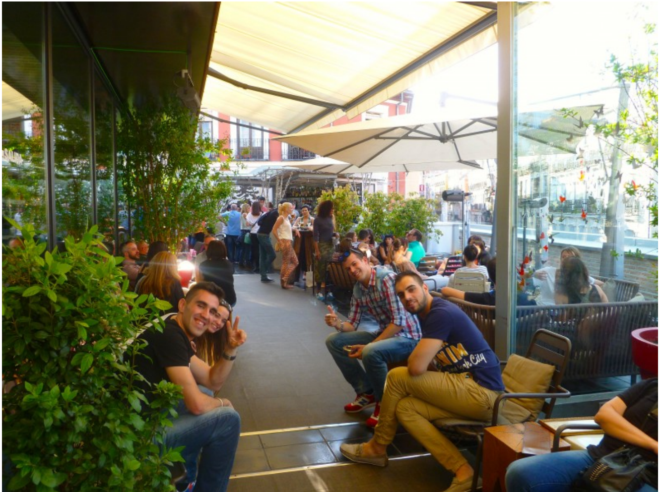
At Mercado de San Antón's rooftop, just across the street from Plaza de Chueca

de San Antón —a 3-story gourmet food market offering all types of delicious food and a fantastic rooftop bar . Chueca is also proudly home to one of the world's largest Gay Pride Parades, as well as many other city activities. For its mix of edgy and high-end nightclubs, restaurants, bars, stores and ambience, Chueca is easy to fall in love with. Watch a video about Chueca here .