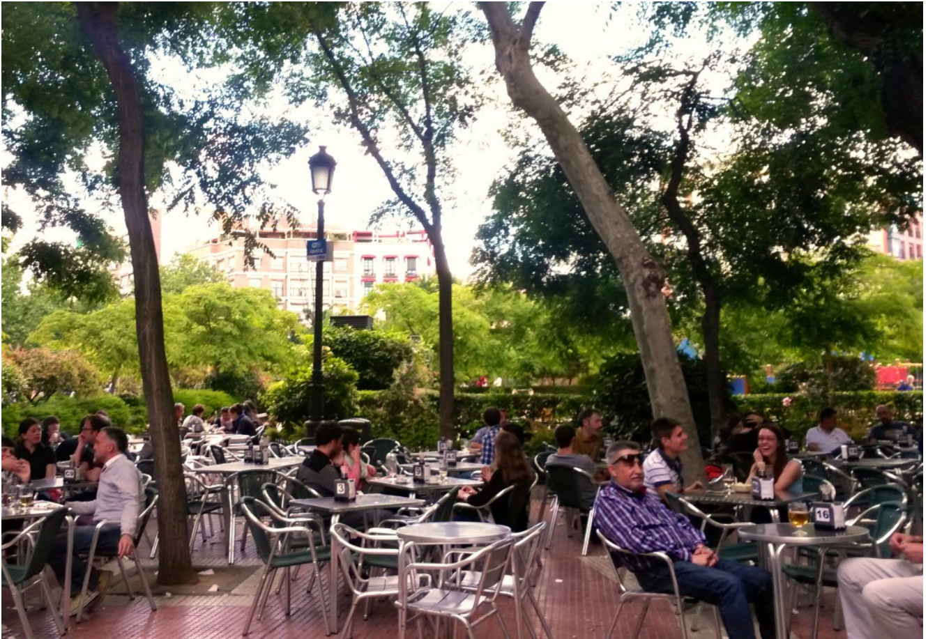
my favorite plaza in Madrid, Plaza Olavide