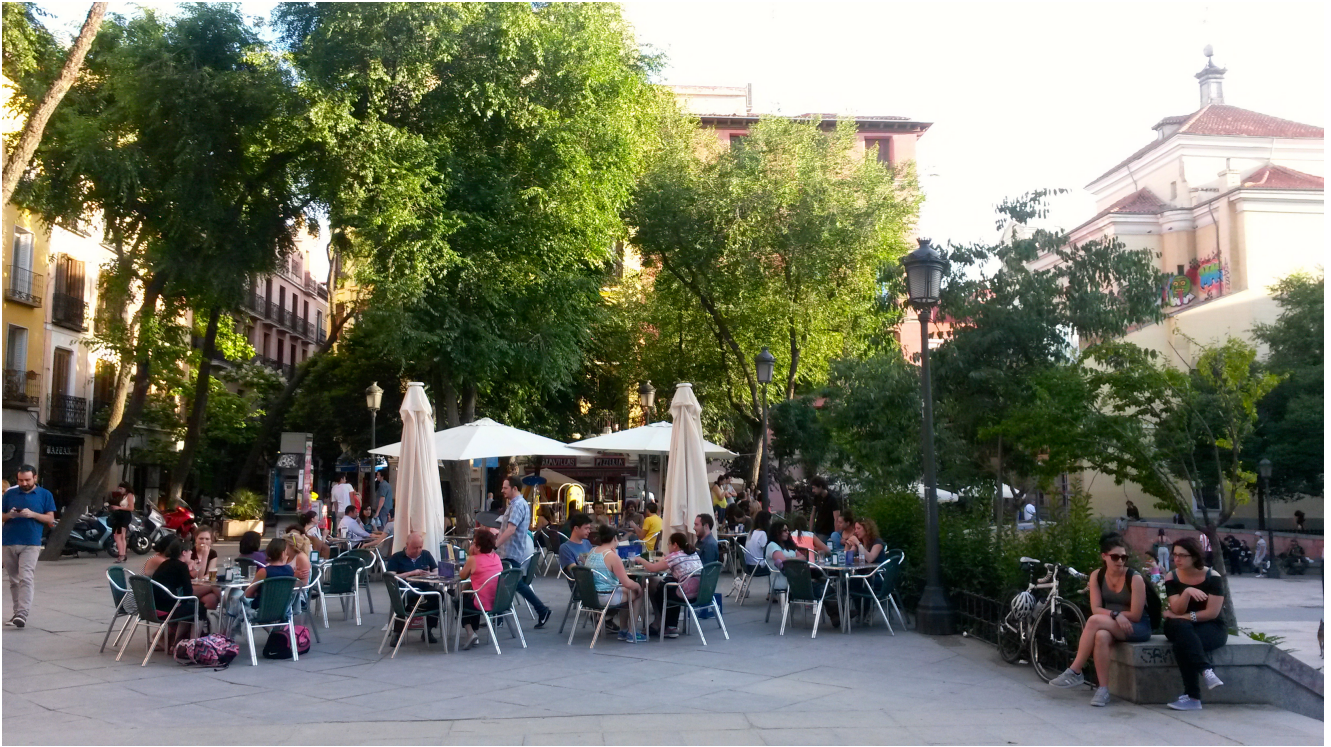
Plaza de Dos de Mayo in Malasaña