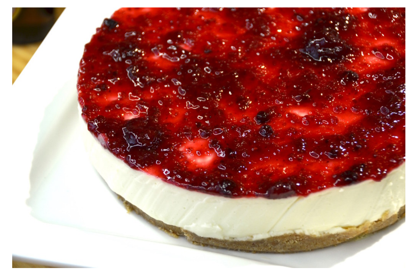
Strawberry cheesecake (wow)

You can also buy a selection of Portuguese beers and wines (including vinho verde ), plus an almond liqueur ( licor de amêndoa ) specially driven over from Portugal by the guy on the right. I bought their last bottle a couple of weeks ago and with it came this story — suddenly €12 seemed like an absolute steal. You'll be glad to know that they've since been back to Portugal and brought another few bottles for us, but get it while you can — or I will!