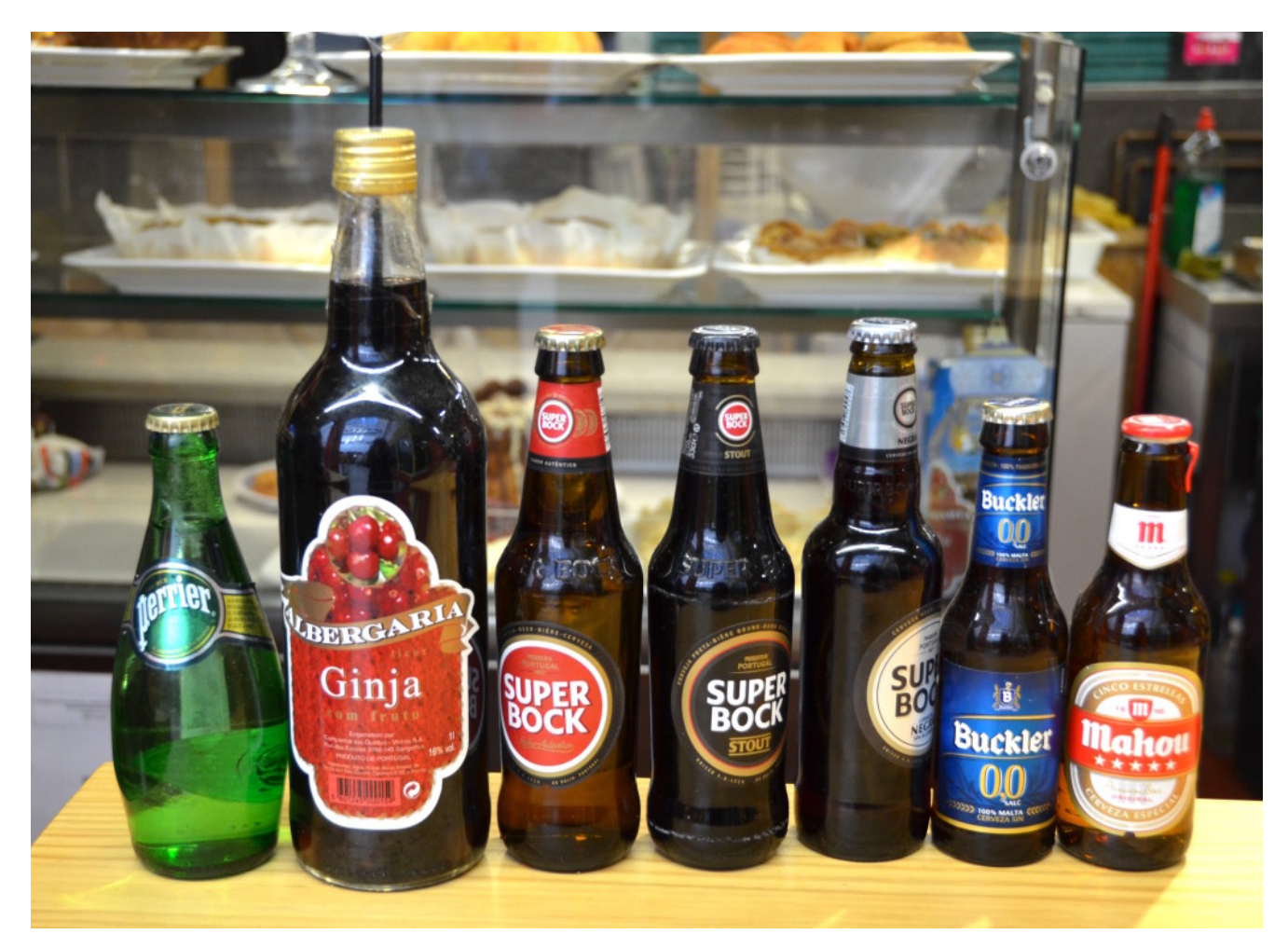
A selection of Portuguese beers

Pull up a chair at Mercadillo Lisboa or mingle in its sphere of influence with a vinho verde and a bocadillo de bacalao . And just so you know, you'll probably bump into me.