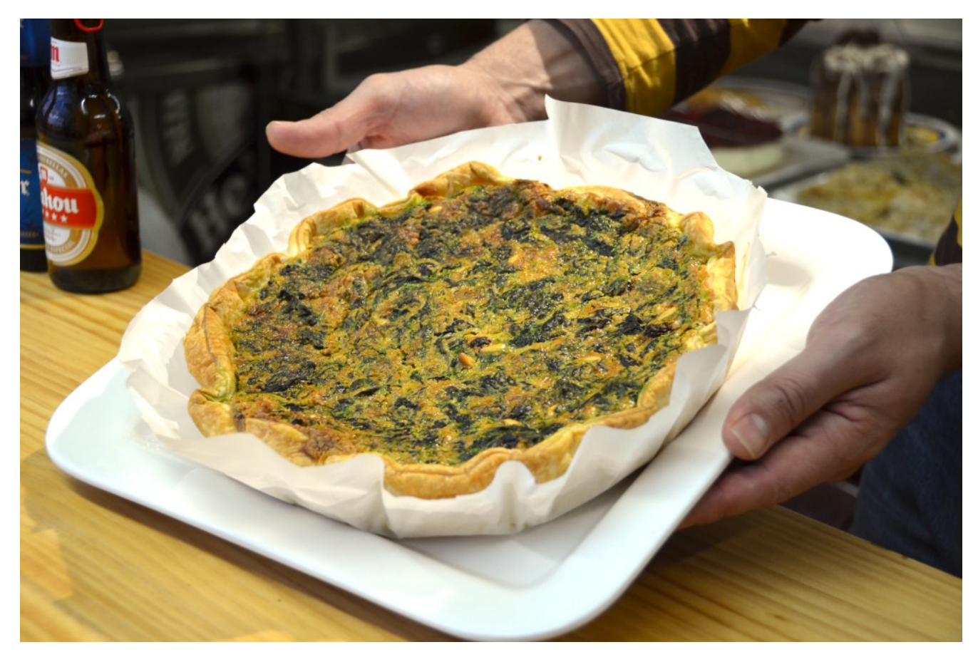
Vegetarian spinach quiche