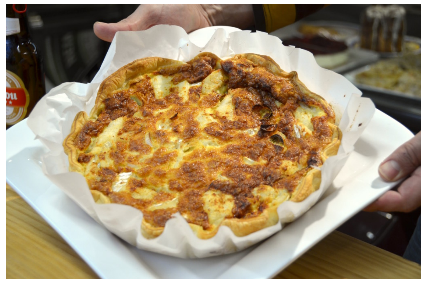
There are lots of quiches here