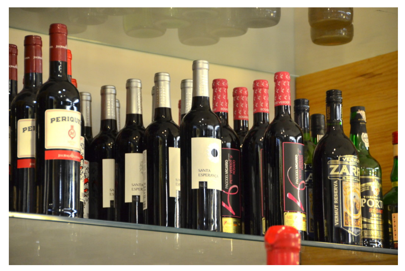
Lots of Portuguese wines and liqueurs