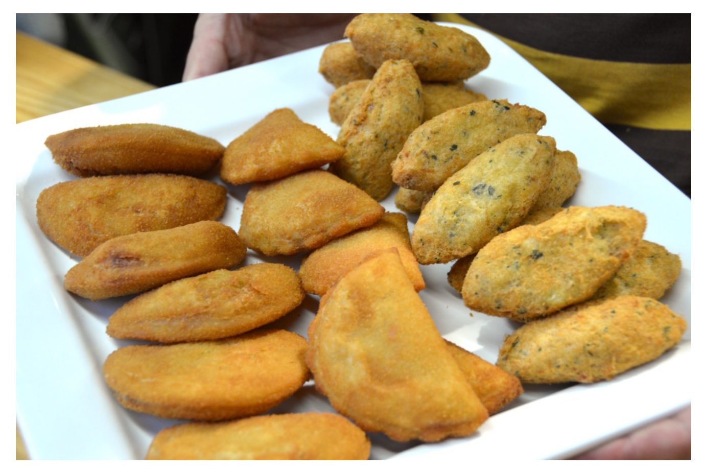
Empanadas and cod croquettes