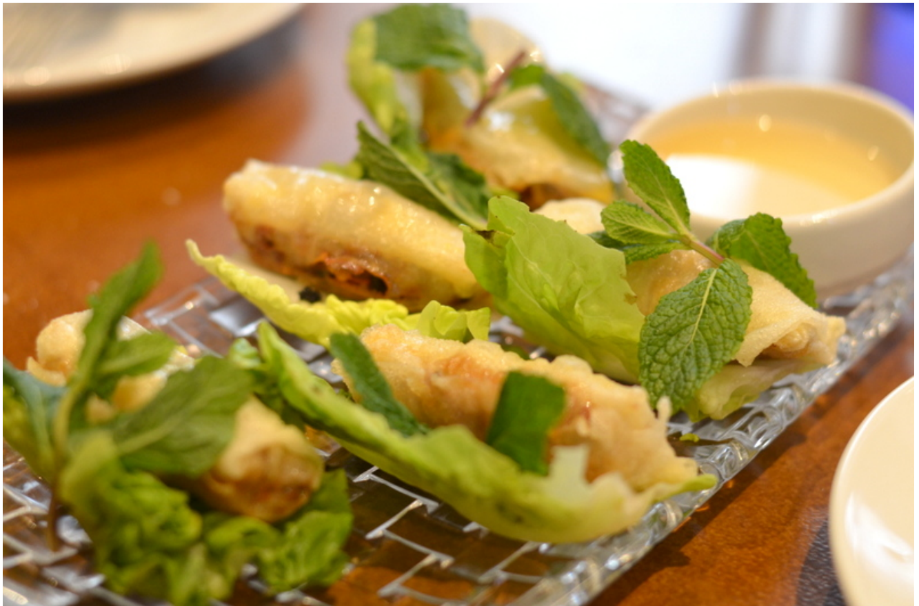
Vietnamese pork spring rolls

The cecina was some of the best I've tried in Madrid, and I consider myself something of a cured beef expert, ordering it any time I spot it on a menu. While all of the flavors were impeccable, the winner had to be the octopus sandwich with its mixture of Thai herbs and Spanish paprika.