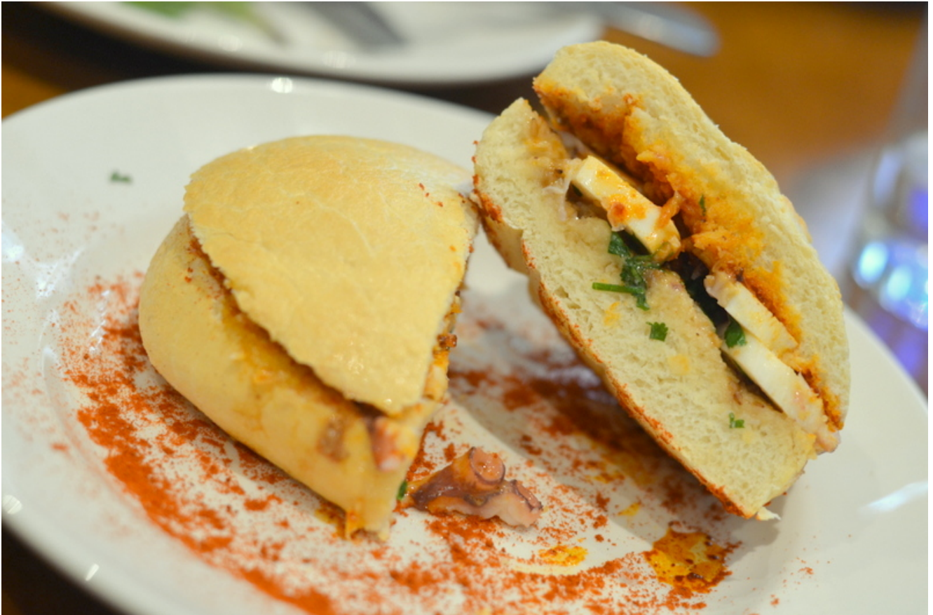
Thai-style octopus sandwich

We only stopped ooh-ing and ah-ing over each bite to sing along with the Motown greats that enveloped the room, and reluctantly put our forks down to watch in awe as the couple next to us jumped up to ballroom dance to James Brown's "It's a Man's World."