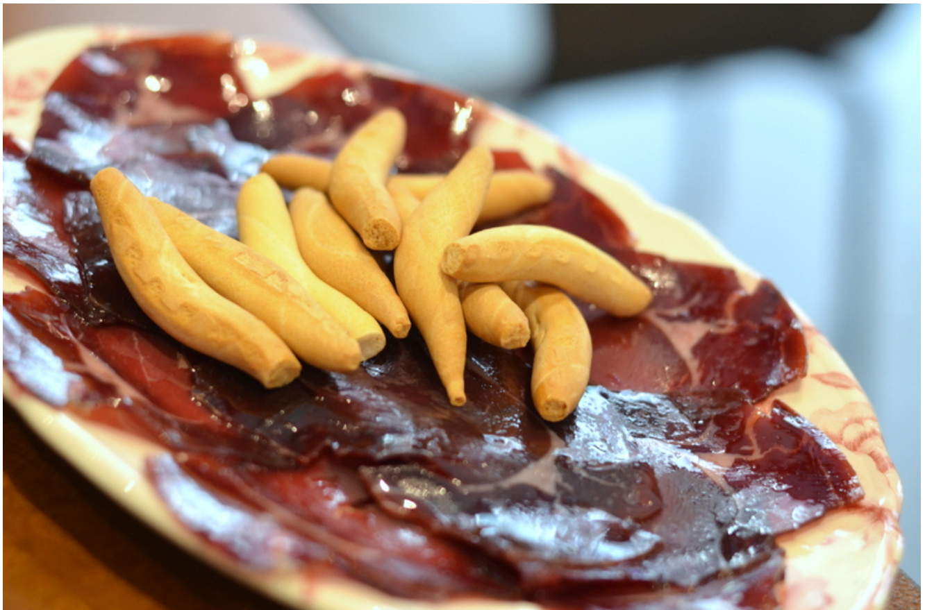
Mouth-wateringly marbled cecina

We chose four small plates to share between the two of us, testing La Falda's version of the Spanish classics of jamón croquettes and cured beef, or cecina , and their ability to fuse Castillian products with Asian flair in their pork spring rolls and octopus sandwich.