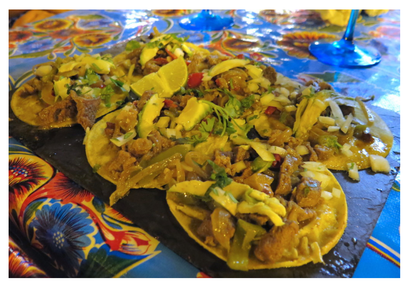
The Beef Tacos