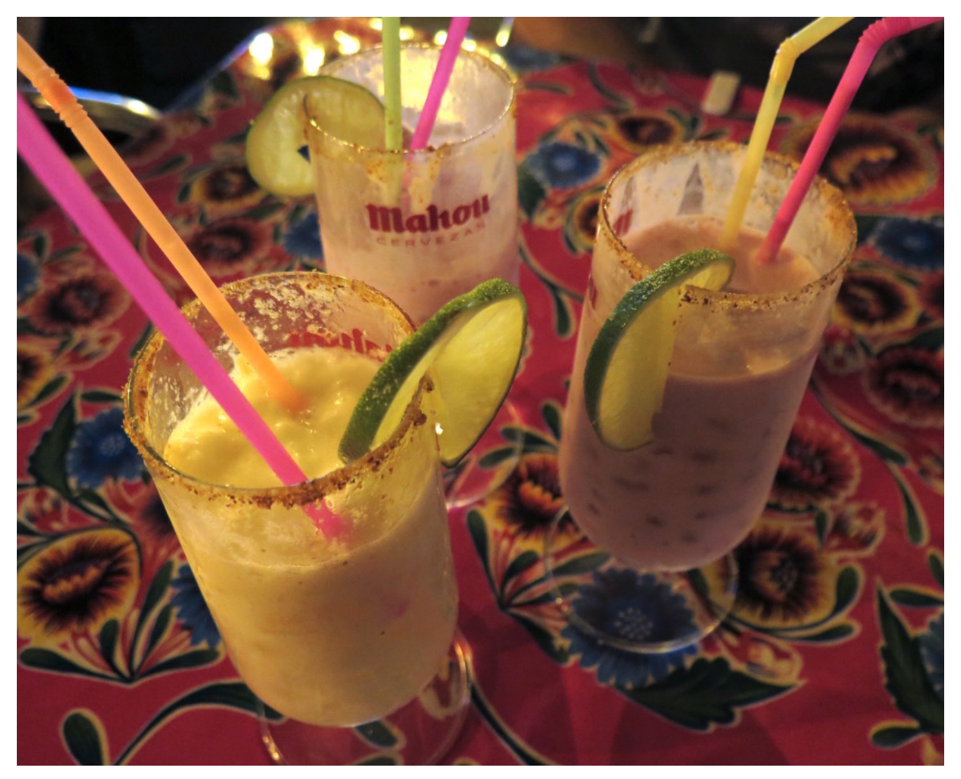
Lemon and Strawberry Margaritas

First of all, the Lemon and Strawberry Margaritas are incredible — like nothing you've ever had before, I promise! The strong kick of tequila was also a great start to the evening.