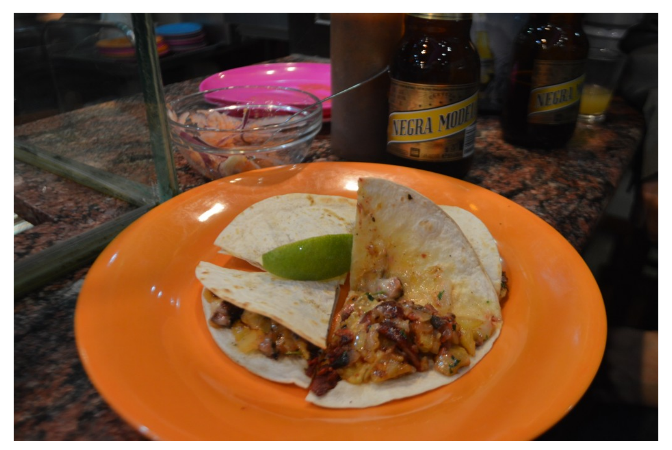
The infamous Gringa at Taquería Mi Ciudad

As the name suggests, tacos are the star of the show here: pastor, cochinita pibil, tinga, carnitas...they've got them all, as well as the usual staples like guacamole, quesadillas and frijoles. My personal favourite is the Gringa, a heavenly combination of carne al pastor, cheese and pineapple sandwiched between two flour tortillas...it needs to be eaten to be believed! If you sit at the bar you can watch the taco man work his magic, although there are plenty of tables for larger groups. Alternatively, you could hop one street over to the original restaurant on Calle Fuentes, which has standing room for about 10.