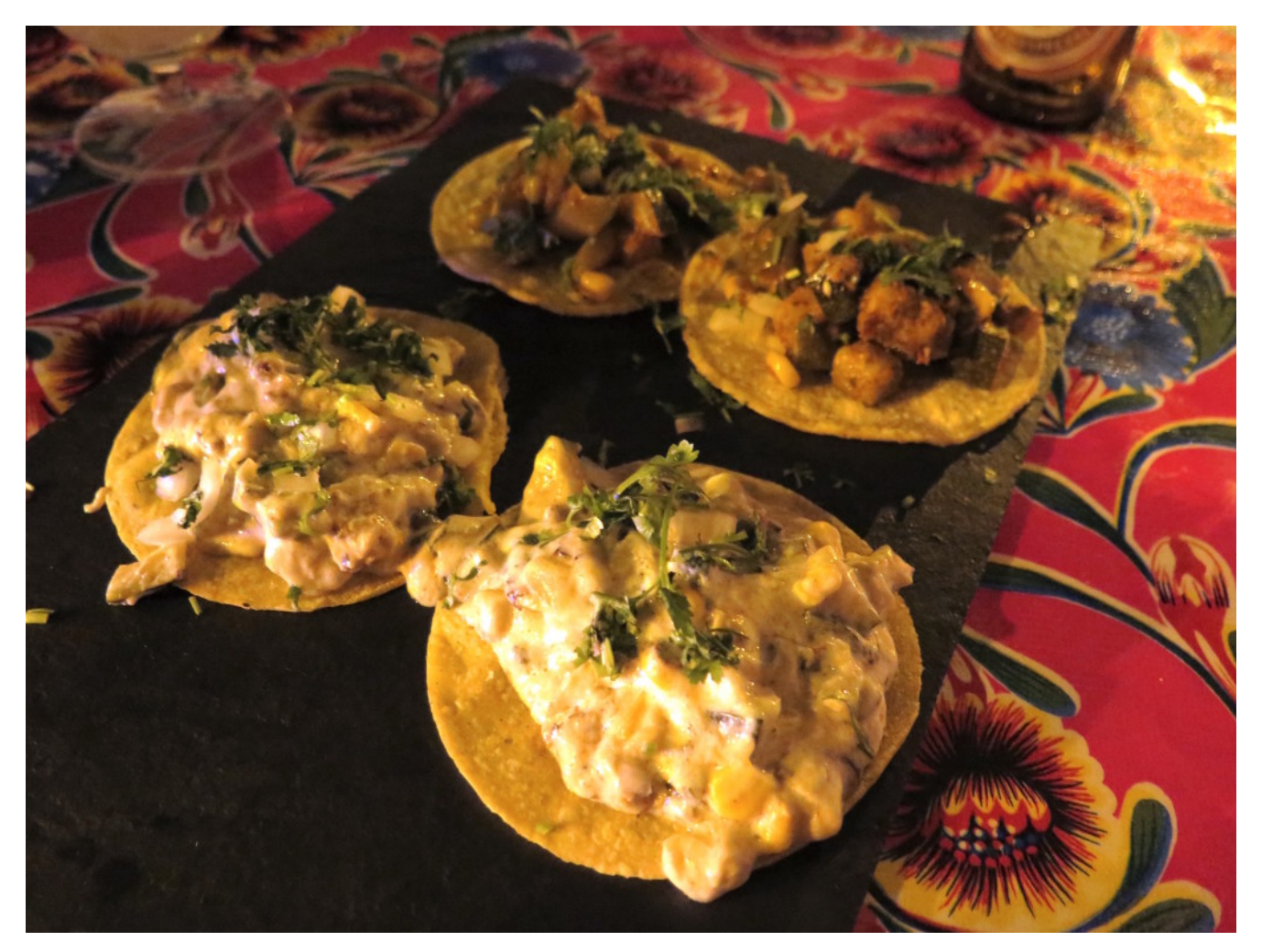
2 x Cheese Tacos and 2 x Lamb Tacos

The beef and guacamole tacos were juicy and moreish, and that extra squeeze of lime cut through all that tender meat perfectly. The veggie options included cheese and guacamole quesadillas, but pictured above we have courgette tacos and two tacos with a creamy vegetable and corn mix and plenty of fresh coriander on top. Having said all that, the tacos themselves were so fresh and you could really decipher their flavour.