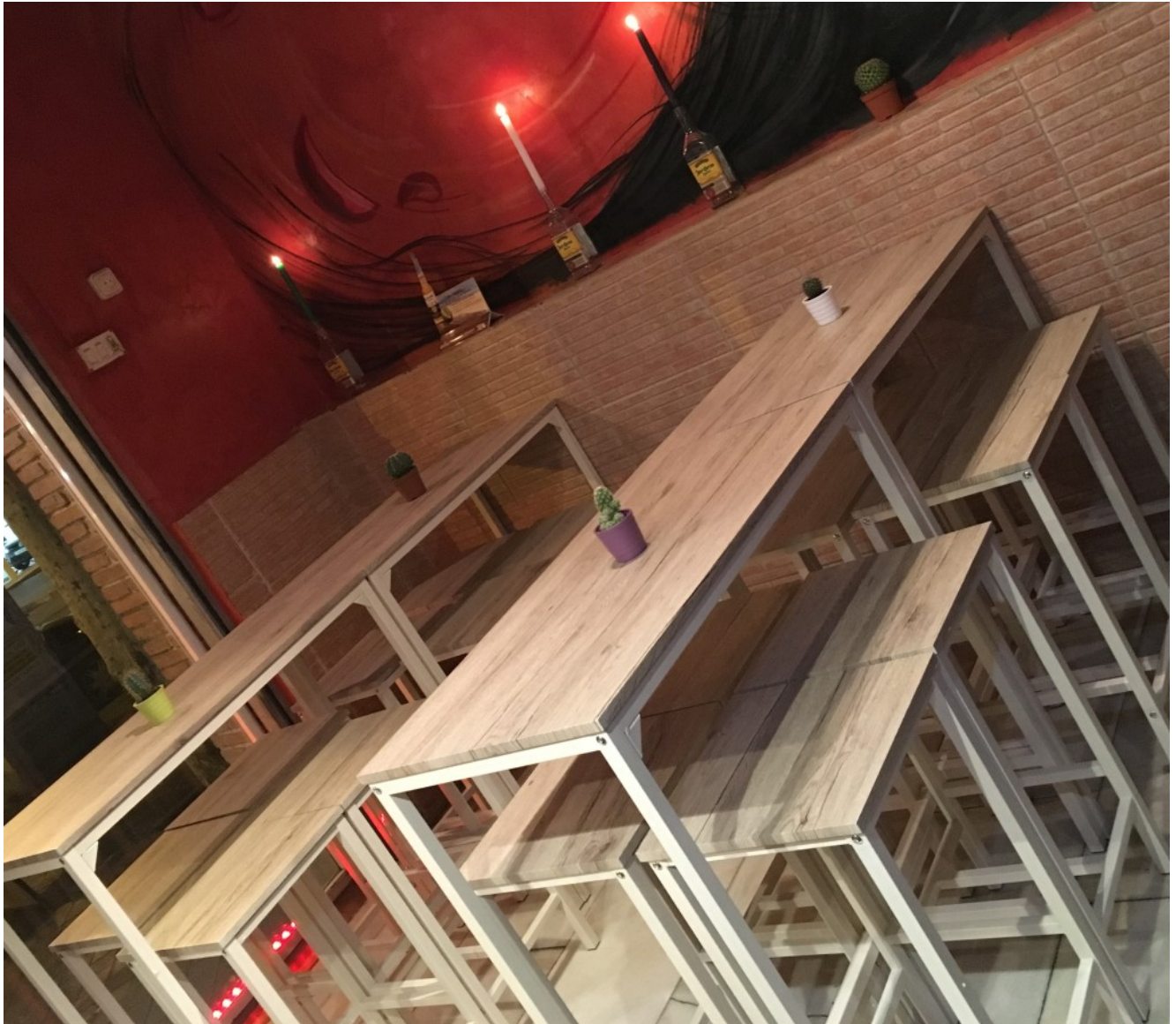
Taco Maya's cosy, minimalist dining area