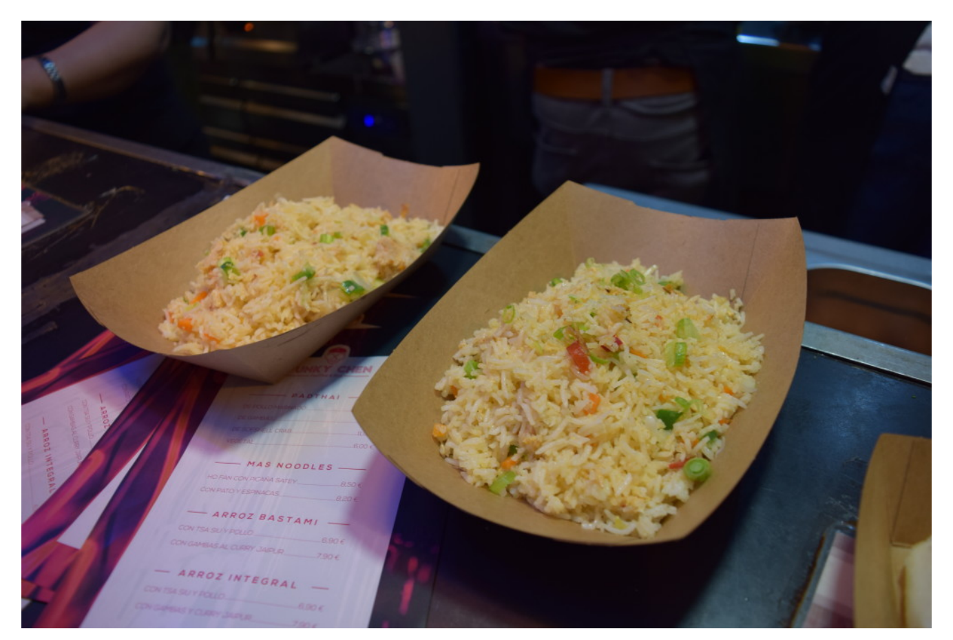
Veggie fried rice

If you're in the mood for something different than the same old neighborhood bar or quiet café, this is the place for you. With the spirit of a classic Madrid market, the hipster vibes of a Malasaña pop-up, and the exotic flavors of a faraway continent, Yatai Market should be at the top of your list.