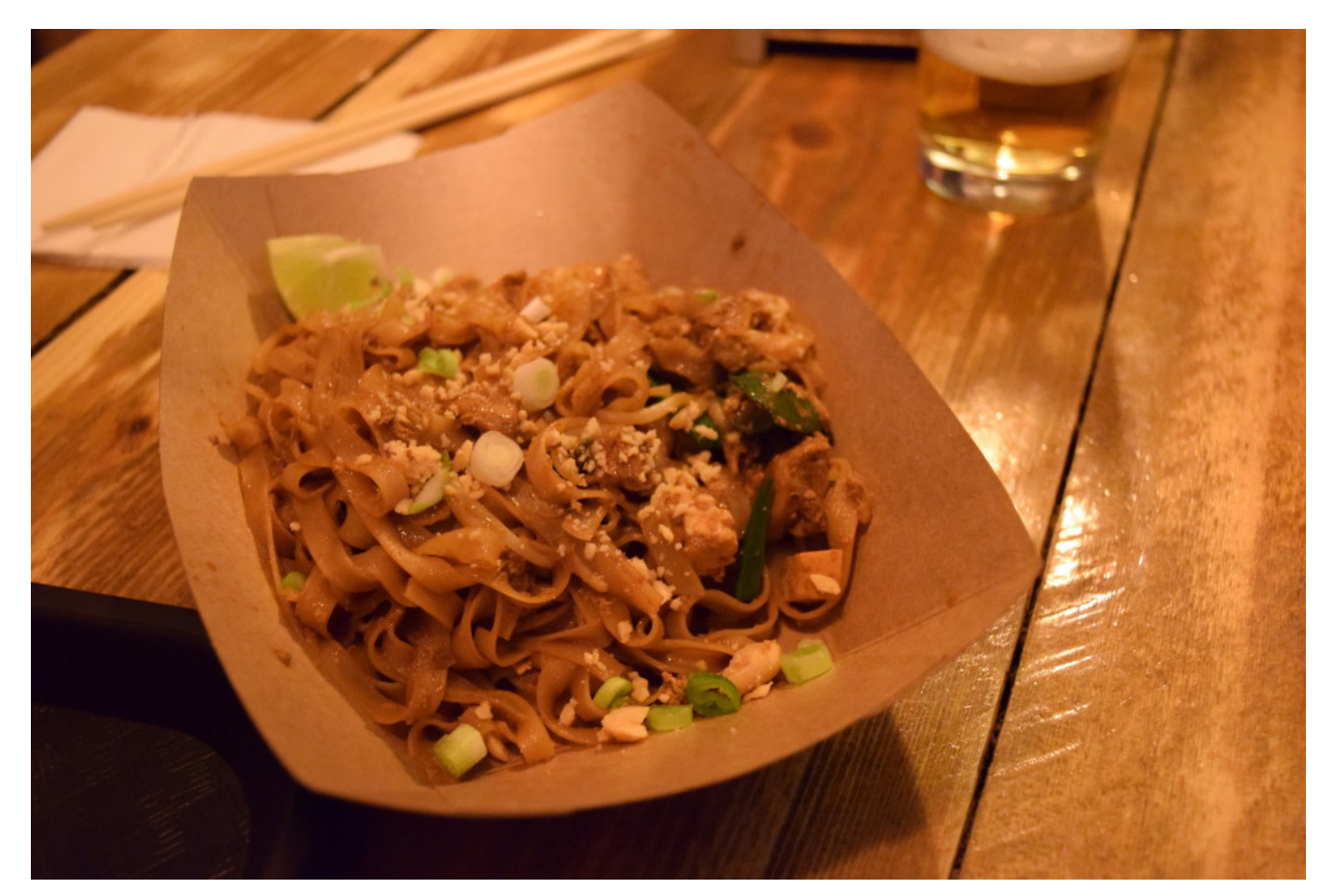
Pad Thai from Funky Chen

Not to mention the fact that prices are more than reasonable: you can get a roll or dimsum for as little as €1 or a bao for €4. Larger dishes range from €6 to €14. Asia Cañi even offers combo meals that include 2 rolls, curry, rice, and a drink for just €9.