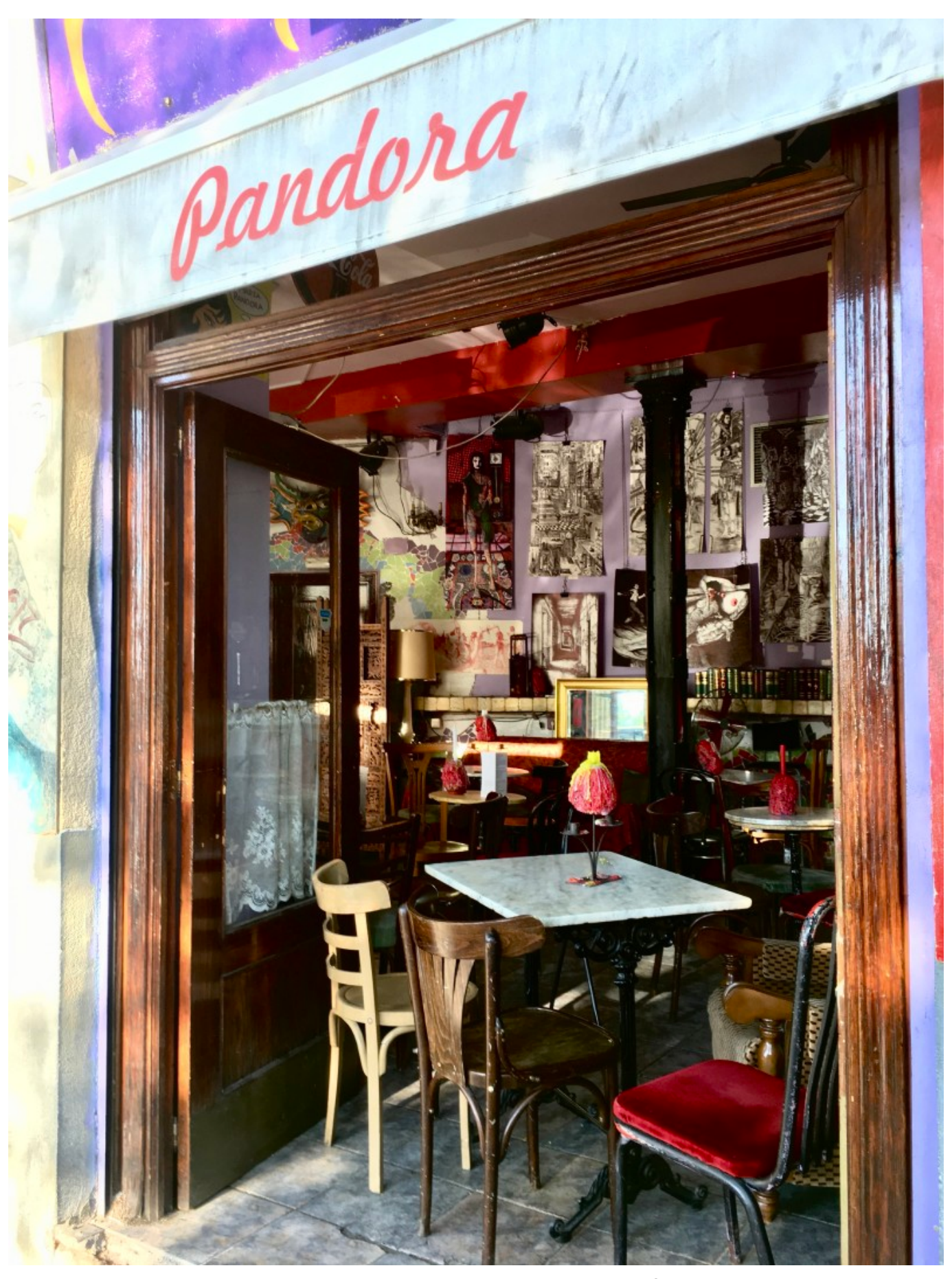
Cryptic, dripping golden letters read MARÍA PANDORA, and the sound of a dramatic poetry reading demand the curiosity of