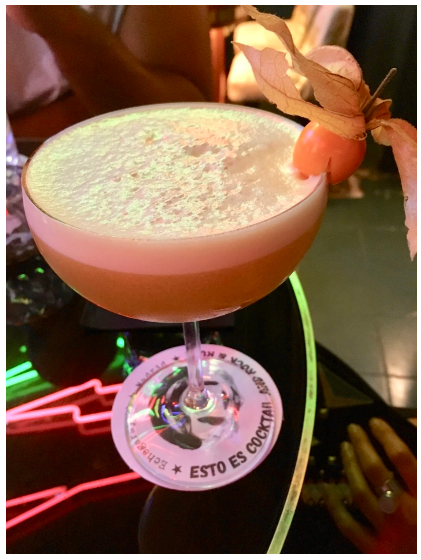
Pasión, a blend of rum, coconut milk and passion fruit