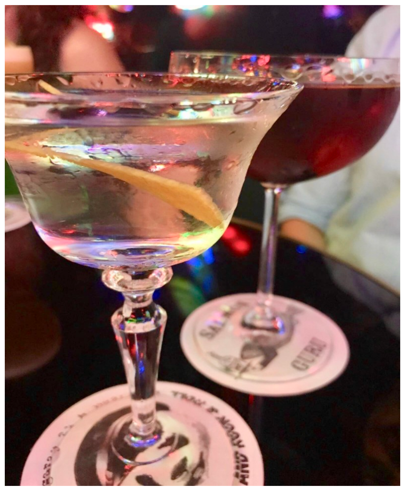
Vesper Martini & classic Manhattan

Need one more reason to check out Salmon Guru? The place is a must for whiskey lovers. If you don't see your favorite amongst the extensive selection of American bourbon and rye on the shelves, ask to see their secret whiskey menu.