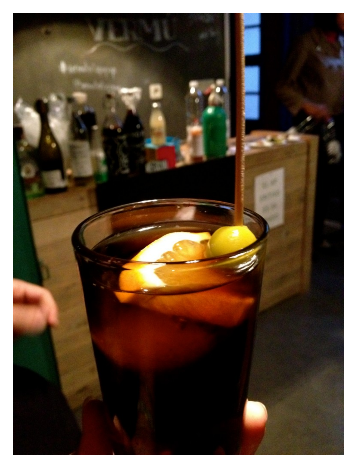
The ones responsible for all this are called Better , a young Madrid-based agency that throws pop-up events to promote