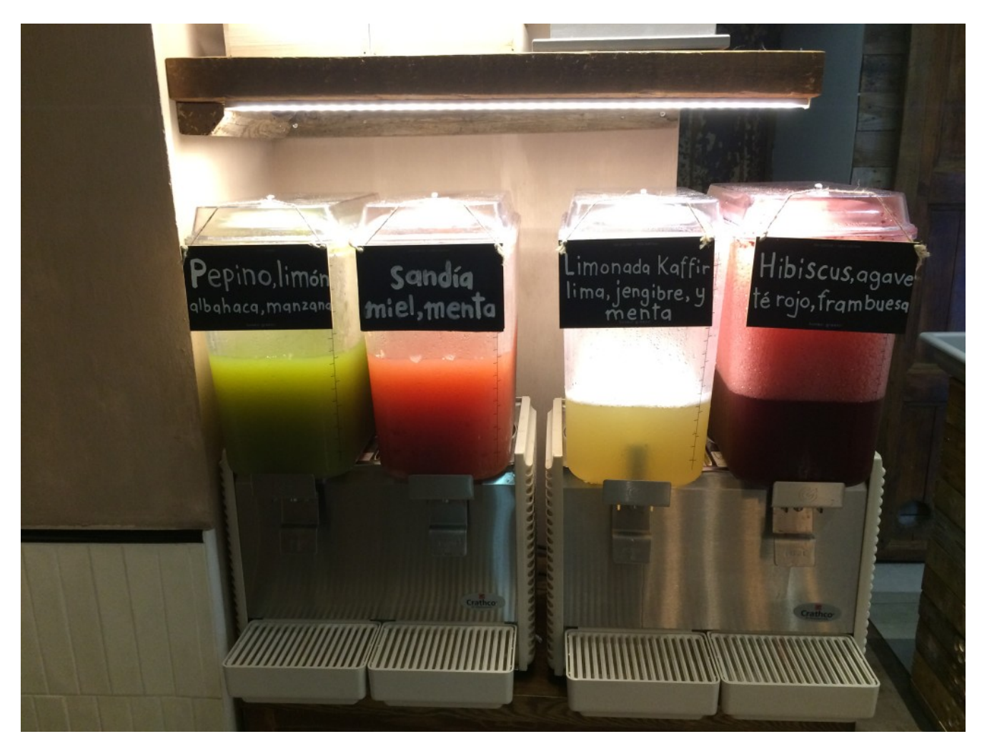
Self-serve aguas frescas

The portions here are generous and filling, proving once and for all that it's possible to feel fully satisfied after a healthy meal. But if you manage to save room, try one of the sugarless and gluten-free desserts . Their takes on classics like carrot cake and apple crumble might not be exactly what you're expecting, but they have their own charm. If you've got a real sweet tooth you might be disappointed, but it's totally worth it to at least give them a chance.