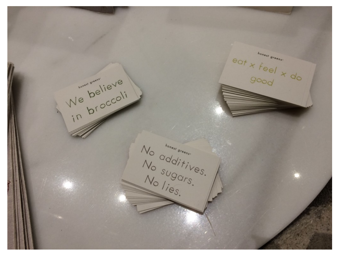
The business cards say it all

Whatever dietary camp you belong to, you'll find something here that fits your tastes. And the next time you're craving some good, honest greens… well, you know where to go.