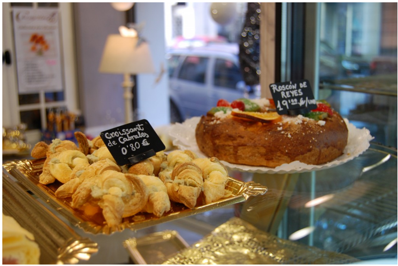
As well as all of the above, another reason why Confitería