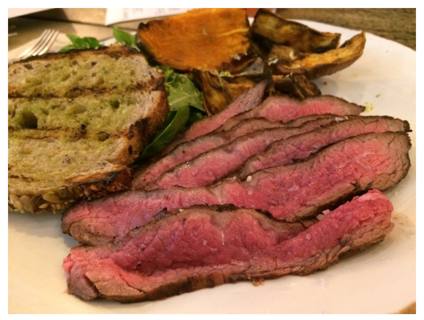
A market plate with ternera madrileña and roasted sweet potatoes