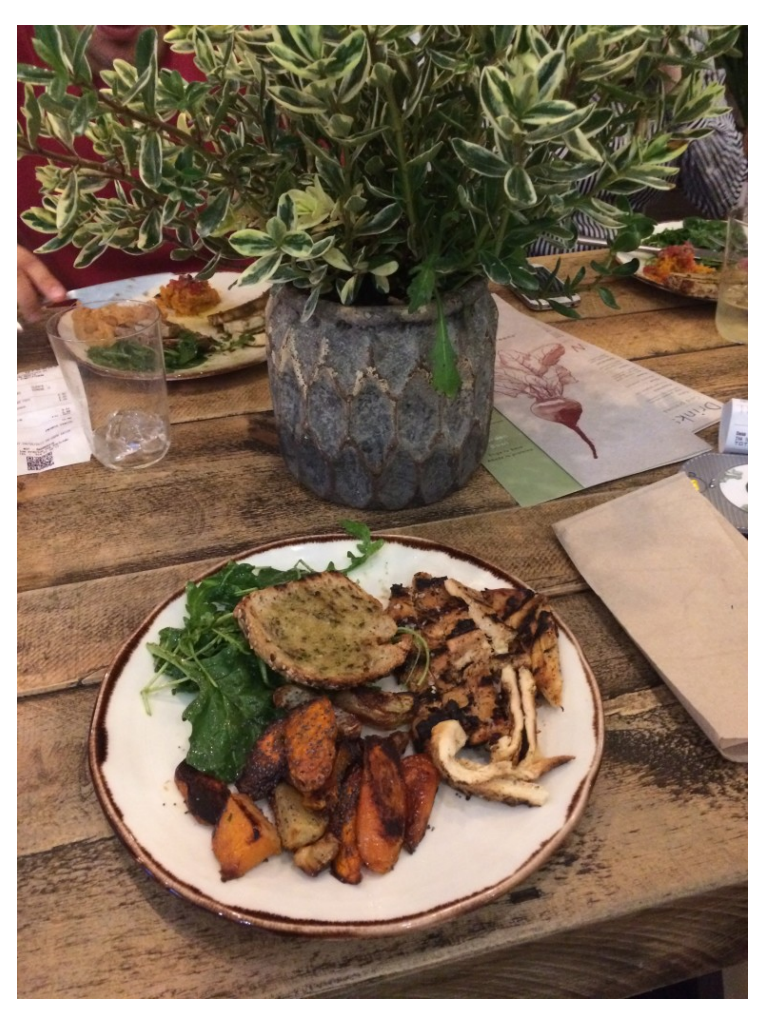
Chipotle chicken and seasonal vegetables

Is your mouth watering yet? I've barely gotten started. After you choose your base, you get to add extra sides from an overwhelming list. Cold options include coleslaw, beet salad, creamed eggplant, lentils, hummus, and roasted watermelon (yeah, you read that right). Hot sides include mashed pumpkin, baked cauliflower, roasted beets, herbed potatoes, seasonal vegetables, and organic sweet potato, each with creative garnishes ranging from spirulina to spiced yogurt.