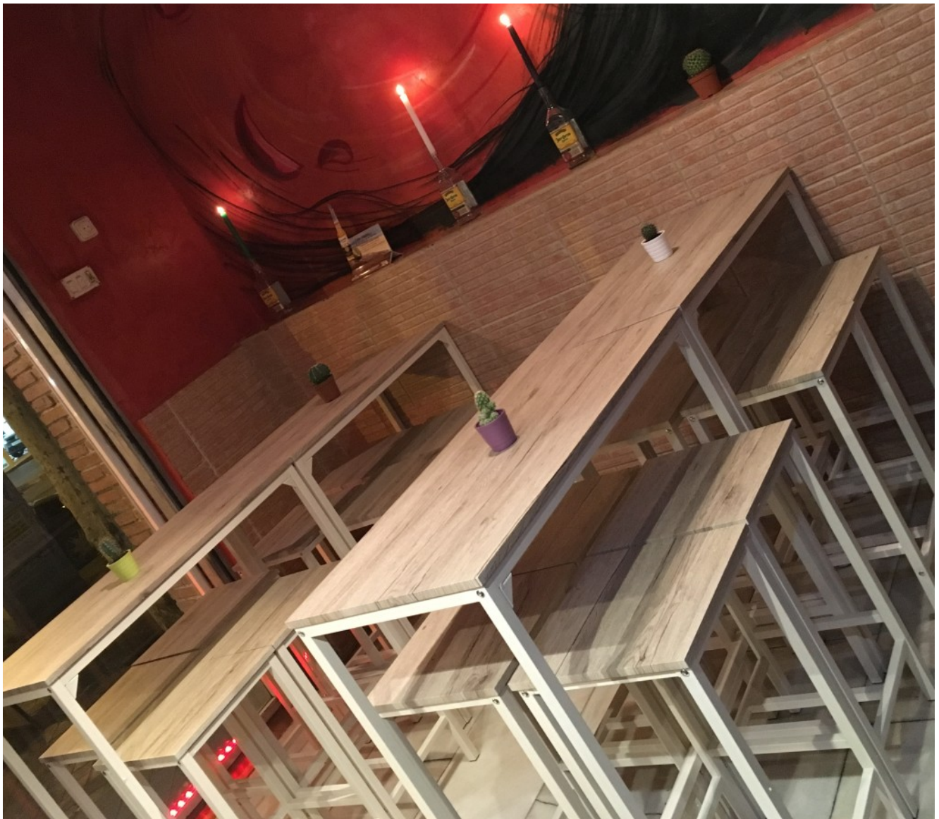
Taco Maya's cosy, minimalist dining area