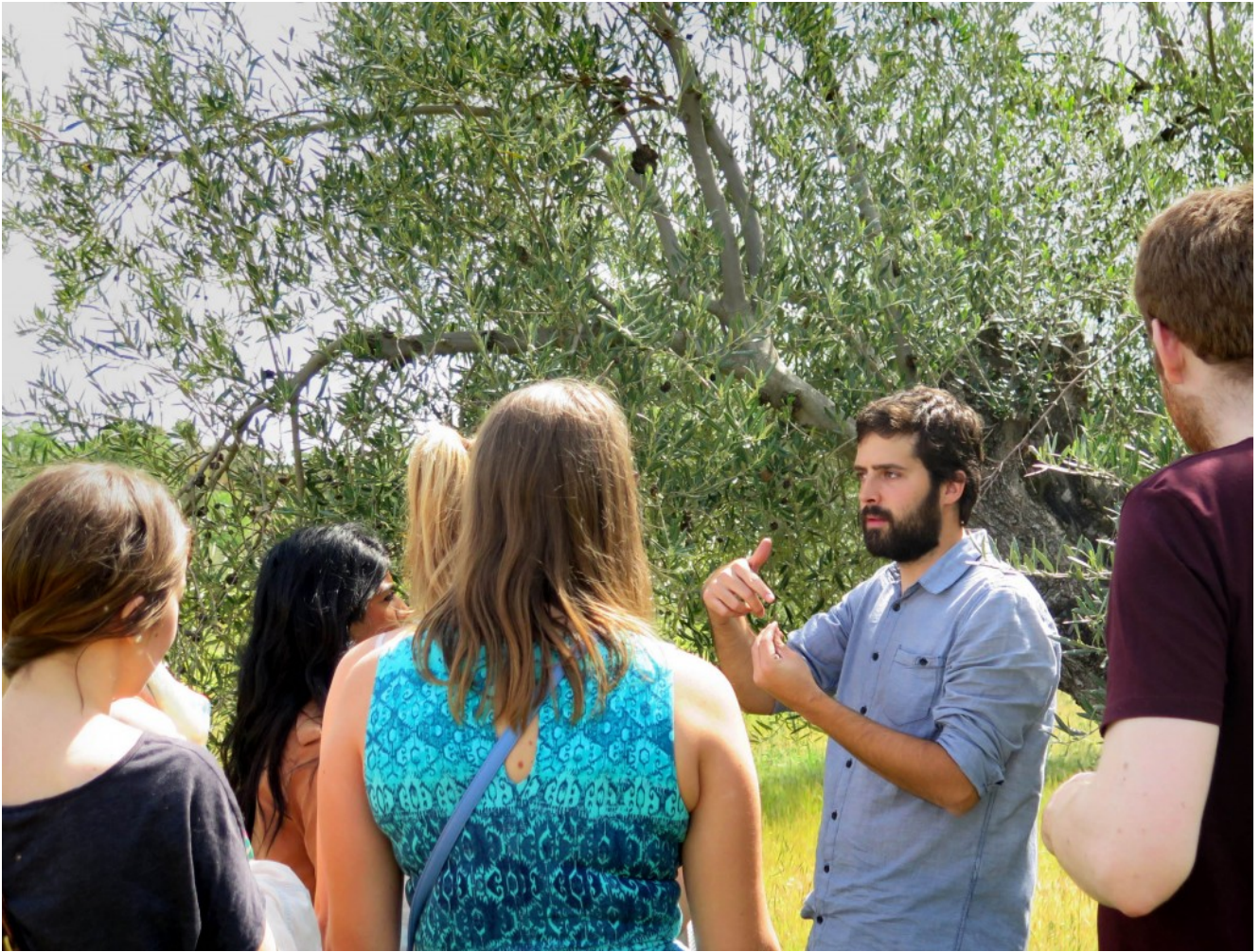
Taking a closer look at the trees

After the walking tour (and tanning opportunity), we sat down at a shaded table nestled idyllically among the centenarian trees. It was time for the tasting . This involved professionally sampling several olive oils in little blue glass cups, and learning how to tell the difference between generic supermarket oil and top-quality organic oil such as theirs.