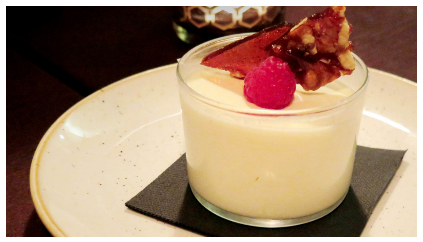
The Amaretto Connection

Despite being pretty full, we ordered the Margherita Cheesecake and the Amaretto Connection for all of us to share, because when a dessert is good enough (and you know what I'm talking about here), you'll find room for it.