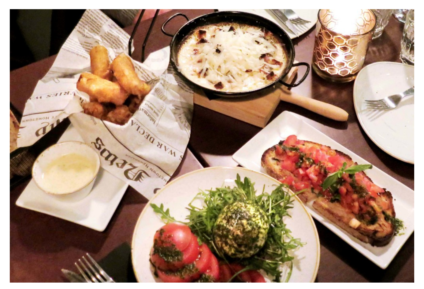
Smoking Bullets, Creamy Meatballs, Bruschetta and Burrata Tricolore