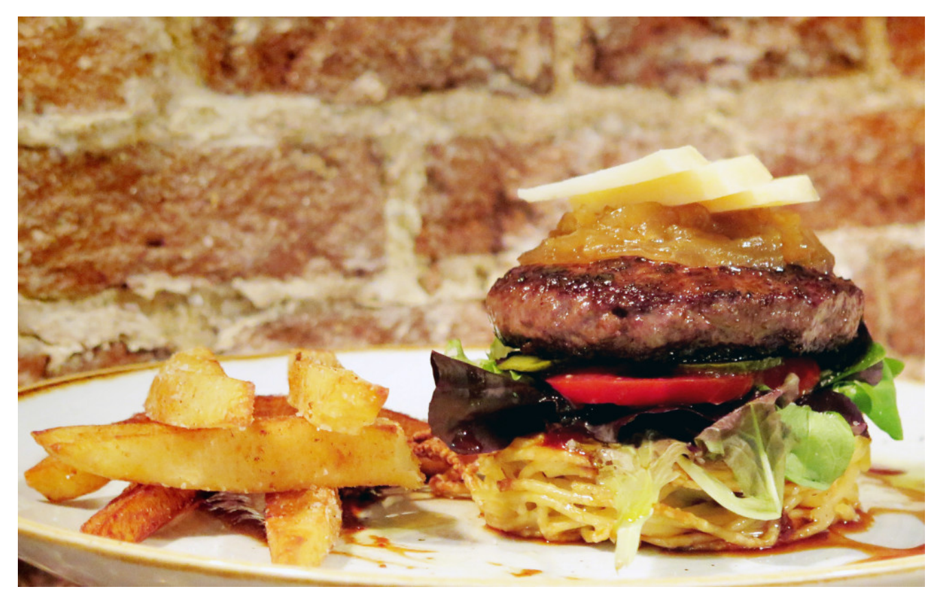
The Spaghetti Burger