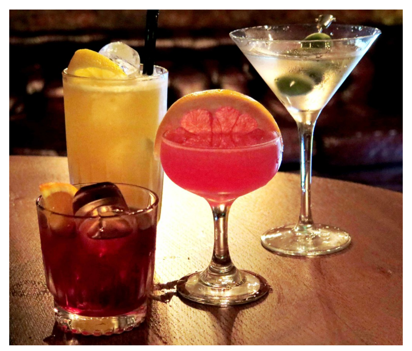
A selection of the classic cocktails

The infamous black market liquors of the Prohibition era echo throughout Luca's cocktails, which are strong enough to cut through all three hearty courses and still leave you feeling merry.