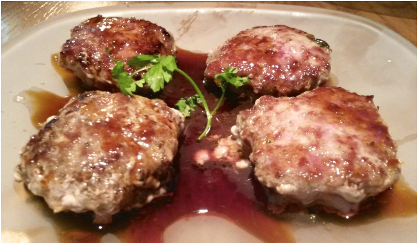
mini hamburguesas con reducción de Pedro Ximenez (sherry reduction)

One of our latest and most surprising discoveries was the tortilla de patata (Spanish potato and egg omelette). This Spanish staple is so common that it had never occurred to us to order it at Lateral . But don't be fooled, please do try their tortilla de patata right away. It's really one of the best I've had in Madrid.