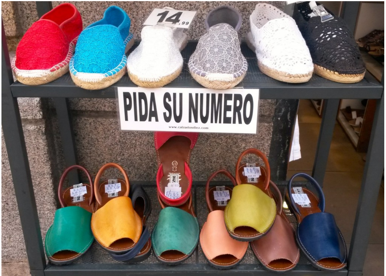
alpargatas at the top and mallorquinas at the bottom

Esparto (espadrilles), alpargatas and mallorquinas are the three most popular summer shoe styles originating from Spain. All can be found in any colour and in any standard shoe store (the center is littered with typical shoe stores, especially around Plaza Mayor and Calle Carmen which is right off of Sol). The latter two styles are unisex, so you're bound to find something for both your male and female friends and family. Since Spain is well-known for its amazing shoes, why not wow them with some Spanish summer footwear they can strut around their own city in style? Plus you don't have to limit yourself to the traditional ones. You can find snazzier versions too. You can also check out our post on " 3 Places to Find Espadrilles in Madrid " for more recommendations.