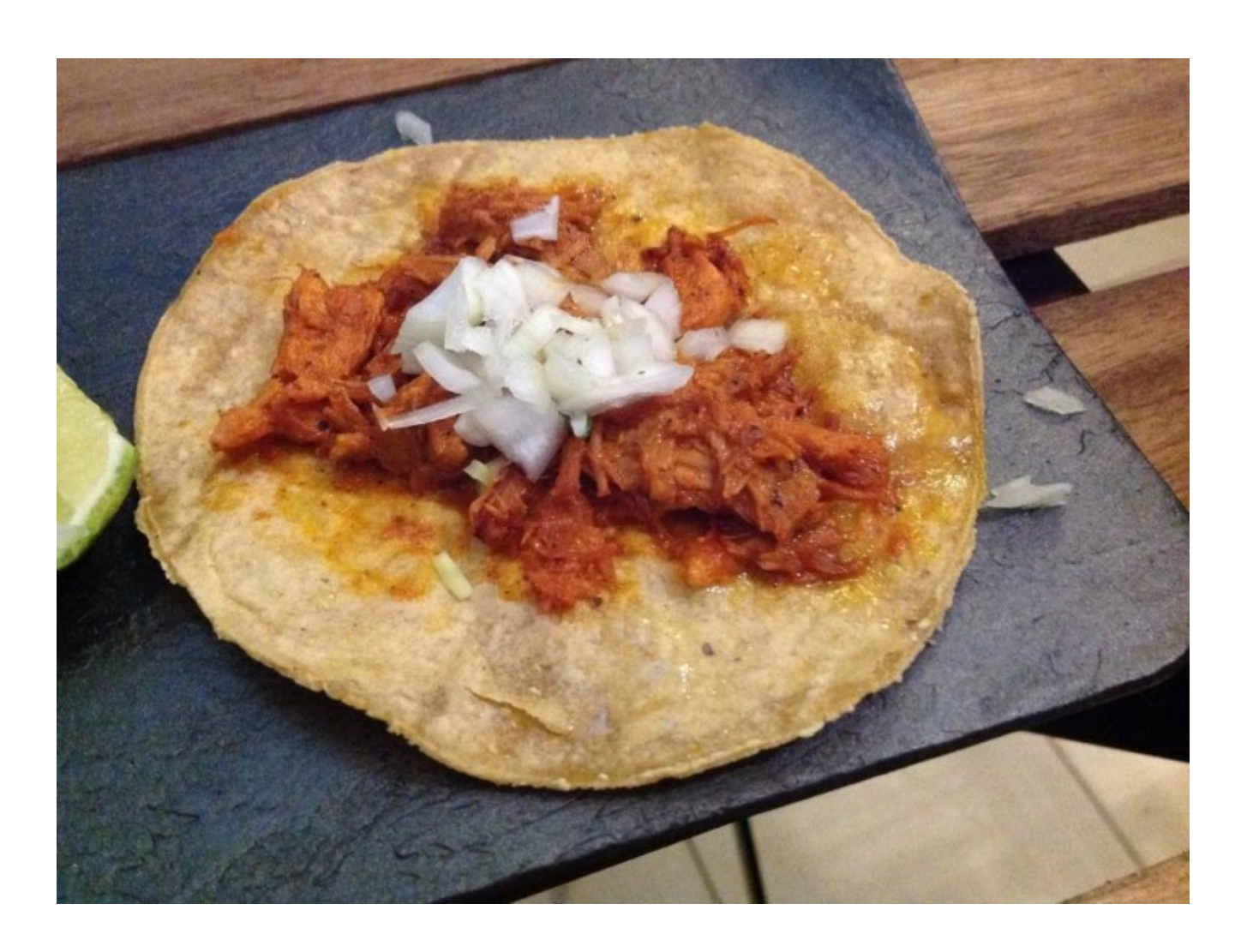
The last taco was Fajitas Alambre de ternera