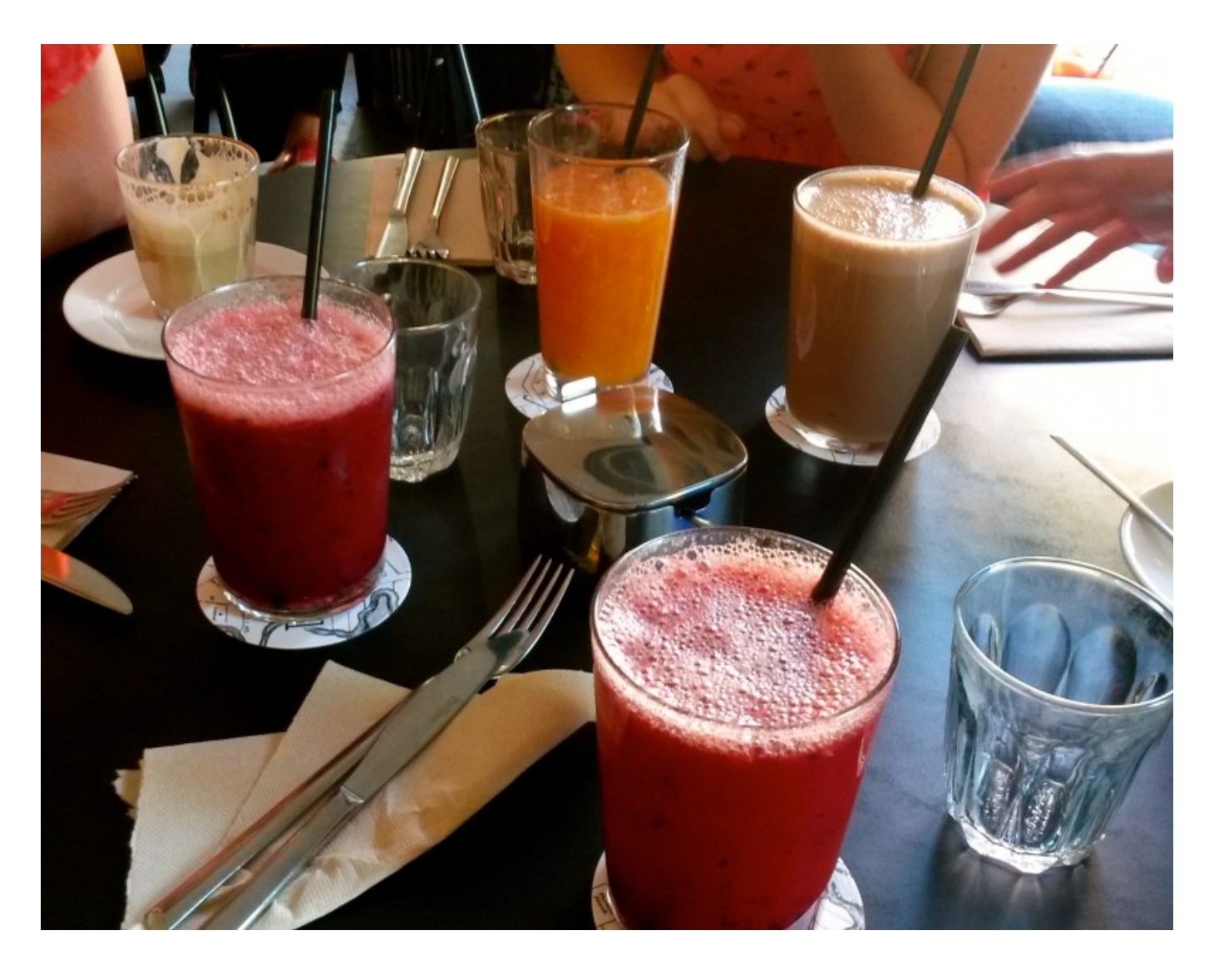
To eat, I ordered toast with avocado, poppyseed and lemon.