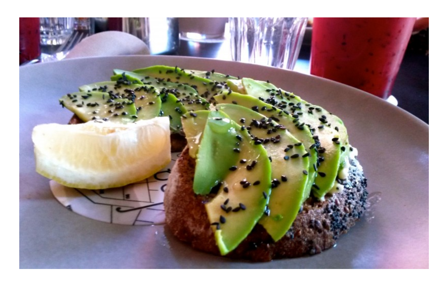
Aifric got the same, although with poached eggs (smart choice).