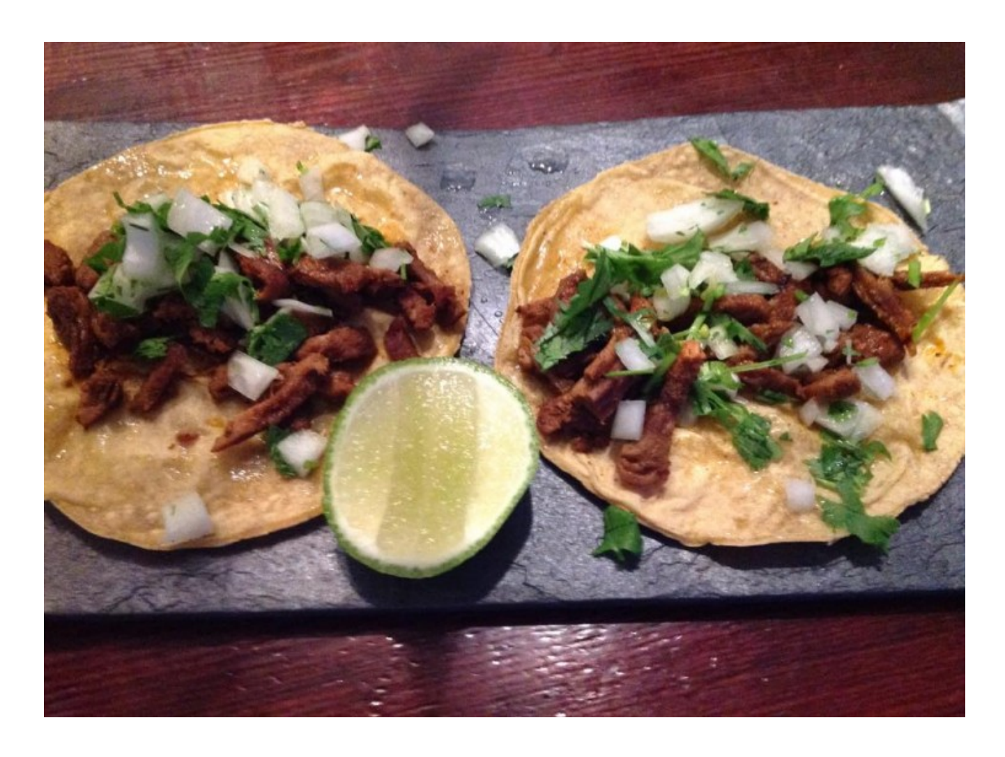
The second specimen was Cochinita de Pibil with achiote.