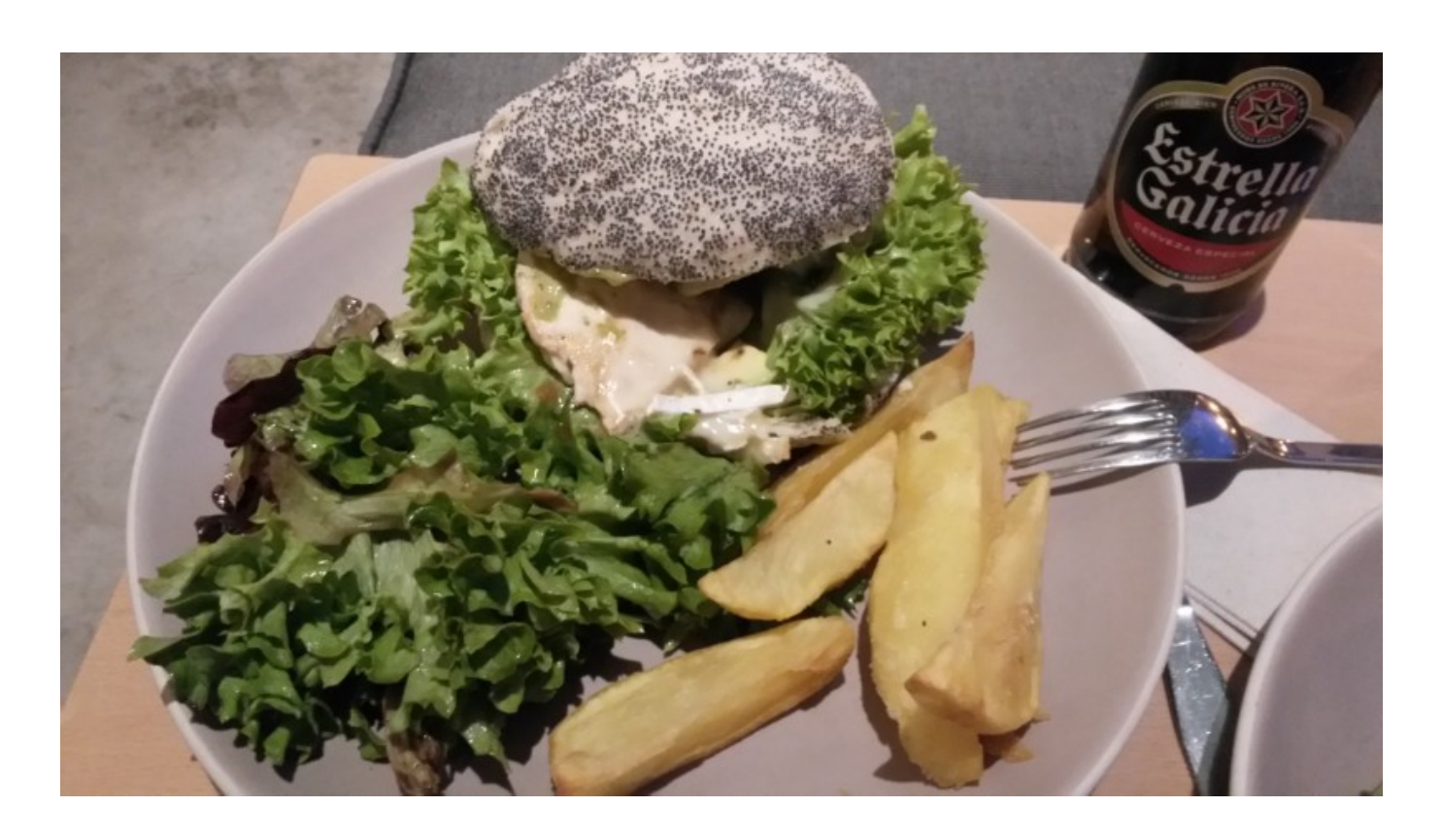
So if you're looking for a hip place with healthy food in the center of Madrid, I think you've found it!