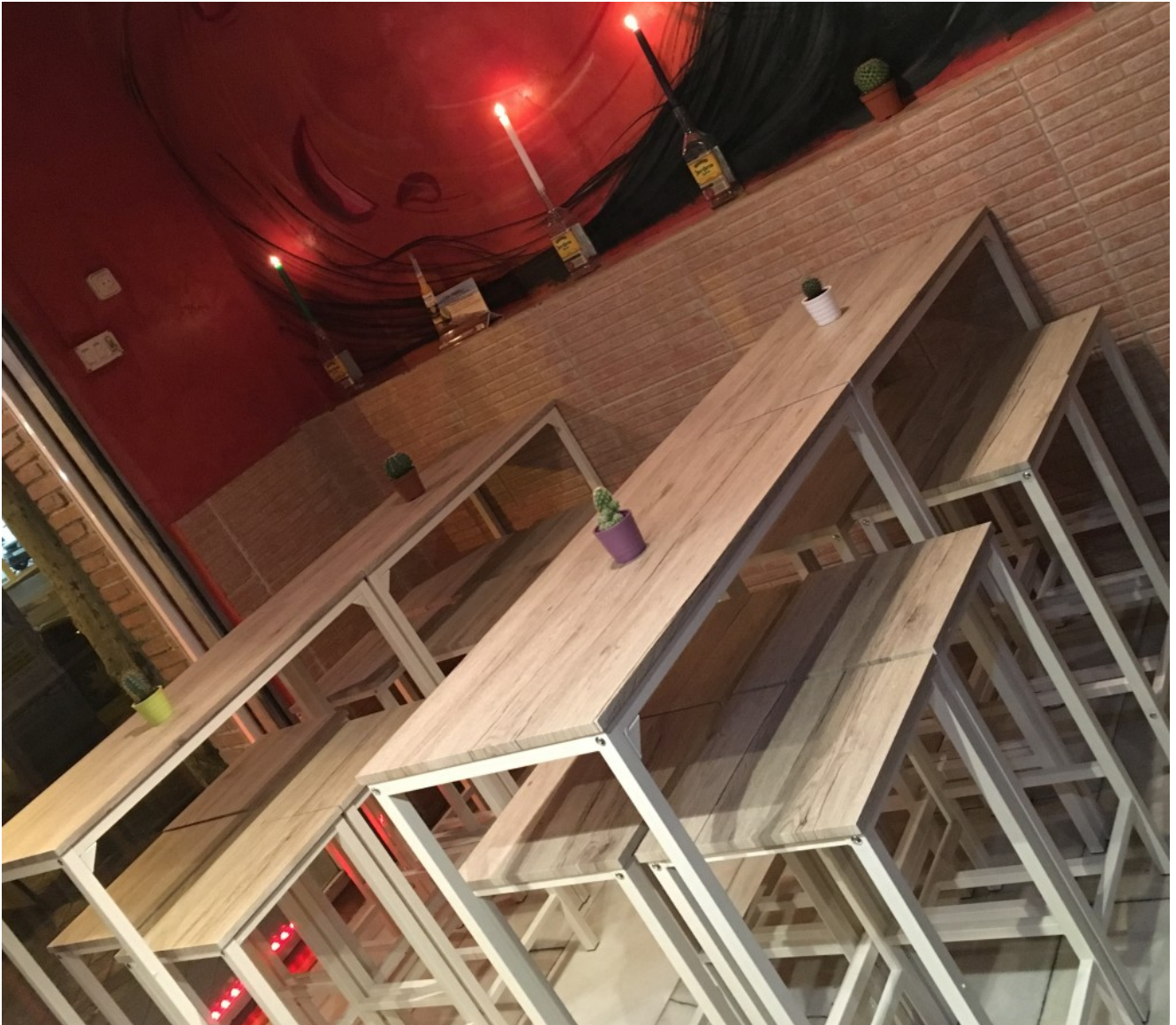
Taco Maya's cosy, minimalist dining area