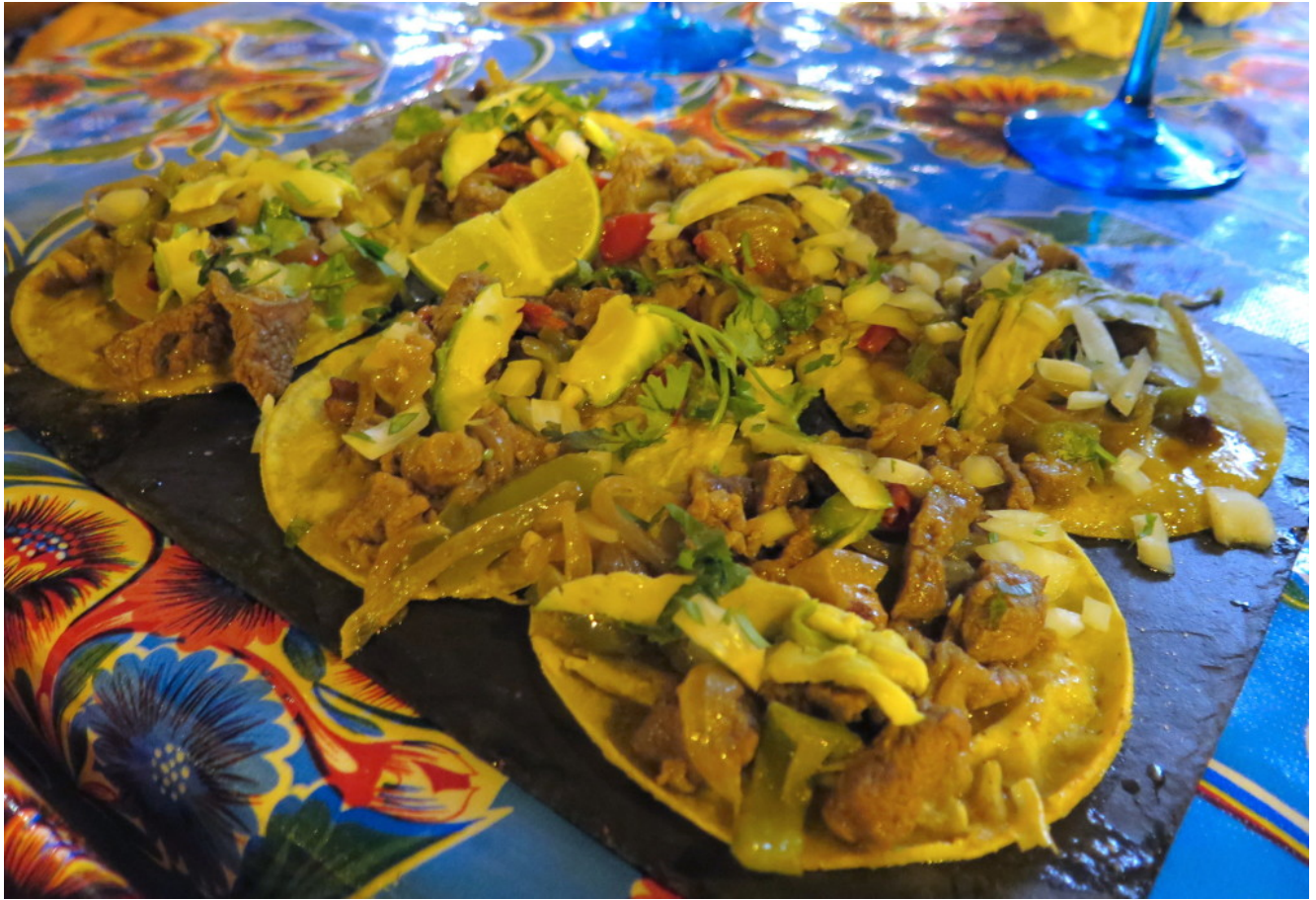
The Beef Tacos