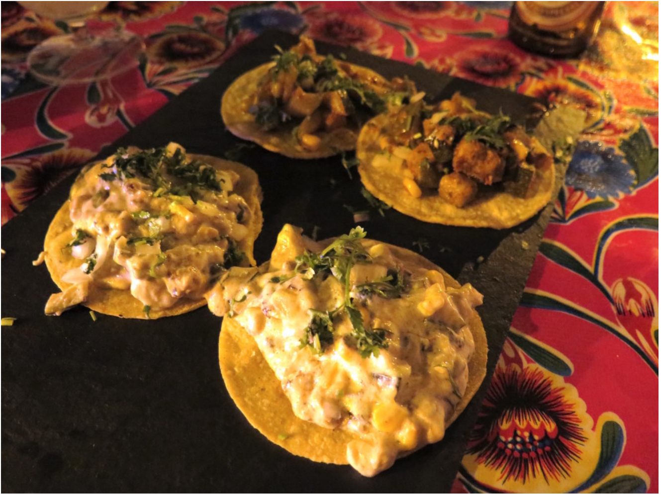
2 x Cheese Tacos and 2 x Lamb Tacos

The beef and guacamole tacos were juicy and moreish, and that extra squeeze of lime cut through all that tender meat perfectly. The veggie options included cheese and guacamole quesadillas, but pictured above we have courgette tacos and two tacos with a creamy vegetable and corn mix and plenty of fresh coriander on top. Having said all that, the tacos themselves were so fresh and you could really decipher their flavour.