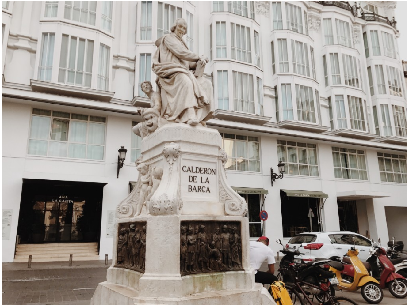
Monument Calderon de La Barca