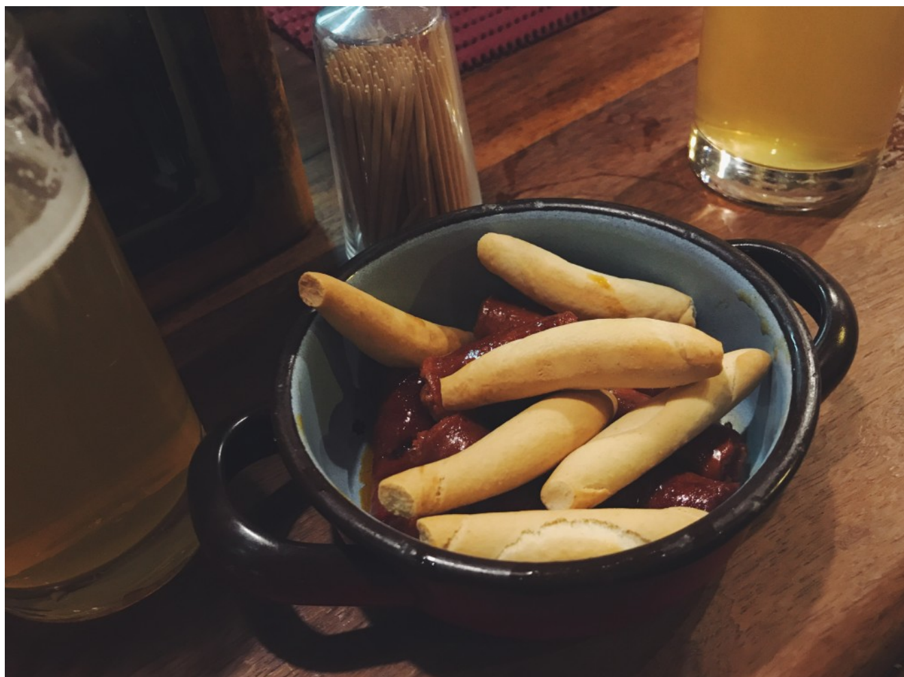
Typical free Spanish tapa

dedicated to Spanish painter Julio Romero de Torres. Even one of his paintings is depicted on these beautifully detailed tiles.