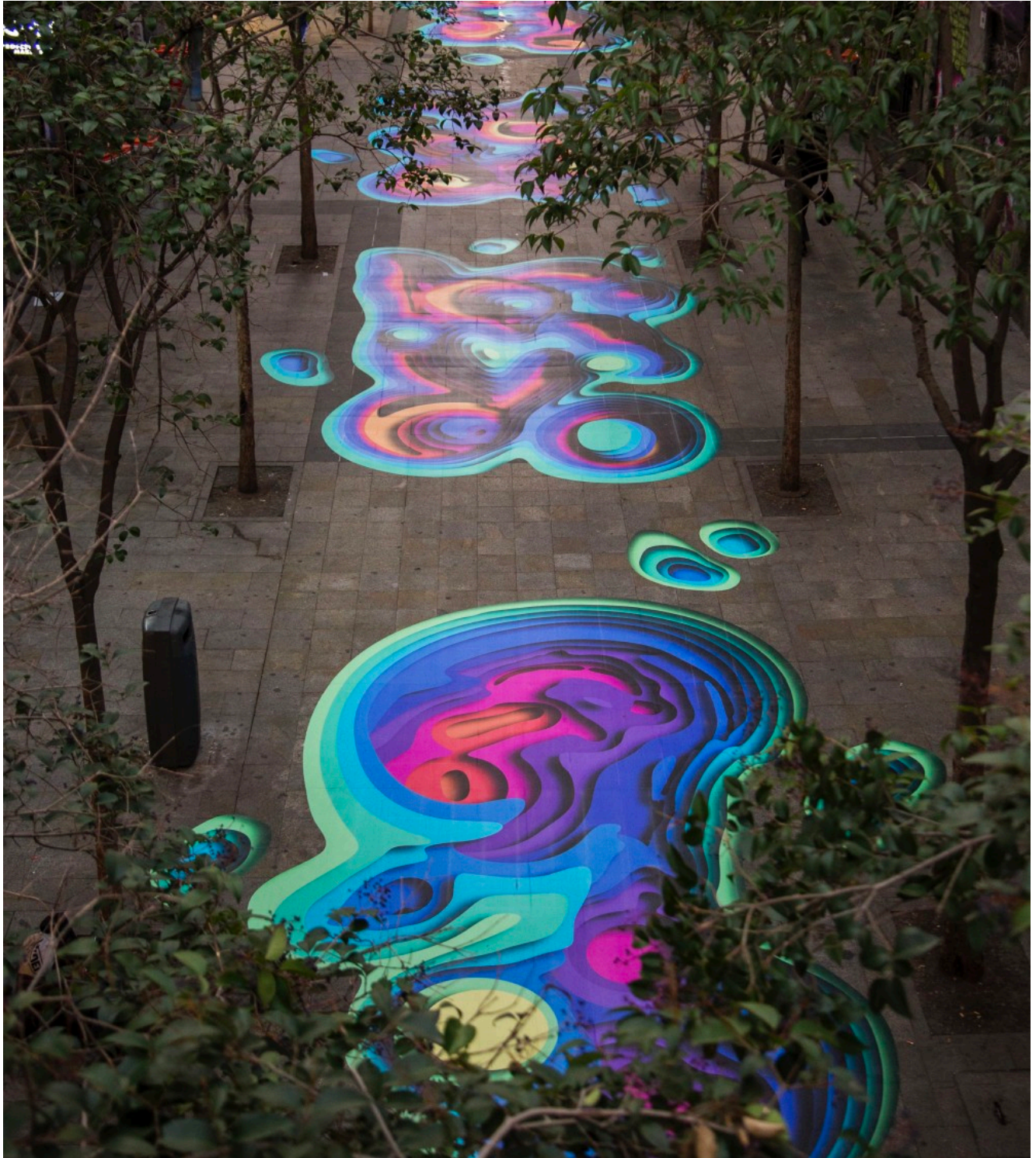
art installation on Calle Fuencarral by German artist 1010