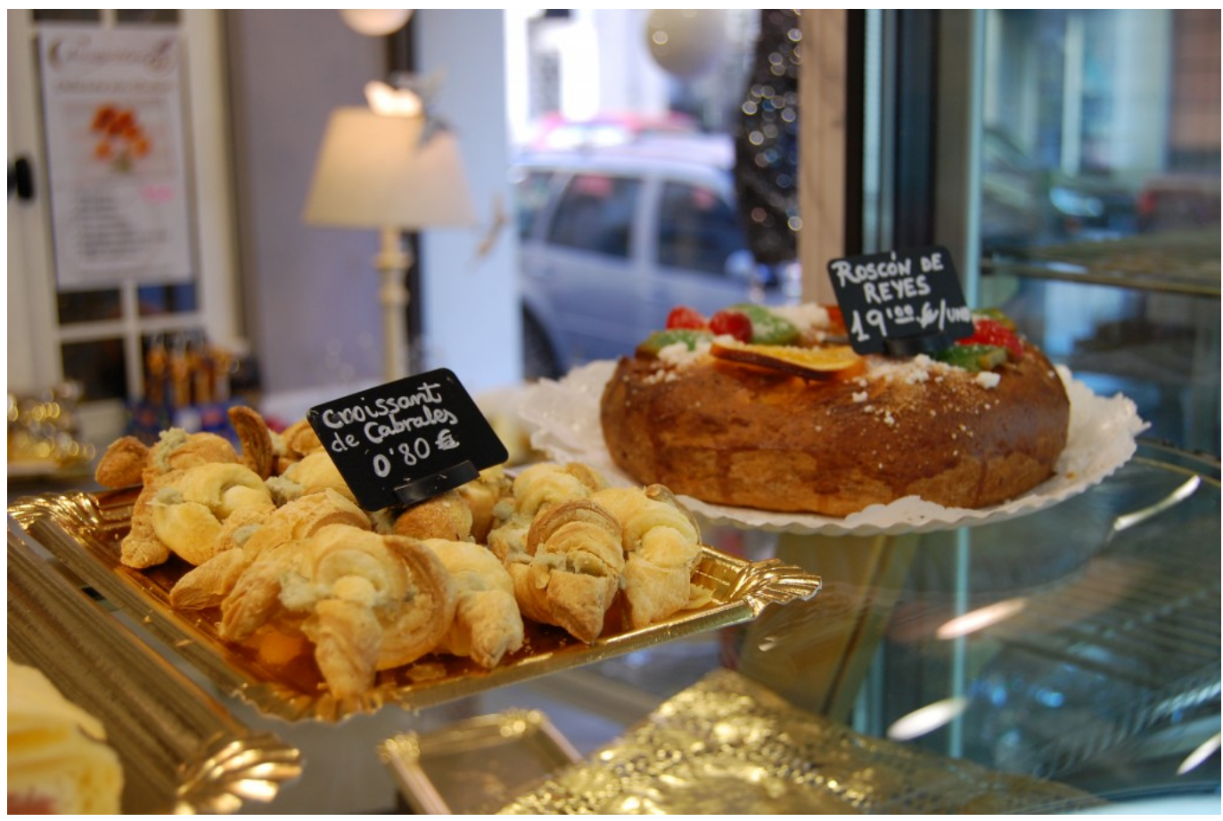
As well as all of the above, another reason why Confitería