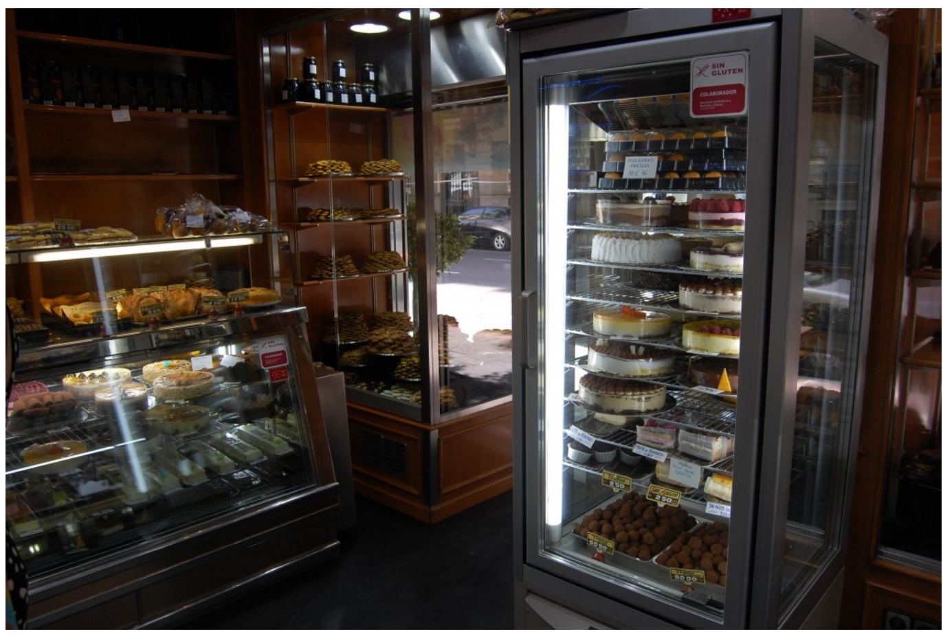
It is not hard to find the gluten free goodies as the shop is