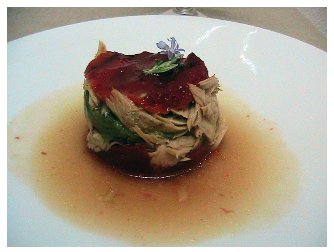
One of the delicious tapas served in the barrel room on my last visit- a tuna, sautéed pepper and vegetable stack, with edible flower

If you have a food allergy, Pago de Carraovejas are up to the job. They can adapt their tasting menu to gluten free and lactose free diets if you let them know in advance- and they will even serve gluten free bread. You might also want to let them know if you don't want to eat 'cochinillo' (baby piglet fed only milk and slaughtered at 15-20 days old), if you are a vegetarian, vegan or have certain meat eating beliefs.