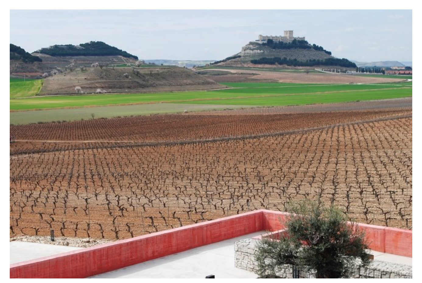
Pago de Carraovejas in winter, photograph taken by my colleague and wine expert Raul Buendía. As the seasons change, so do the landscapes- with so many vineyards, each season brings unique stunning views

If you tour their winery, not only will you taste their fantastic red wines throughout the tour in different winemaking rooms (a refreshing take on the traditional end-of-tour wine tasting), but you will also get to enjoy 3 delicious tapas dishes (including 'cochinillo') that have been carefully elaborated in Ruiz's dream restaurant to pair with the wines.