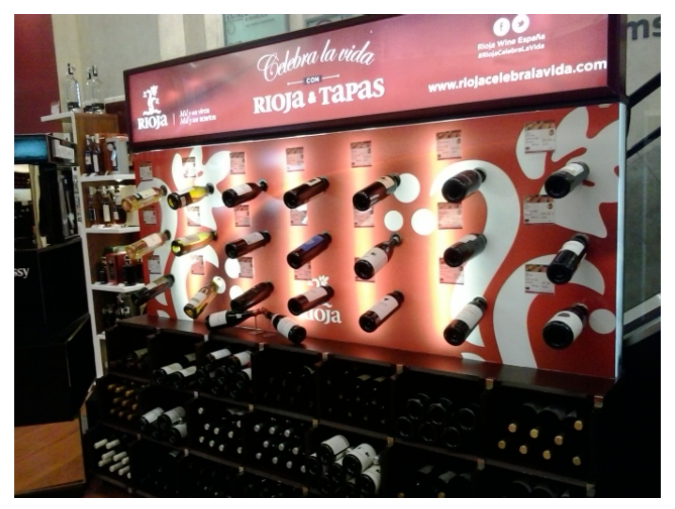
The D.O. of Rioja has launched a gastronomic competition this autumn in which the best gastro bars across Spain compete for the best tapa. Lavinia's entry: Lasaña de morcilla