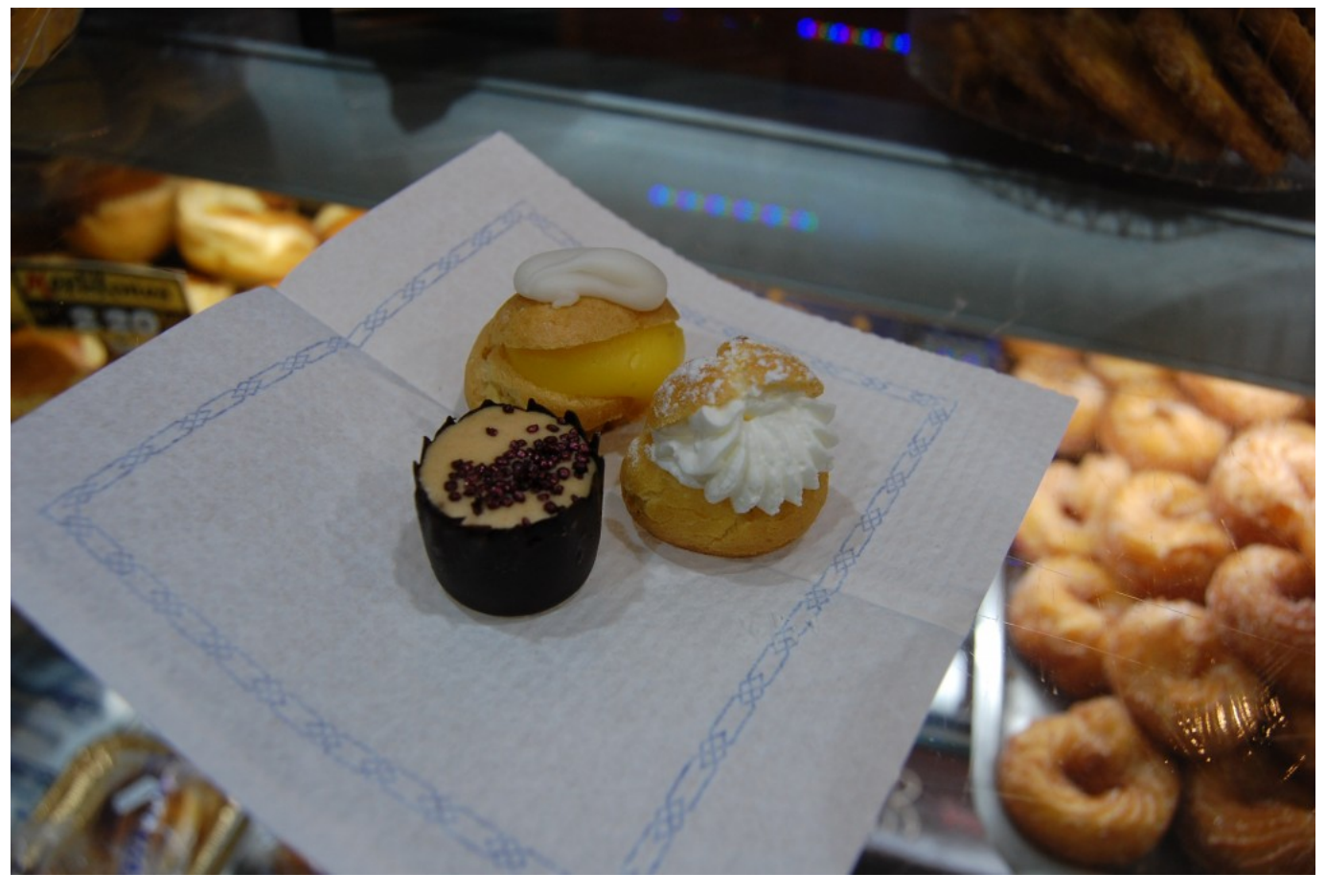
Each tray is slightly different, with six rows of beautifully