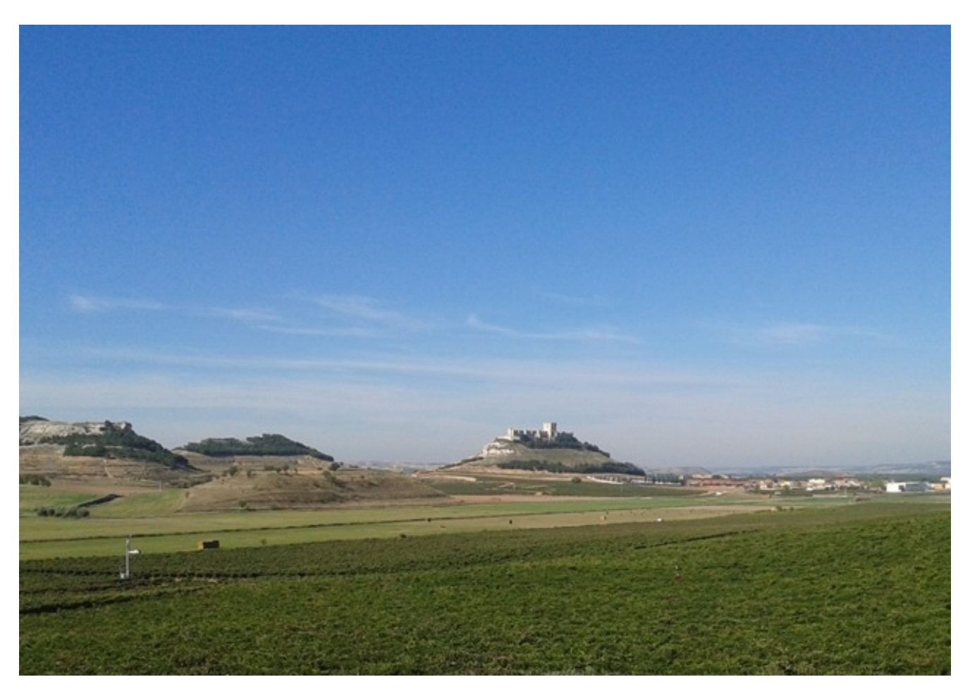
The vineyards of Pago de Carraovejas in its special valley this summer 2014, with views of Peñafiel castle in the distance

Years later, and just 3km outside Peñafiel, Ruíz´s impressive winery is in the perfect location in a sunny valley, protected by the hills from the North Wind and close enough to the river.