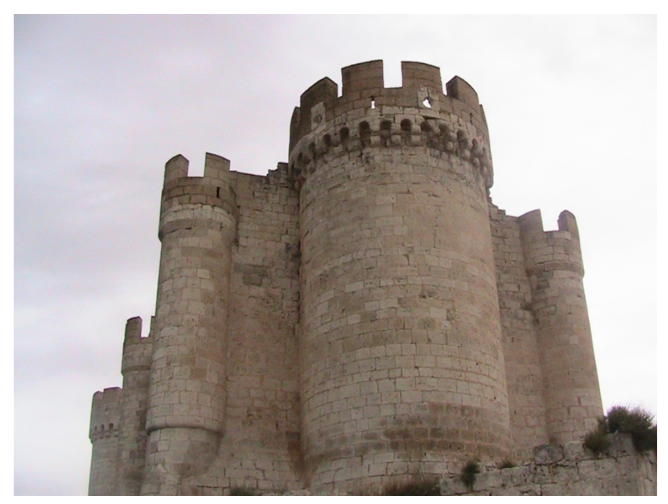
The castle of Peñafiel

incredible collection of Middle Age castles. On my last trip, I visited the official 'National Monument' of the castle of Peñafiel, which is located where all good castles are- on top of a hill.