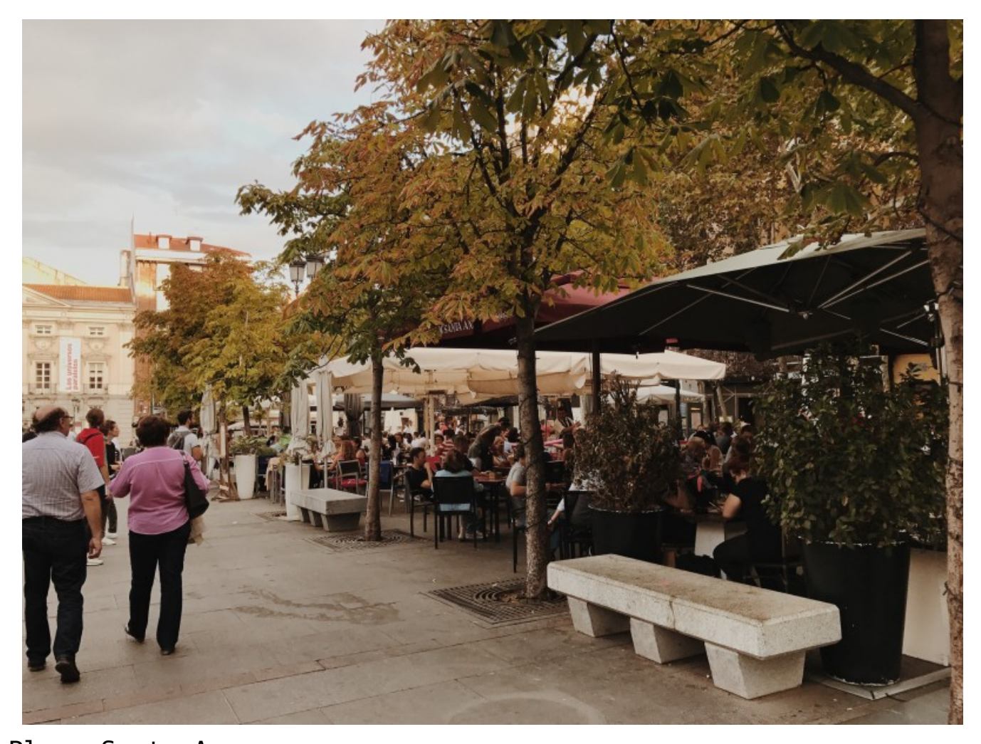
Plaza Santa Ana

When I first moved to Madrid I walked that well trodden path like so many ex-pats had done before me; the month long TEFL course. I rocked up with my Spanish phrase book, some SPF 20 and the overwhelming desire to live abroad. With no set plan (well, with no actual plan at all having quit my job in PR back in London) I quickly got into the groove of my new TEFL timetable; which essentially meant a 3pm finish. As soon as my 'working' day was done, I would wile away afternoons in Plaza Santa Ana.