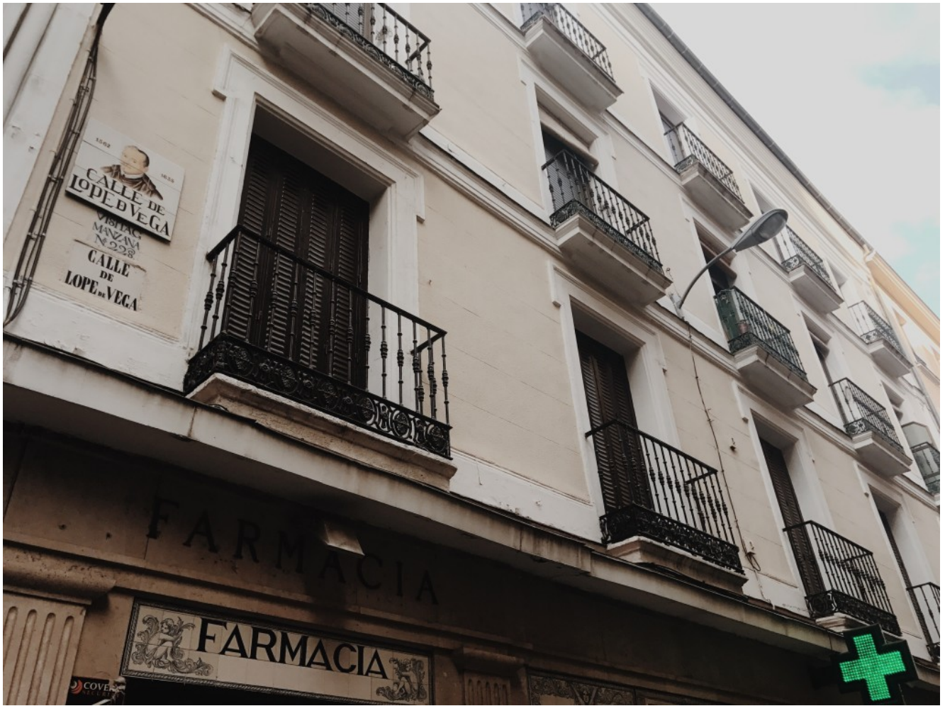
Calle Lope de Vega

Nowadays, this historic neighborhood has become a trendy spot for people to get together and have a drink paired with a few tapas. Calle de las Huertas is the main street where you can easily find great shops, cafes, and some of Madrid's finest eateries.