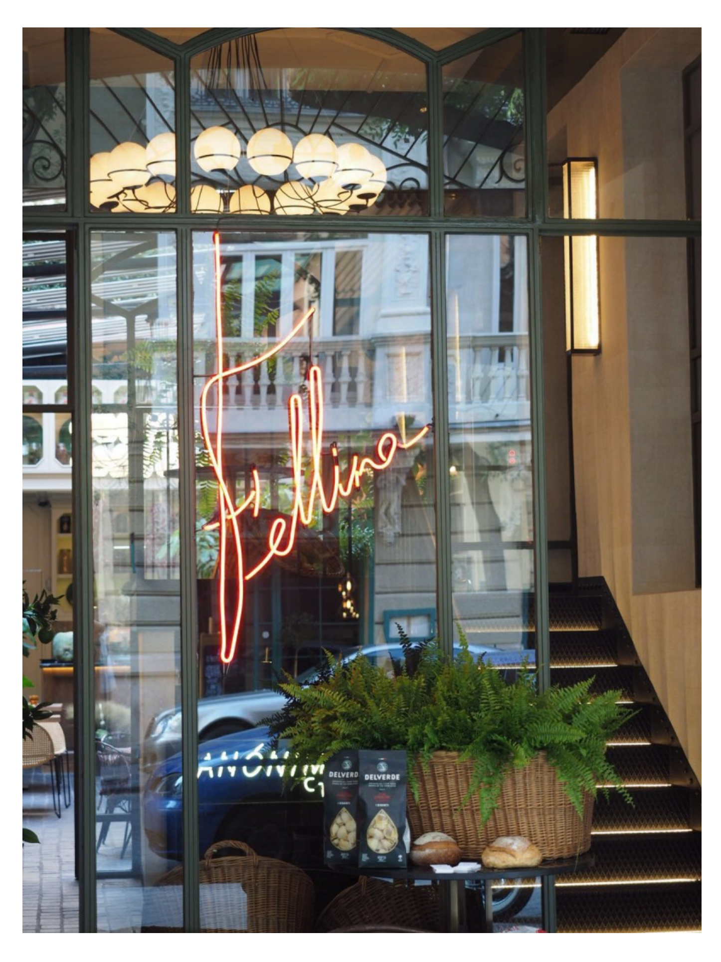
In complete contrast to El Columpio is the newly opened <a href="Fellina">Fellina</a>, which literally waves to El Columpio from