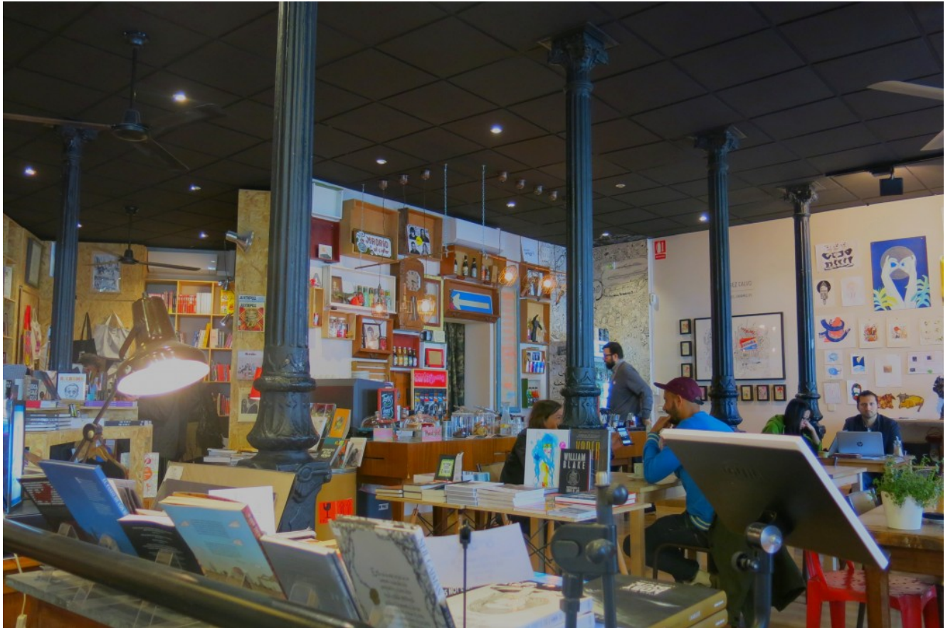
Swinton & Grant, Embajadores

a café-bookstore. In the basement, the Swinton Gallery , a large space for local artist exhibitions.